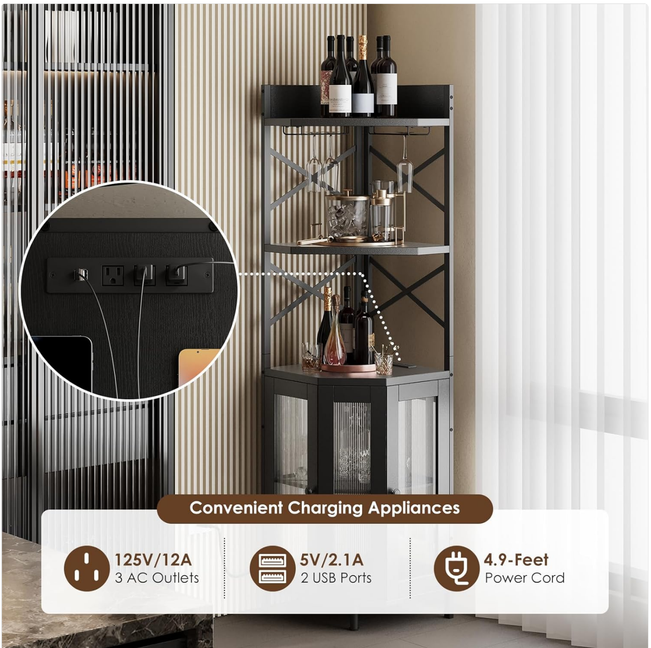
Figure 3: The integrated charging station with AC and USB ports for convenient power access.