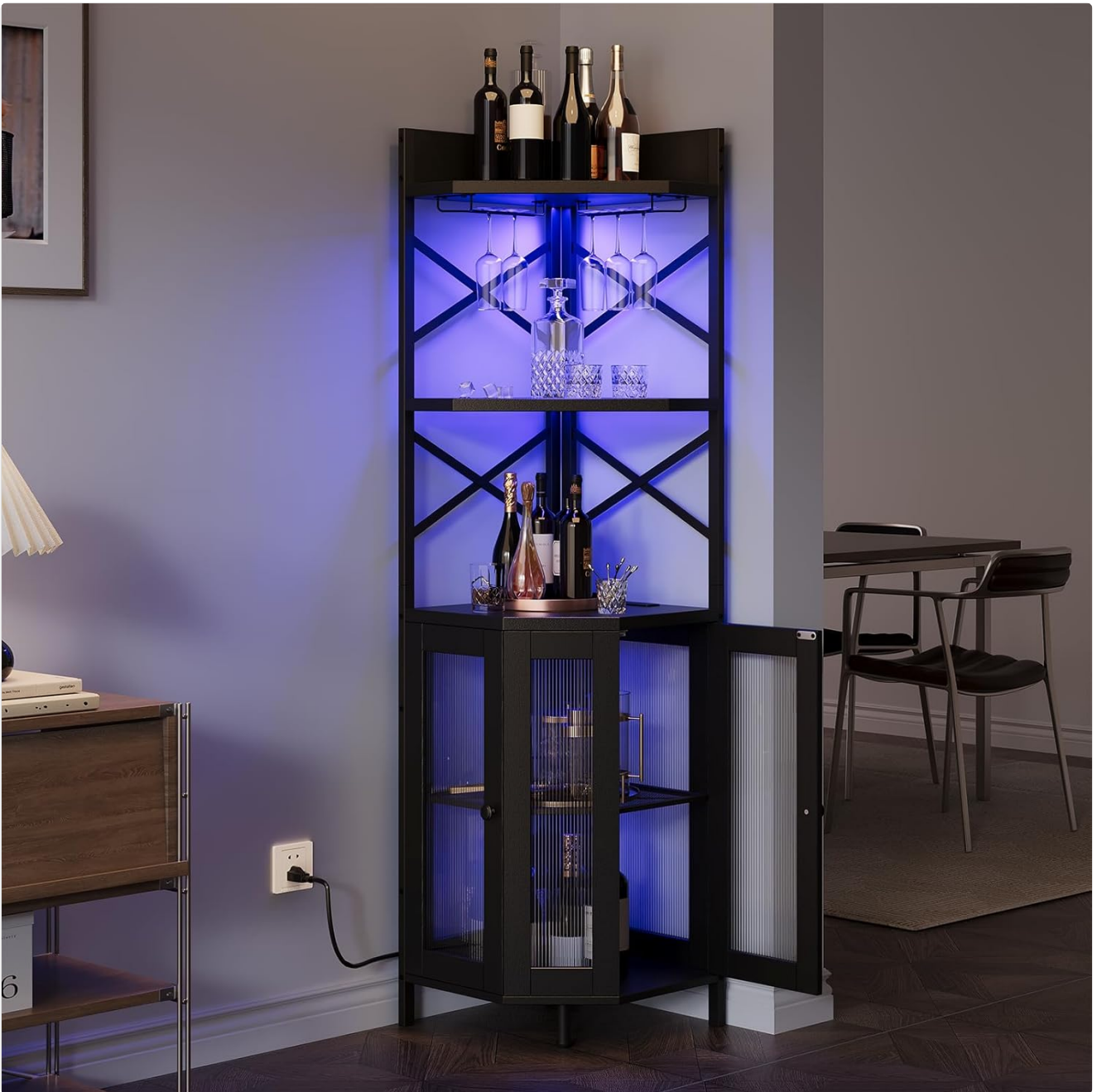
Figure 1: The Airynee Corner Bar Cabinet, showcasing its integrated LED lighting and storage capabilities.