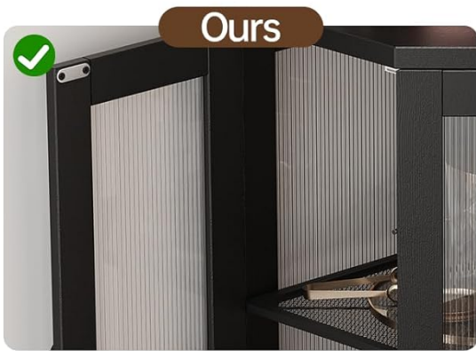
Transparent Doors Easy to clean