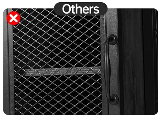
Mesh Doors Easy to accumulate dust and difficult to clean