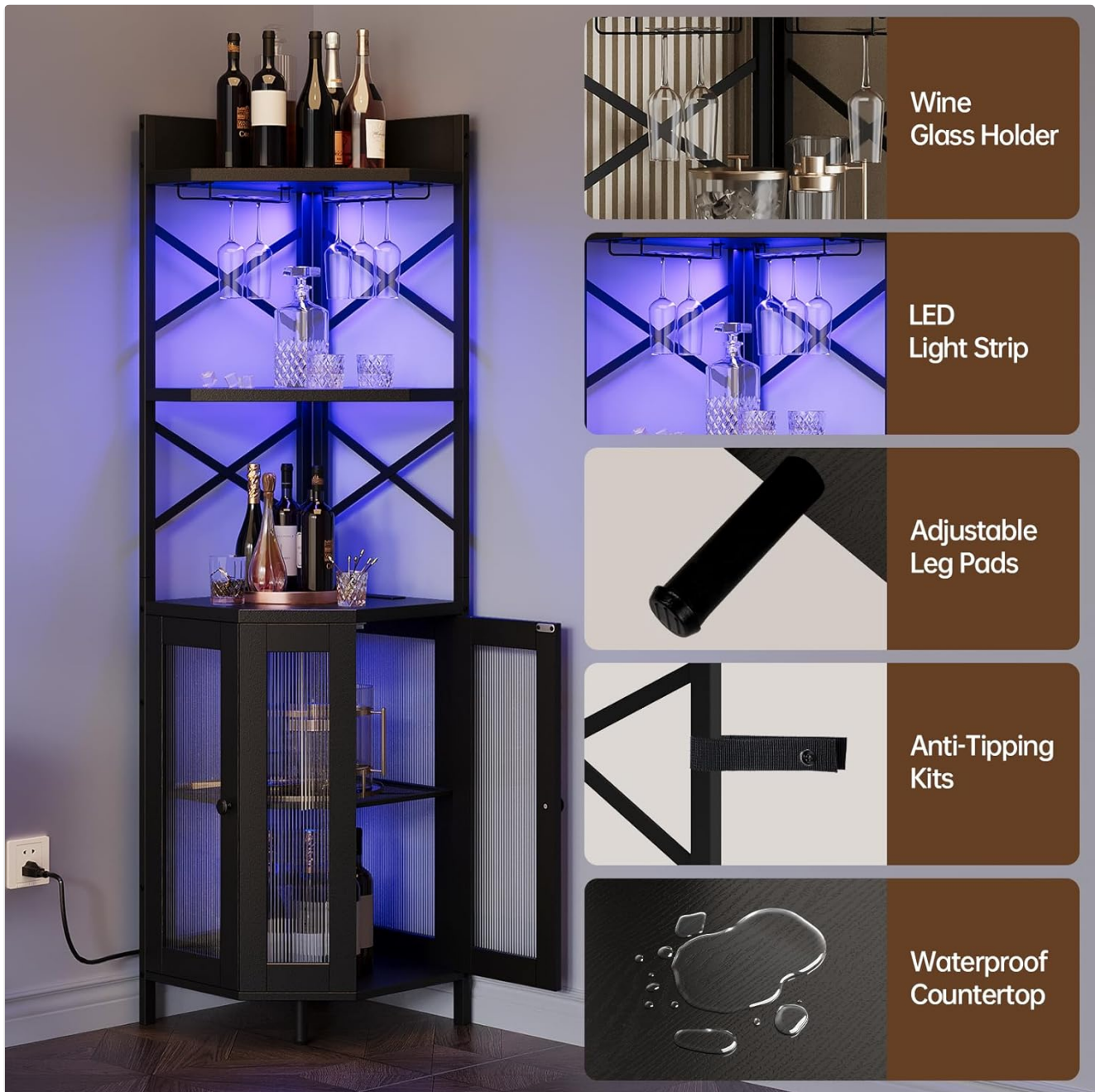
Figure 2: Key features such as the wine glass holder, LED light strip, adjustable leg pads, anti-tipping kits, and waterproof countertop, which are integrated during assembly.