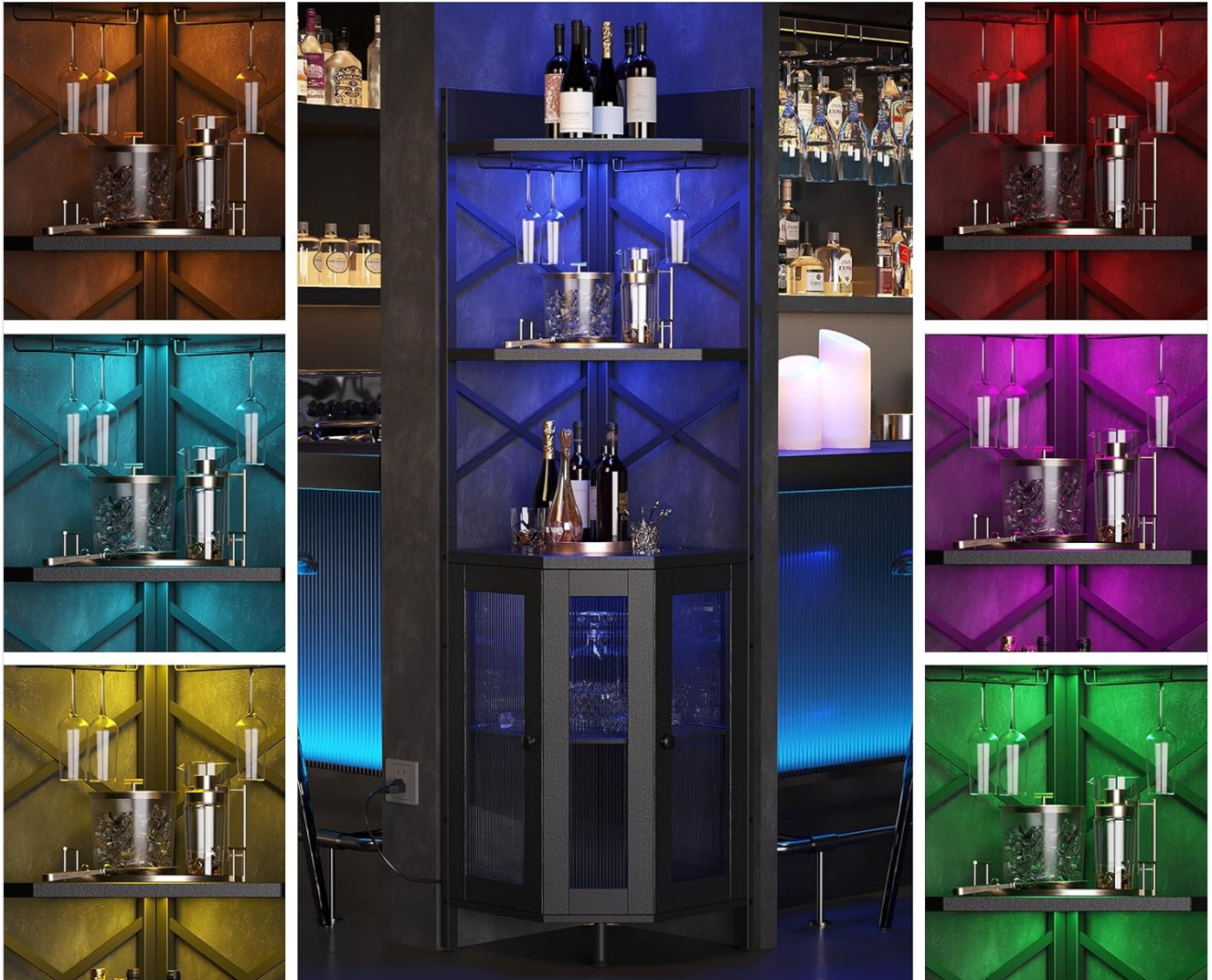
Figure 4: The RGB LED lighting system offers extensive color options and smart control features.