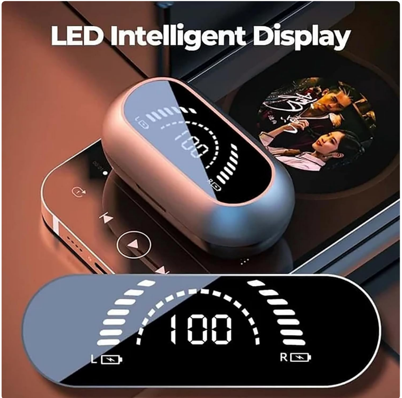
Image: Close-up of the Earbuds Pro charging case displaying battery levels for both left and right earbuds, and the case itself.