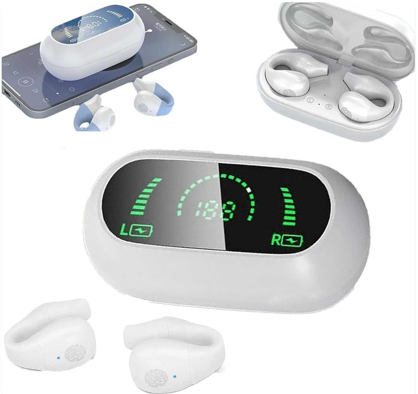
Image: Overview of the Earbuds Pro, showing the charging case, the earbuds themselves, and the LED display on the case.