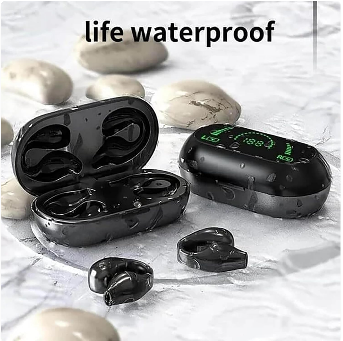
Image: The Earbuds Pro charging case and earbuds shown on a wet surface, demonstrating their "life waterproof" capability.