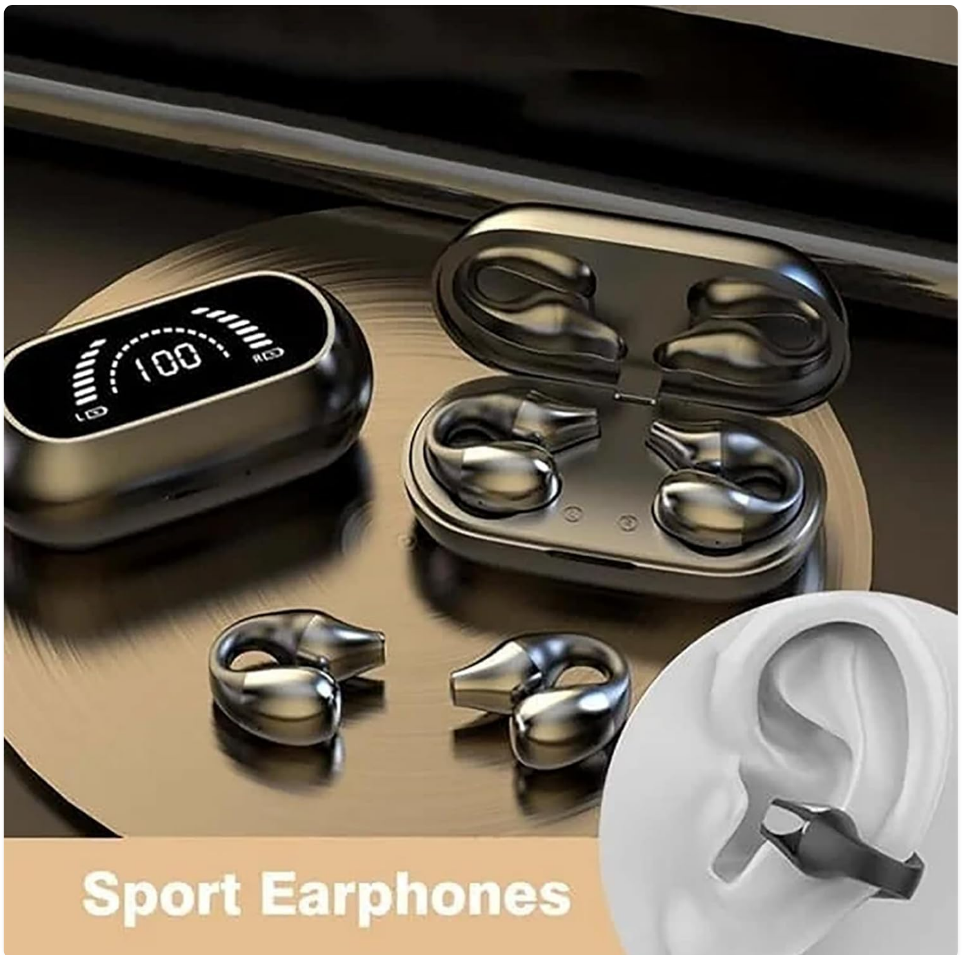
Image: The Earbuds Pro in black, demonstrating their secure fit when worn, suitable for sports and active use.