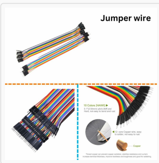
Image: Jumper Wires. This image displays several bundles of colorful jumper wires, typically used for making connections on breadboards or between electronic components.