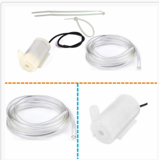
Image: Water Pumps and Tubing. This image displays four small water pumps, each with a length of clear tubing attached, along with several white zip ties for securing components.