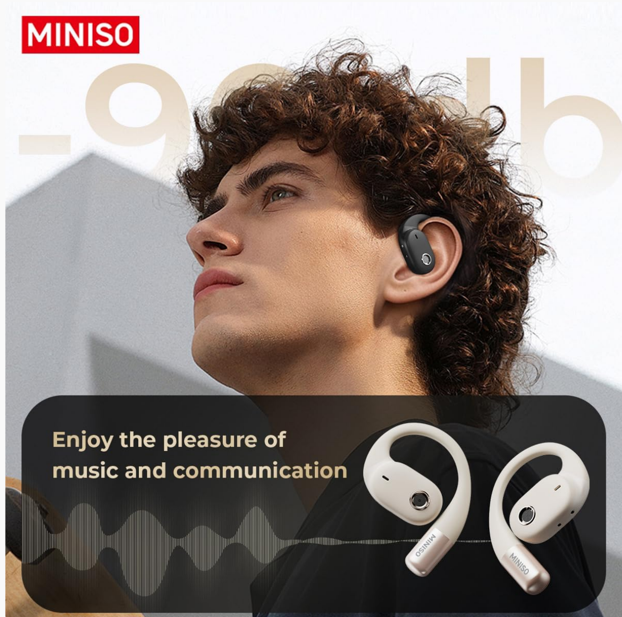
Figure 4.1: Proper wearing of the MINISO MS150 earbud, designed for comfort and allowing awareness of surroundings.