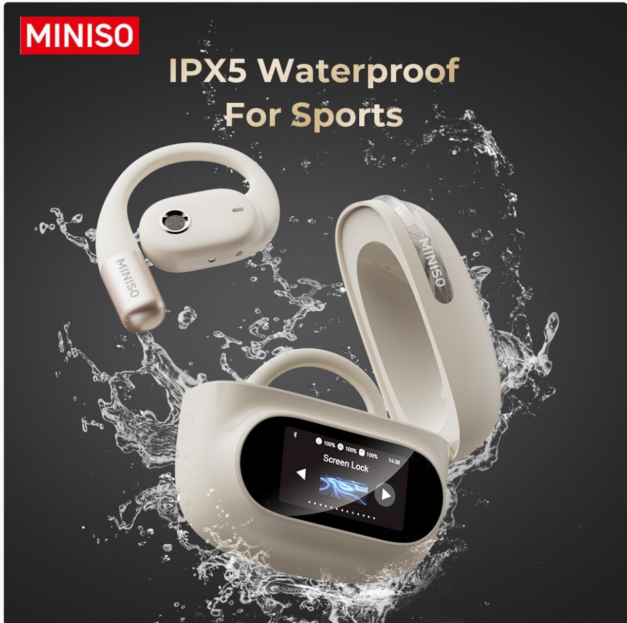
Figure 5.1: The MINISO MS150 earbuds are IPX5 water-resistant, making them suitable for use during sports or in light rain conditions.

The MS150 earbuds are rated IPX5 water-resistant, meaning they can withstand a sustained, low-pressure water jet spray. This makes them suitable for sports and light rain exposure.