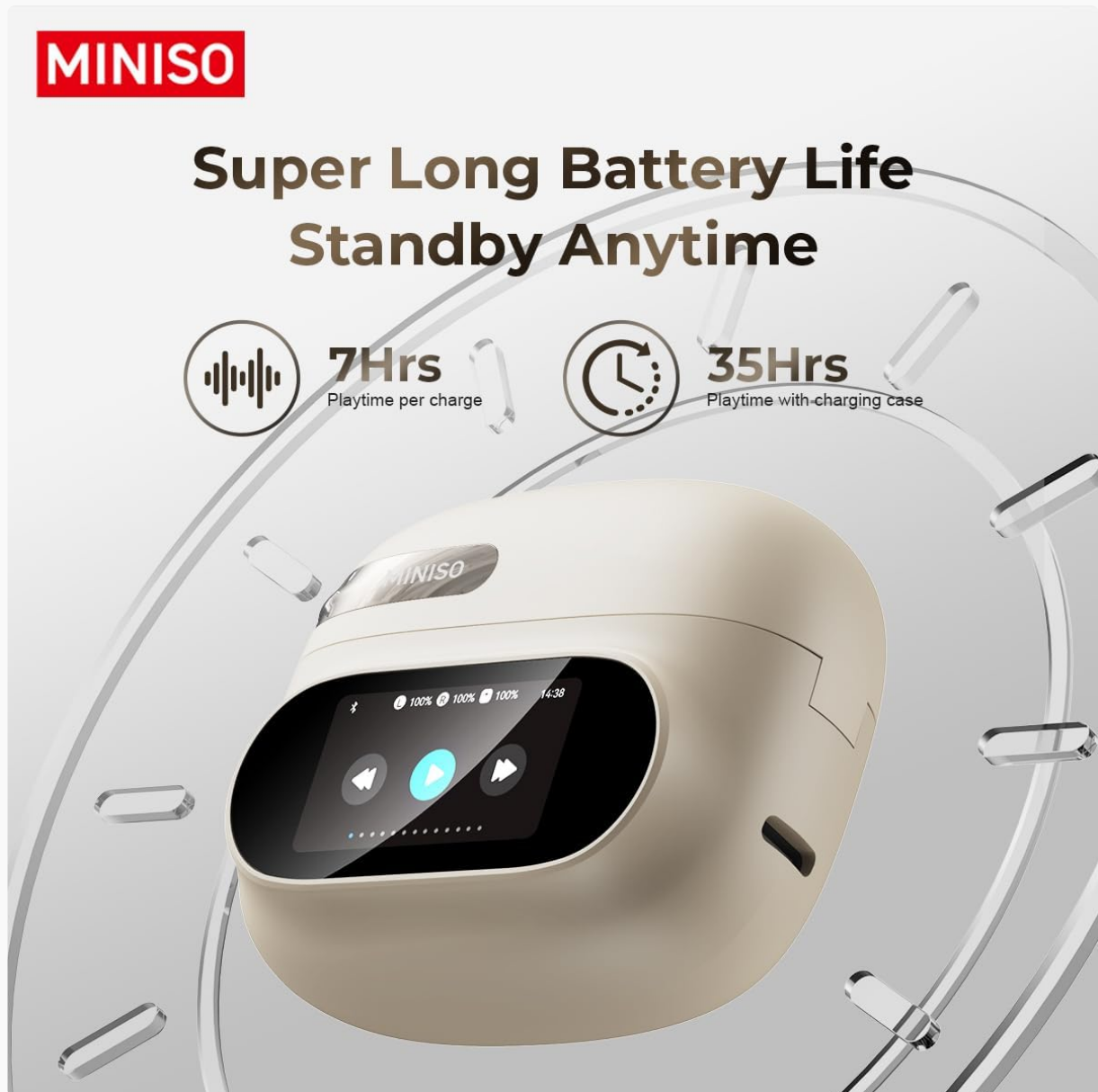
Figure 3.1: The charging case display showing battery levels for the earbuds and the case. The earbuds offer 7 hours of playtime per charge, with the case extending total playtime to 35 hours.