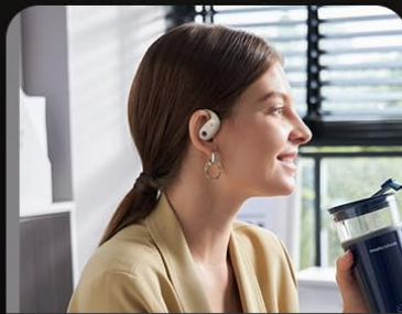
Listening to songs

Support Standard Rock Pop Classic jazz 5 Sound effects