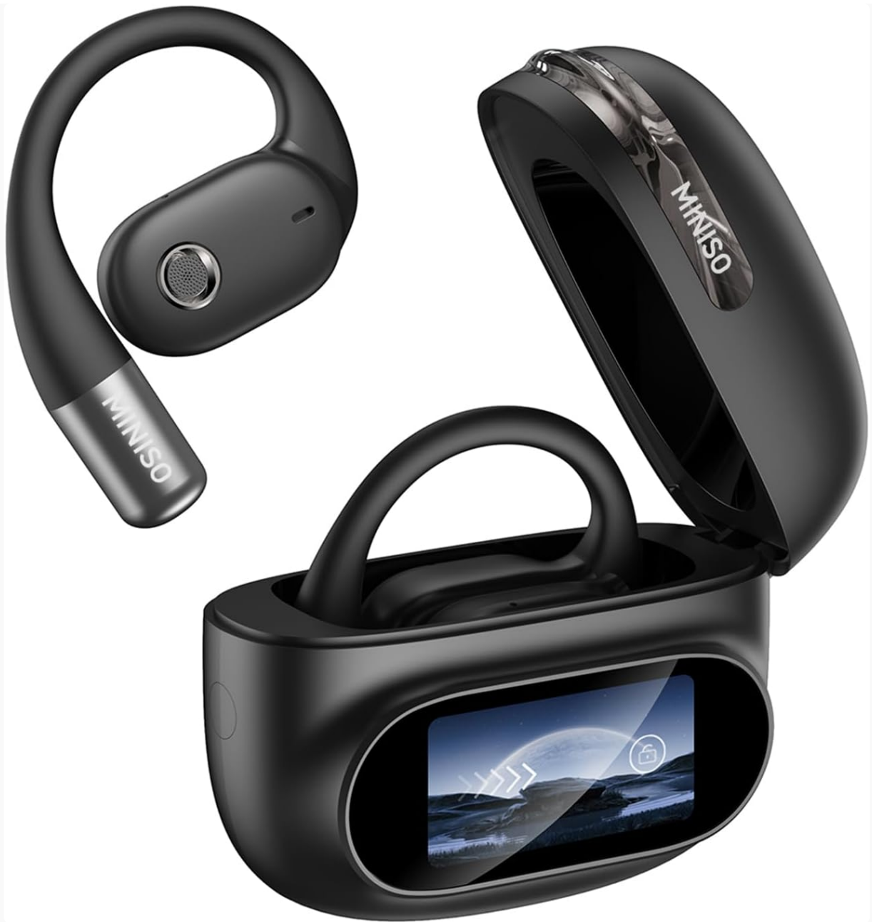
Figure 1.1: The MINISO MS150 AI Language Translation Earbuds and their charging case. The earbuds feature an open-ear design, and the case includes a display screen.