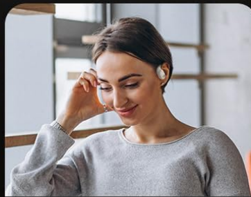
Watch a film