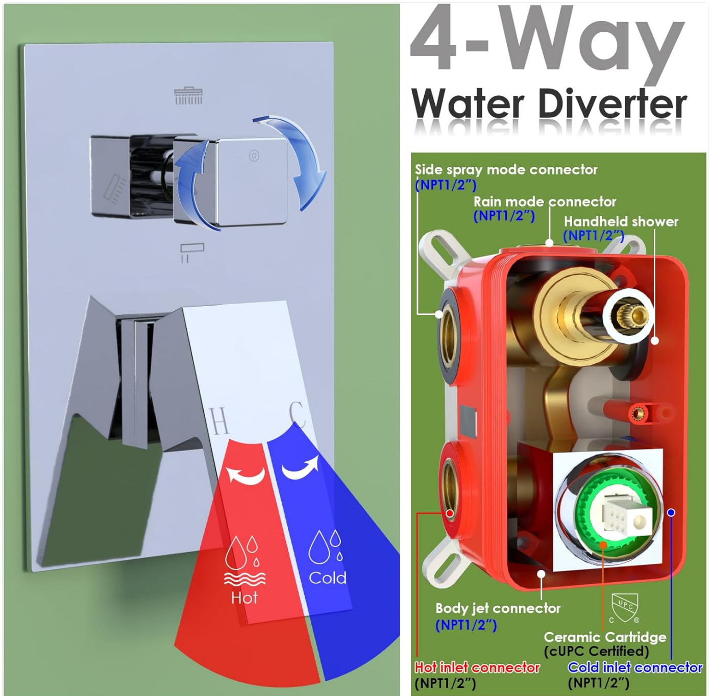
Figure 3.1: Diagram illustrating the 4-function shower valve and its connections for hot water, cold water, overhead spray, handheld spray, and body jets.