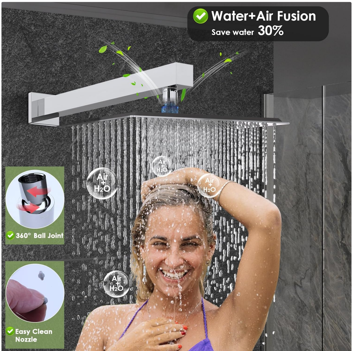
Figure 5.1: Illustration of the easy-clean silicone nozzles on the shower head, which can be cleaned by a simple finger touch.