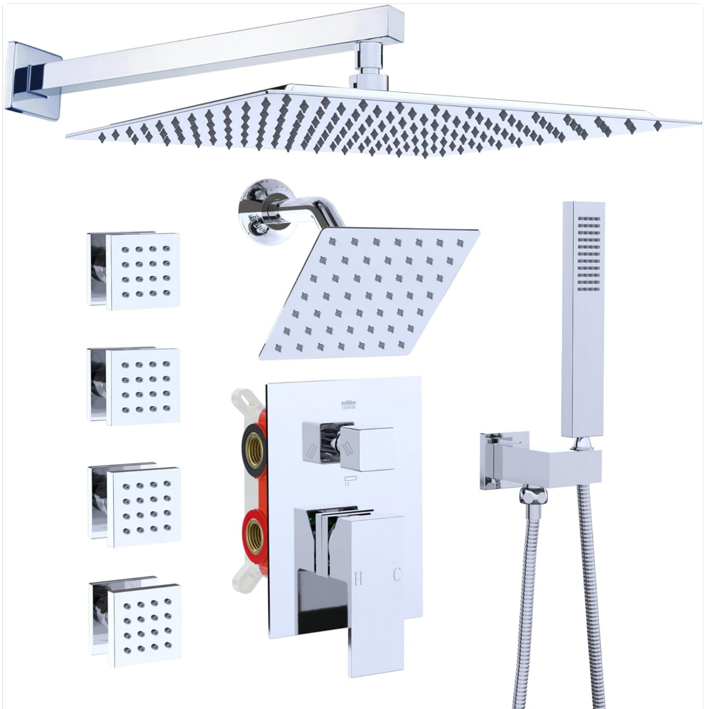
Figure 2.1: All components included in the Enga Dual Shower Head System.

For a visual overview of the product and its components, please refer to the unboxing video below.