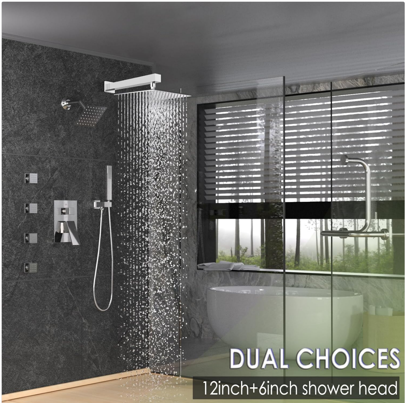
Figure 4.1: The dual shower heads operating simultaneously, demonstrating the system's versatility.