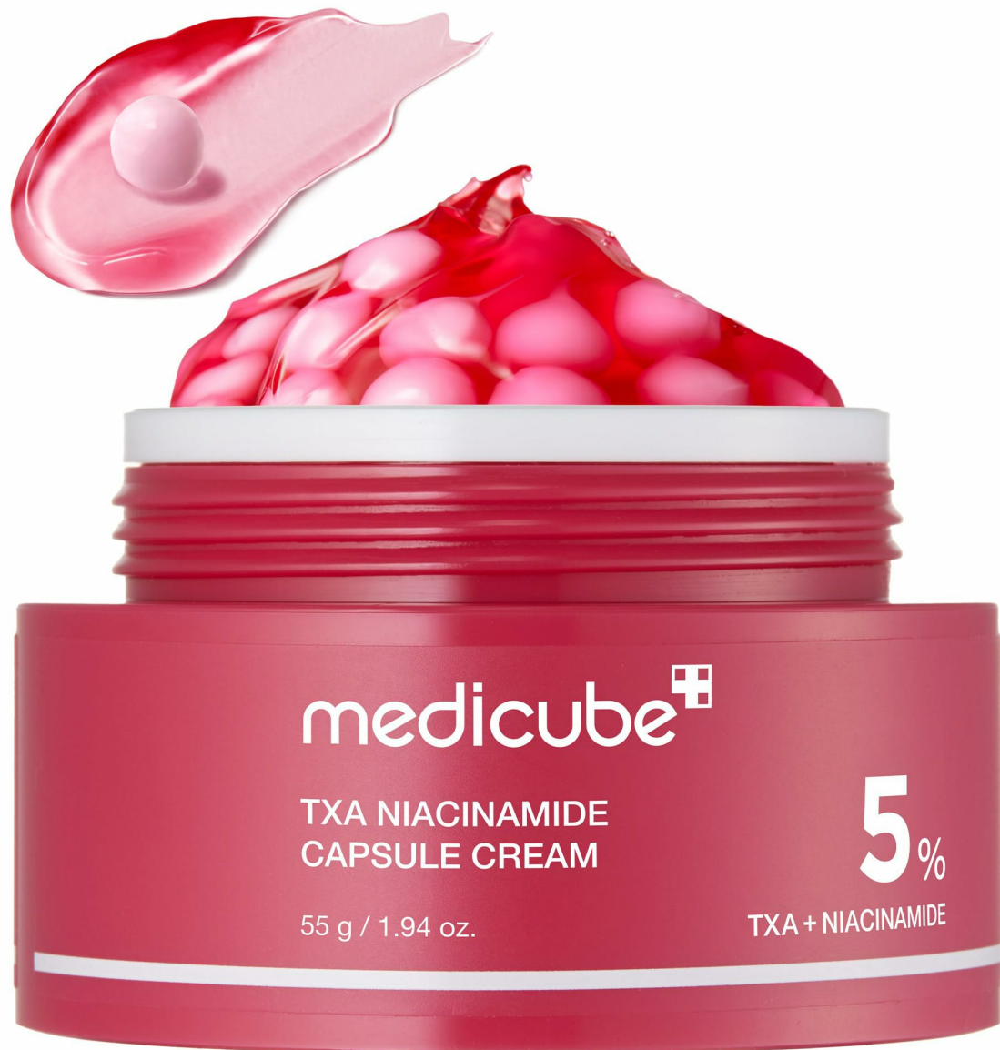
Image: Medicube TXA Niacinamide Capsule Cream, showcasing the product packaging and the unique capsule-in-gel formulation.