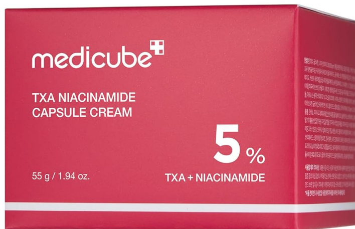
Image: Comprehensive list of all ingredients present in the Medicube TXA Niacinamide Capsule Cream.