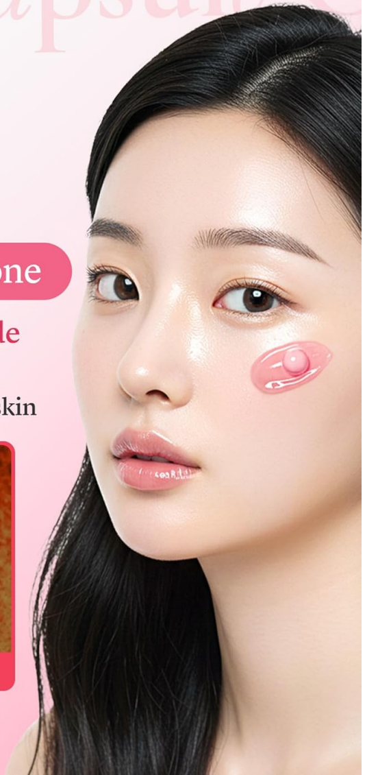
Image: Visual representation of clinically proven results, demonstrating improvements in radiance, hydration, and skin tone.

*Clinical Trial Tested by the 'Global Institute of Dermatological Sciences.' / Results may vary depending on individual skin types