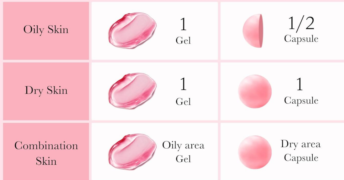
Image: Guide on customizing the capsule-to-gel ratio for different skin types (oily, dry, combination) to achieve optimal results.

Tip: Adjust the capsule-to-gel ratio based on your skin type for the best results.