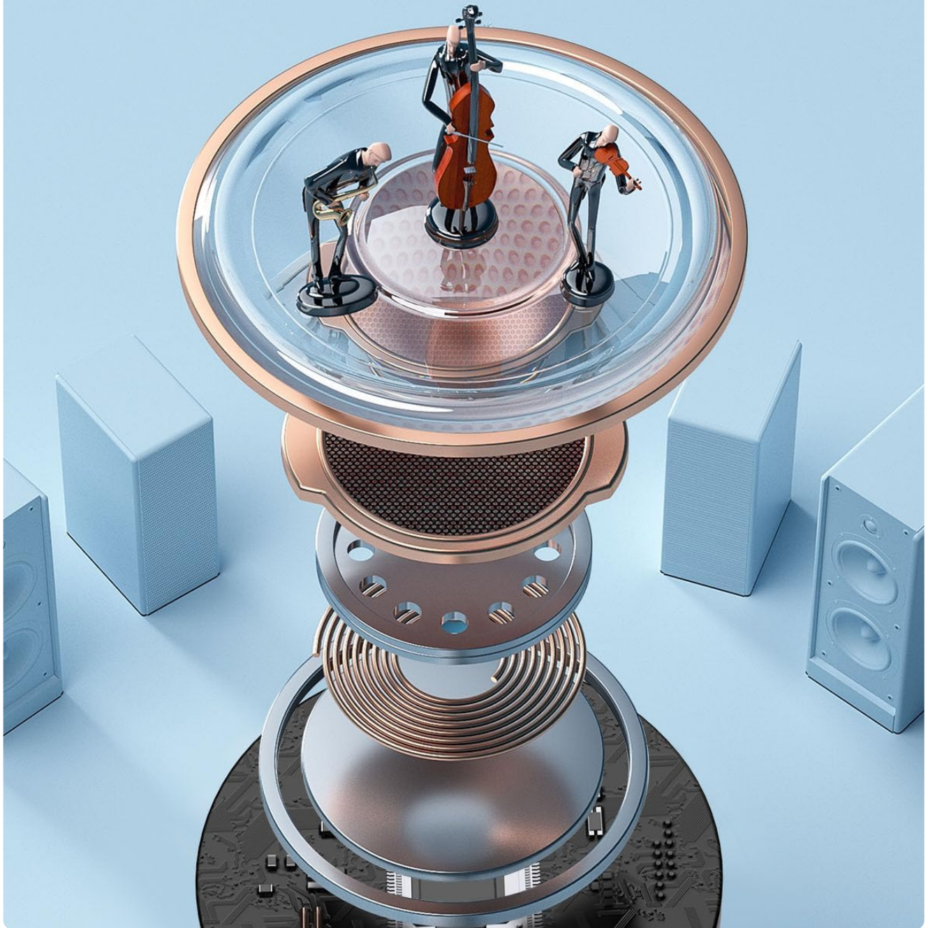
Image: An exploded diagram illustrating the internal components of an earbud, highlighting the driver and acoustic structure for superior sound.

Presenting you with delicate sound quality and low escape sounds for an immersive concert.