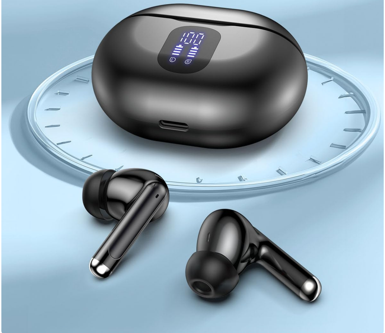
Image: The earbuds and charging case, illustrating the extended battery life with icons for single charge and total playtime with the case.