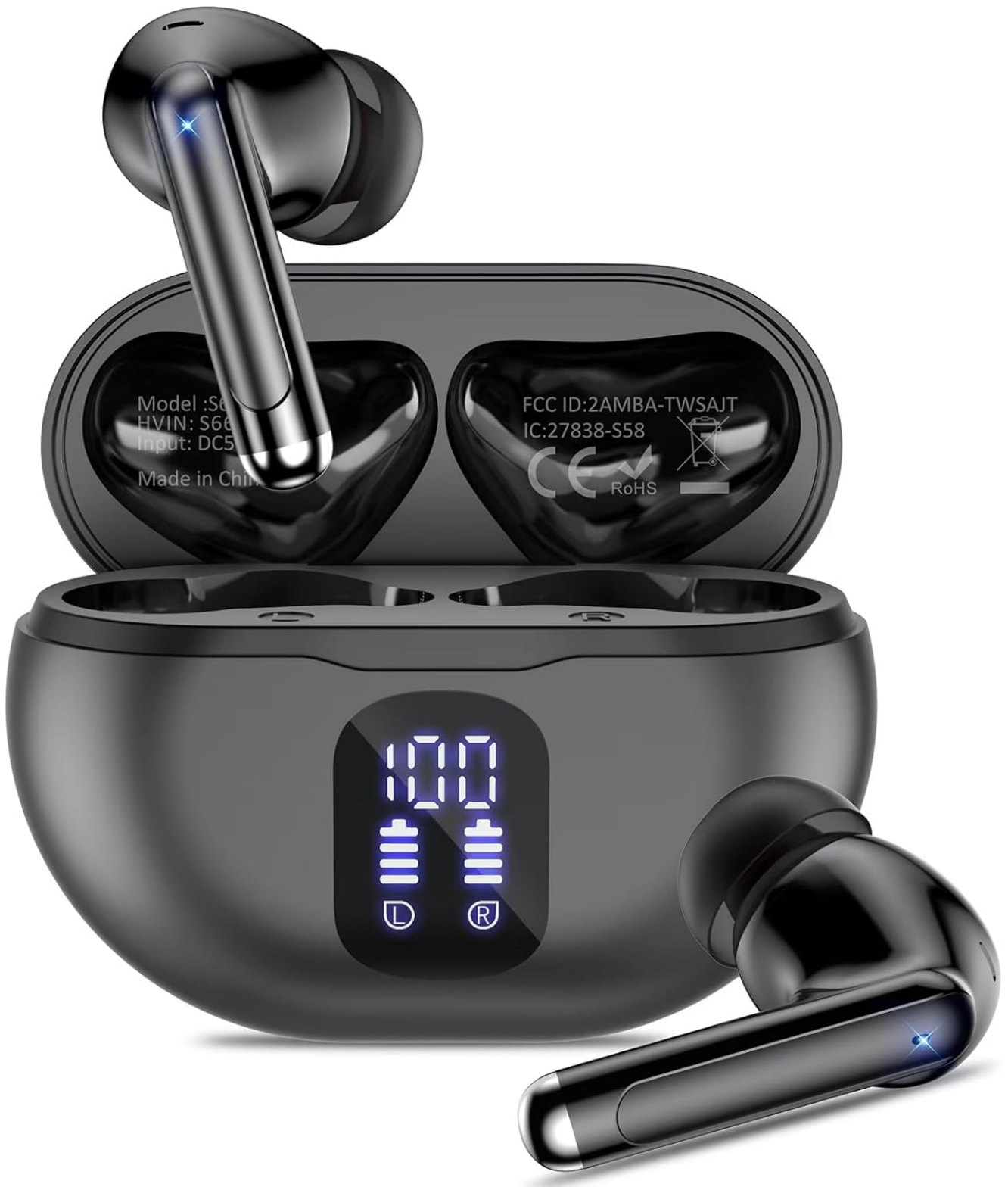
Image: The BHNWUL S66 Wireless Earbuds, showing both earbuds and the charging case with its lid open, displaying the LED power display.