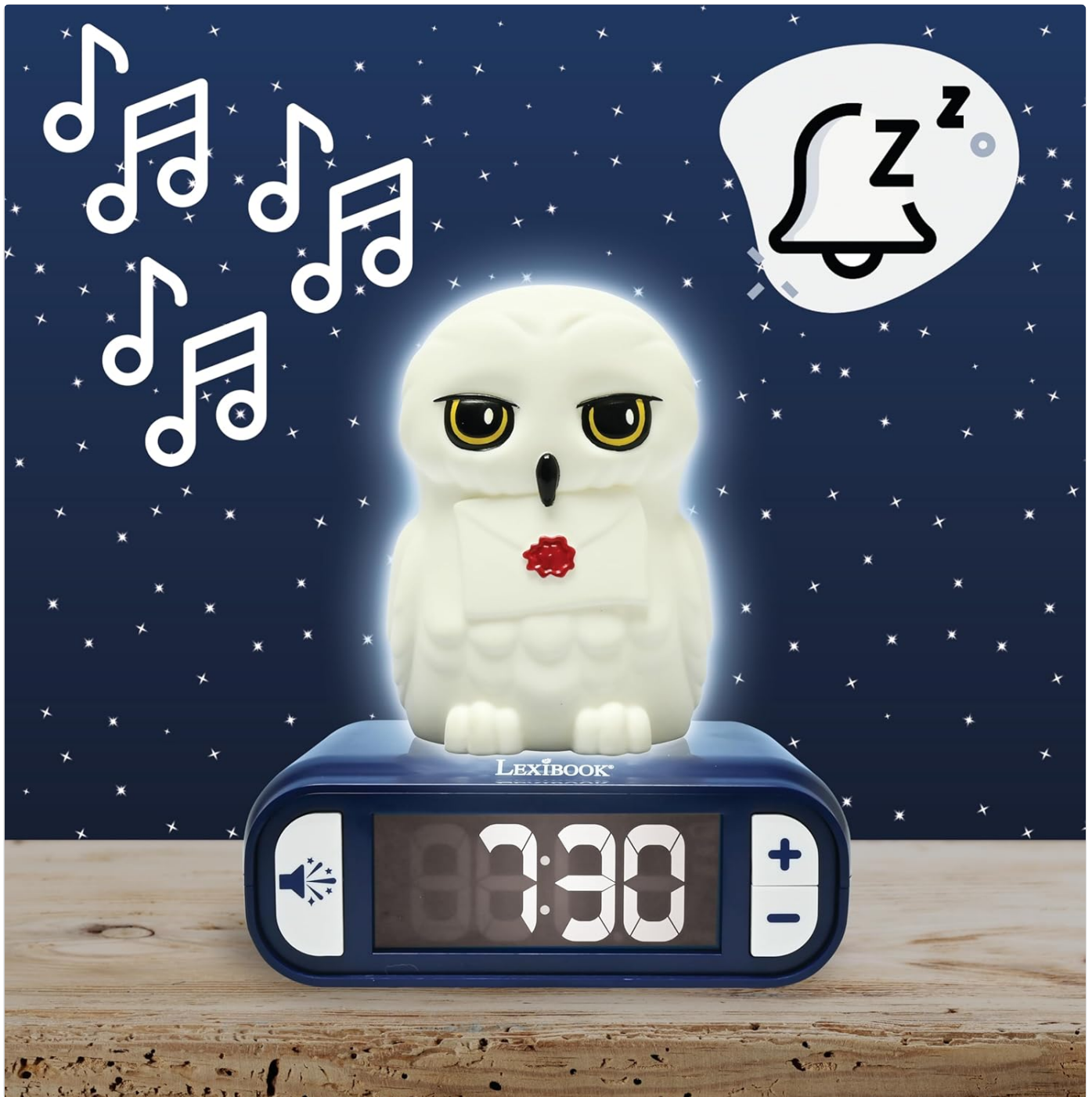
Image: The Hedwig Nightlight Alarm Clock with its Hedwig figure illuminated, surrounded by musical notes, indicating its sound and light features.