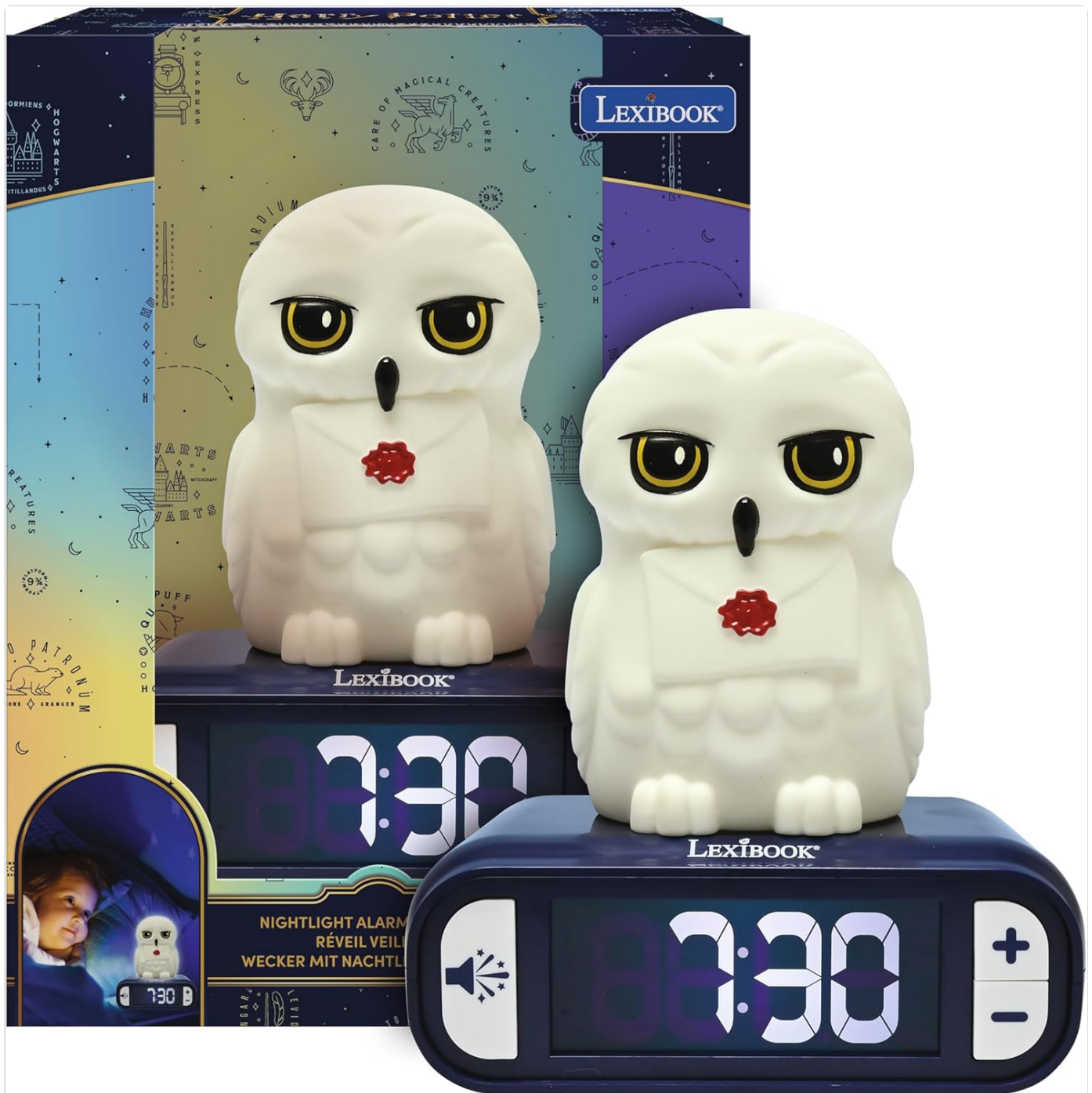
Image: The Hedwig Nightlight Alarm Clock shown in its retail packaging, highlighting its design and features.