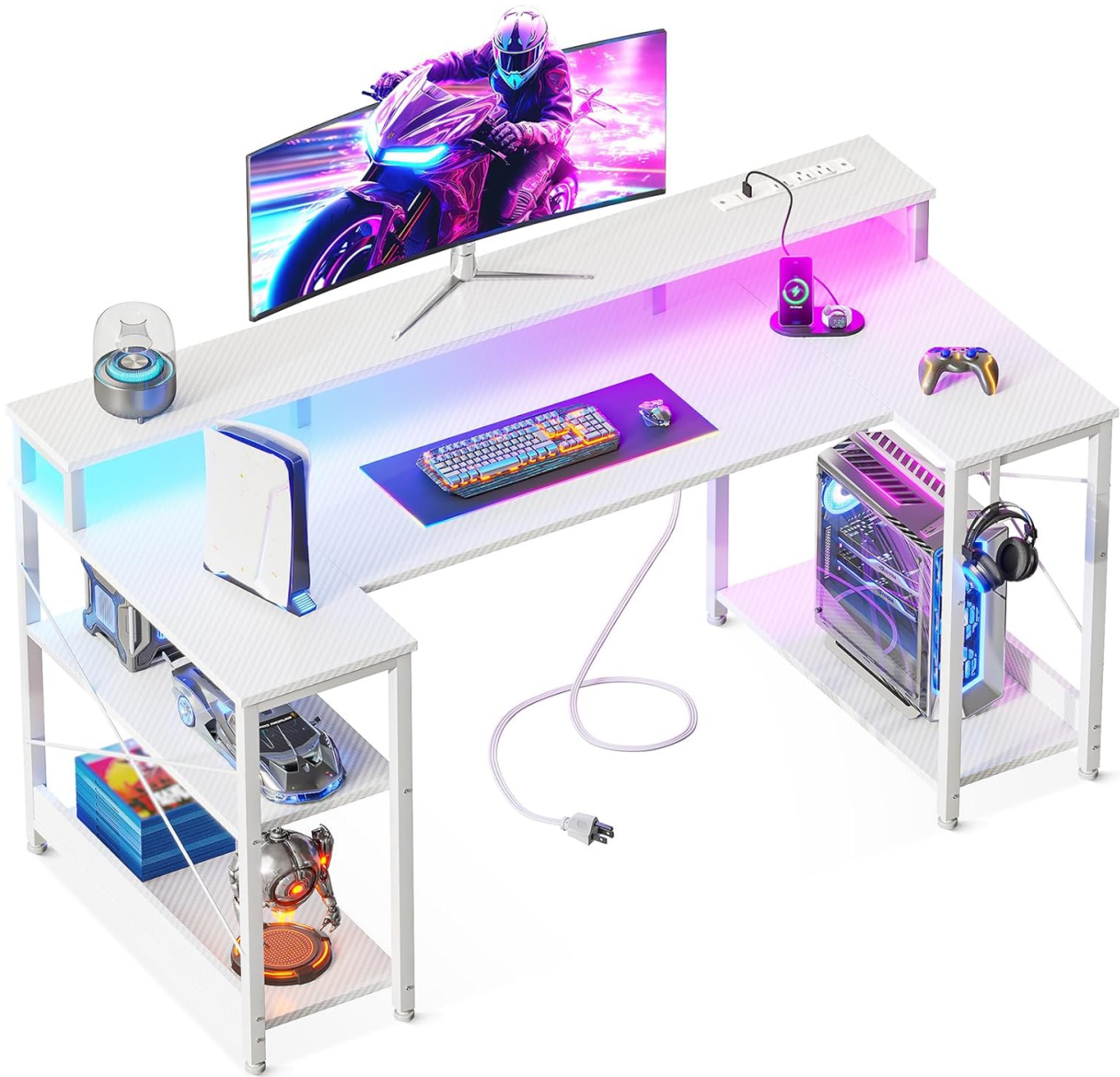
Image 1.1: The ODK 48 Inch Gaming Desk, showcasing its U-shaped design and integrated features.

Your browser does not support the video tag.