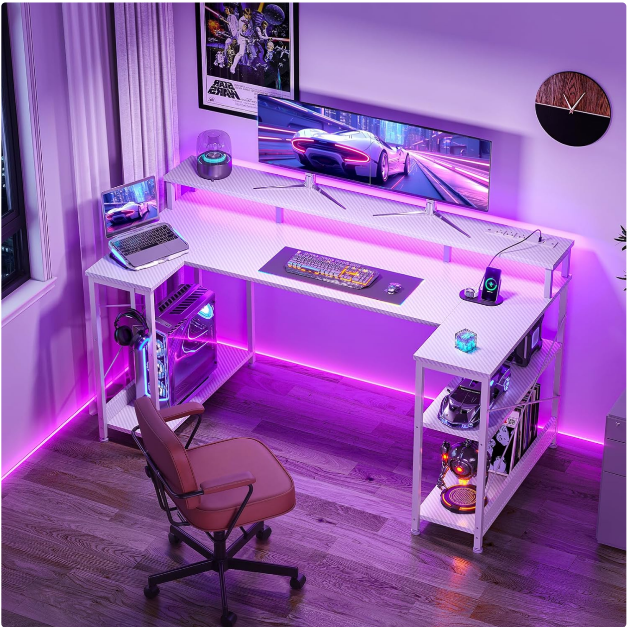
Image 5.3: The ergonomic monitor stand elevating displays for improved viewing comfort.