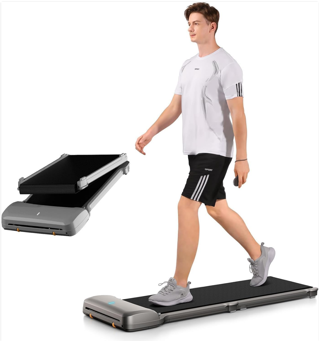
Image 1.1: The WALKINGPAD C1 in its unfolded state with a user, and a smaller image showing it in its folded, compact form.