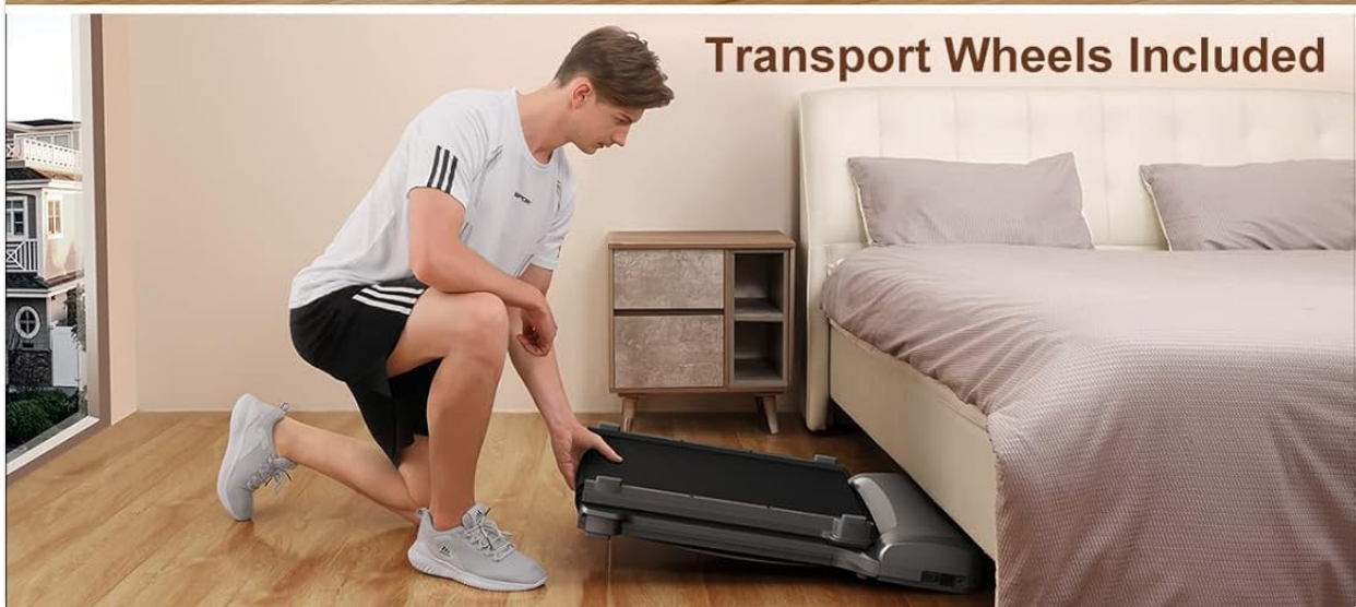
Image 2.1: Demonstrates the easy folding process and how the WalkingPad C1 can be stored compactly under a bed.