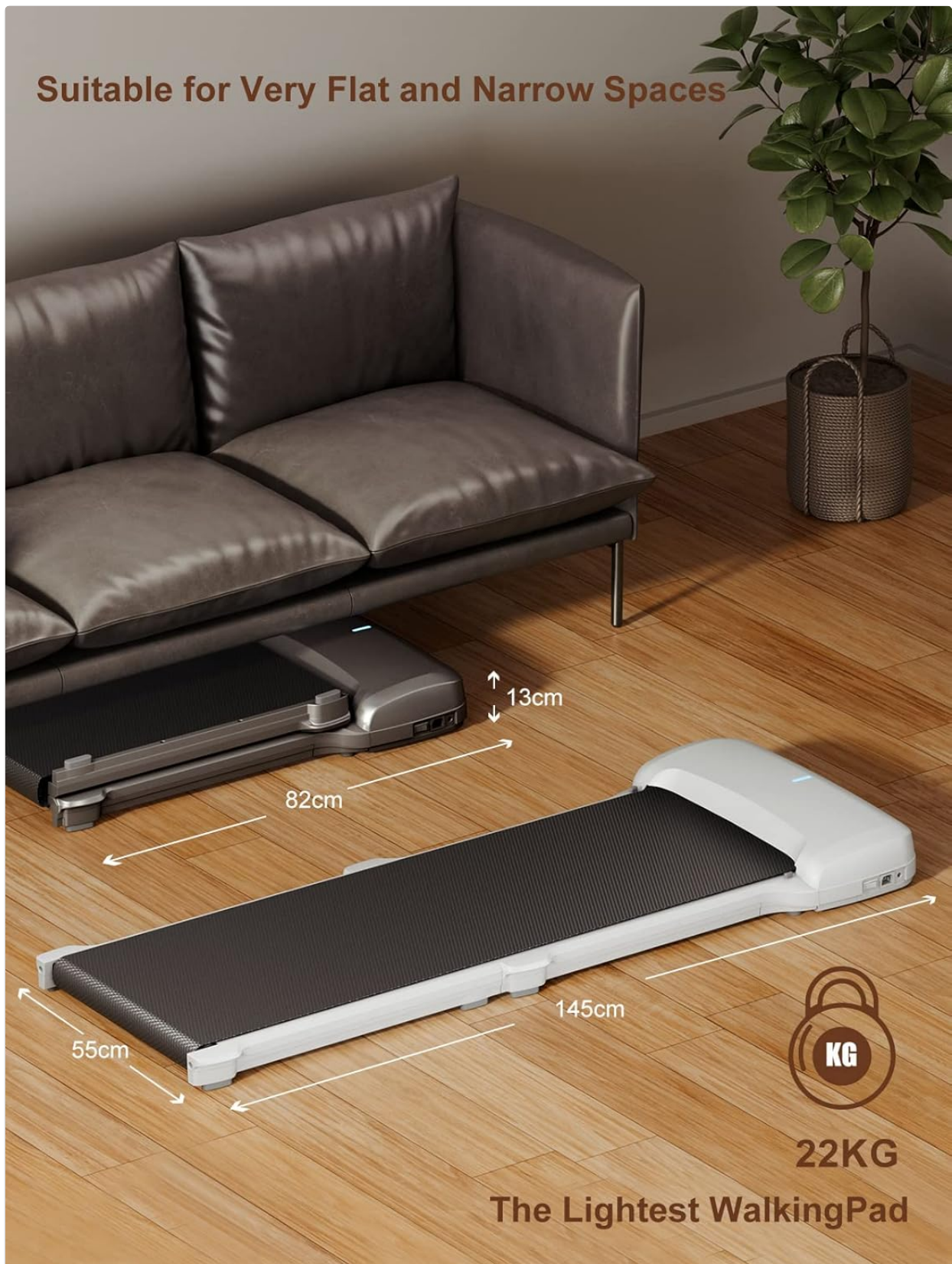
Image 2.2: Illustrates the compact dimensions of the WalkingPad C1, showing it stored conveniently under a sofa.

Suitable for Very Flat and Narrow Spaces