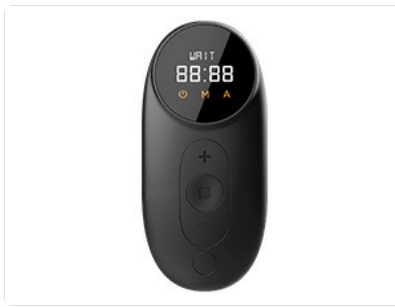
Image 2.3: The compact remote control for adjusting speed and modes.