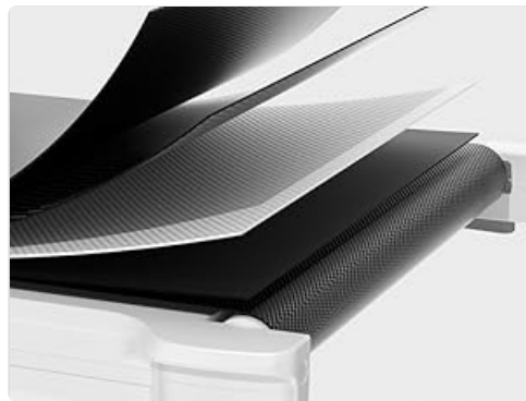
Image 2.5: Cross-section diagram highlighting the four layers of the composite running belt for shock absorption and durability.