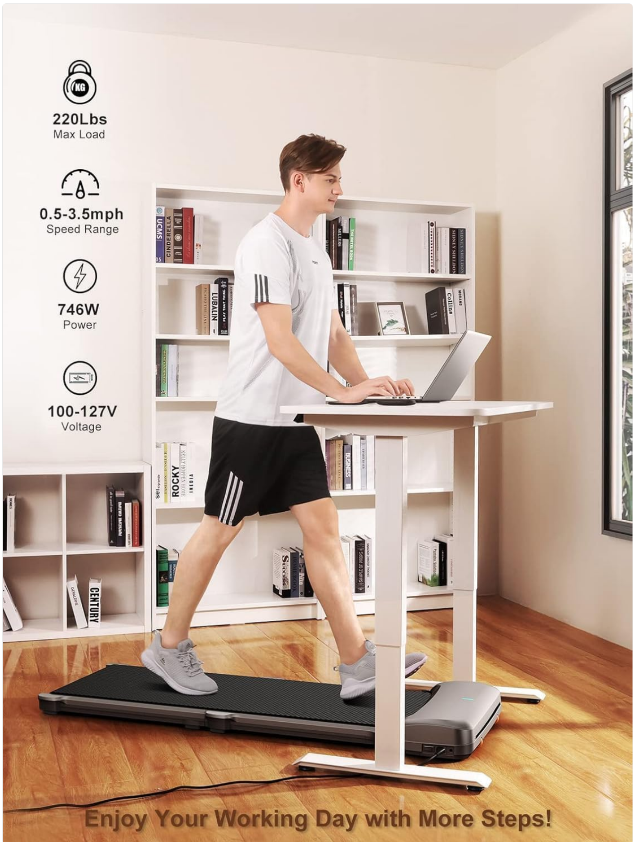
Image 4.2: The WalkingPad C1 being used with a standing desk, highlighting its suitability for office environments.