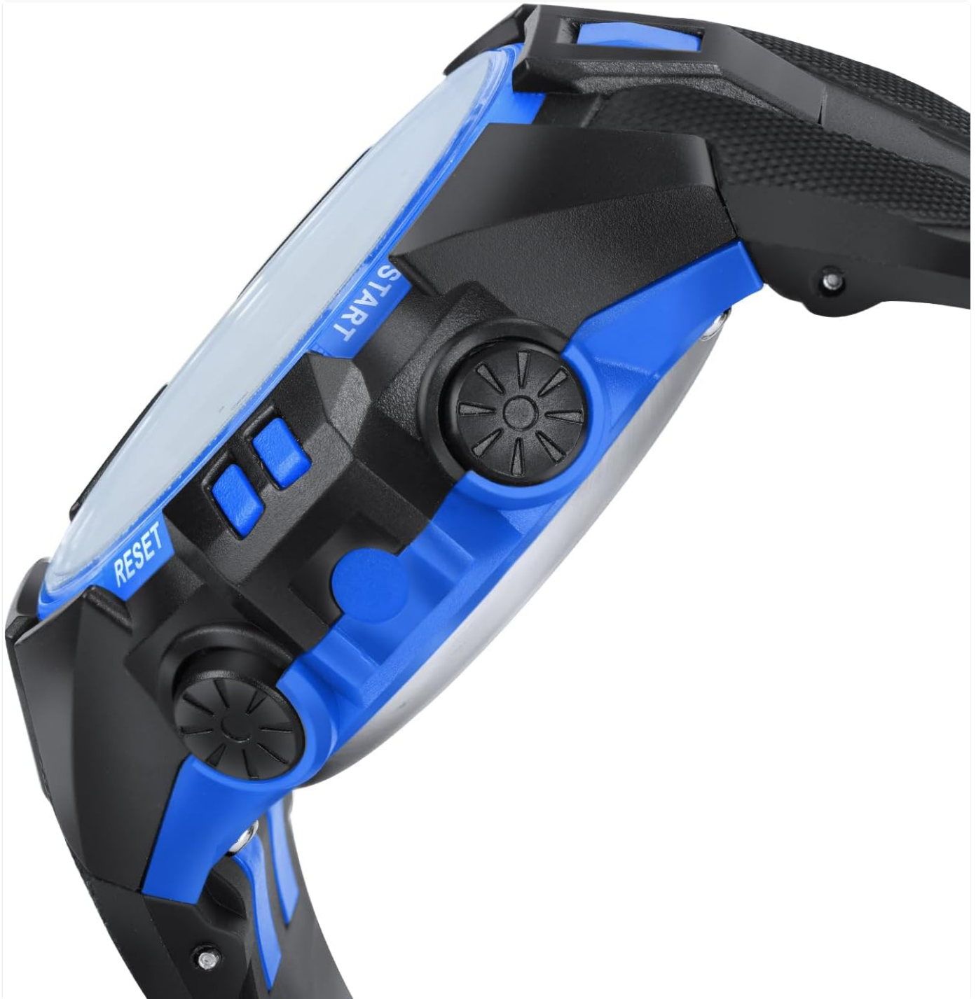
Side view of the watch, highlighting the 'START' and 'RESET' buttons on the right side of the watch case.