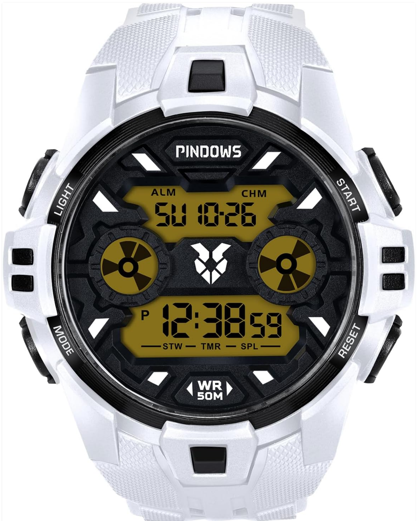
Front view of the PINDOWS Men's Digital Sports Watch, showcasing its digital display and robust design in a white and black color combination.