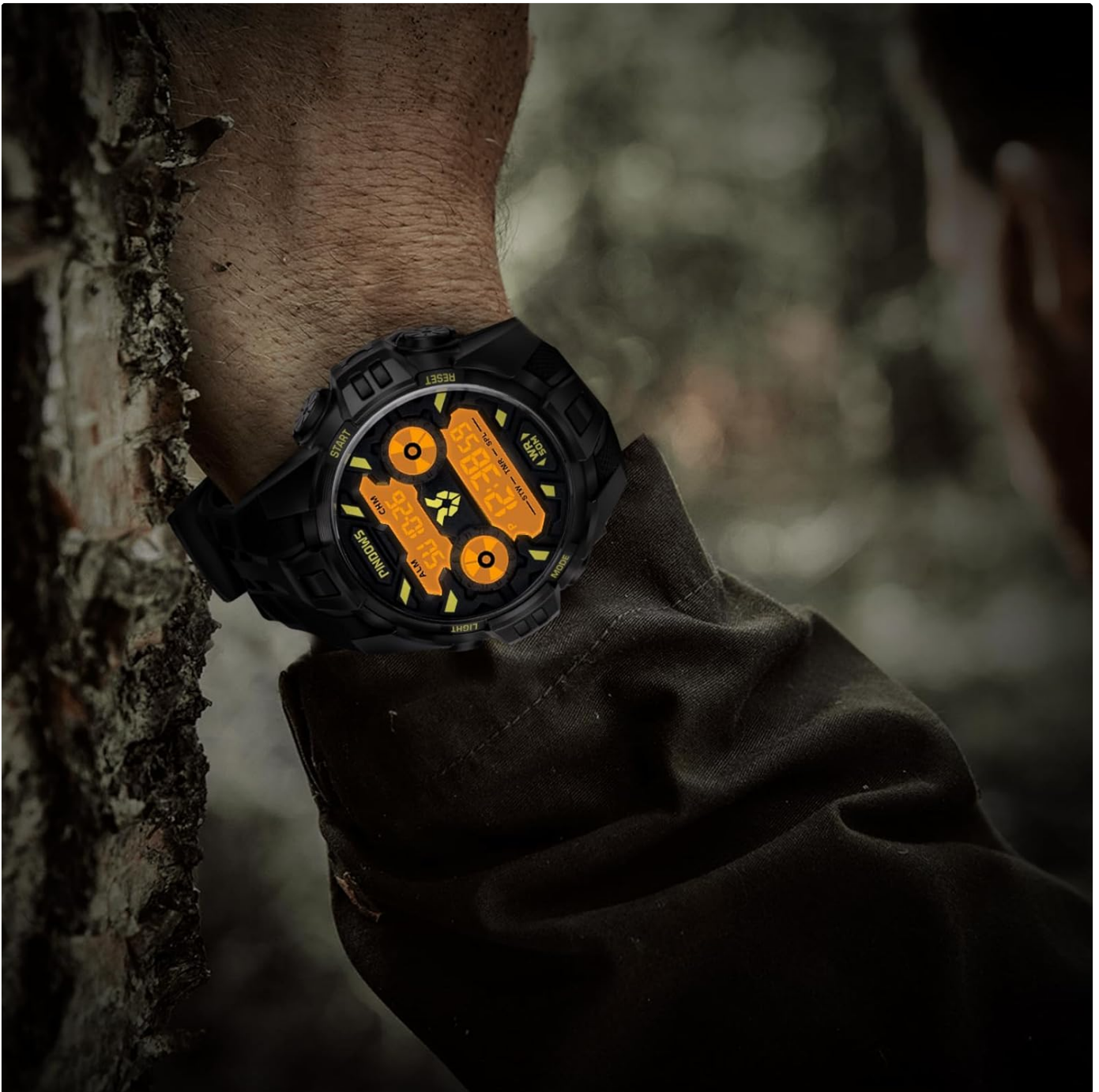
The PINDOWS watch worn on a wrist, demonstrating its practical use and style in an outdoor environment.