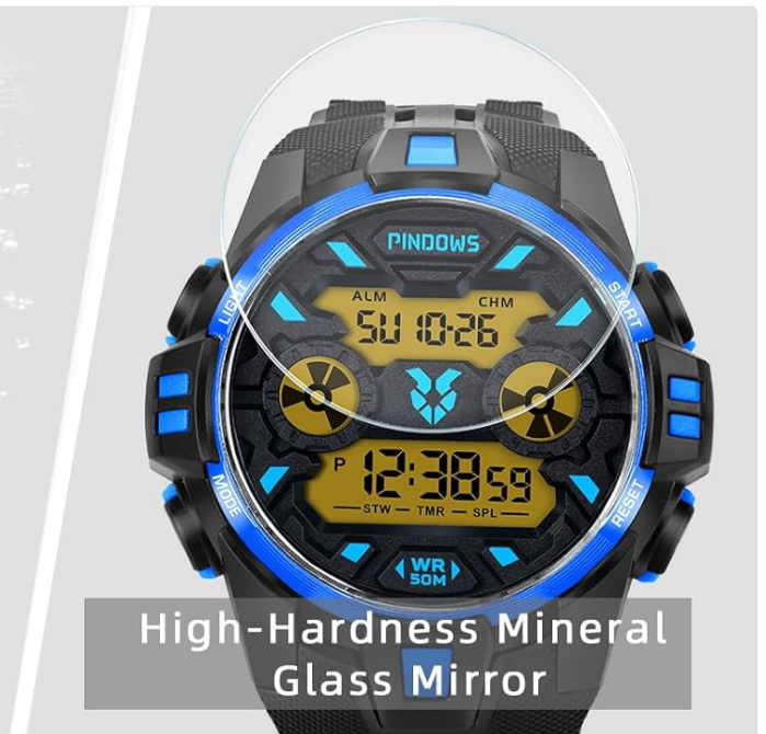
High-Hardness Mineral Glass Mirror