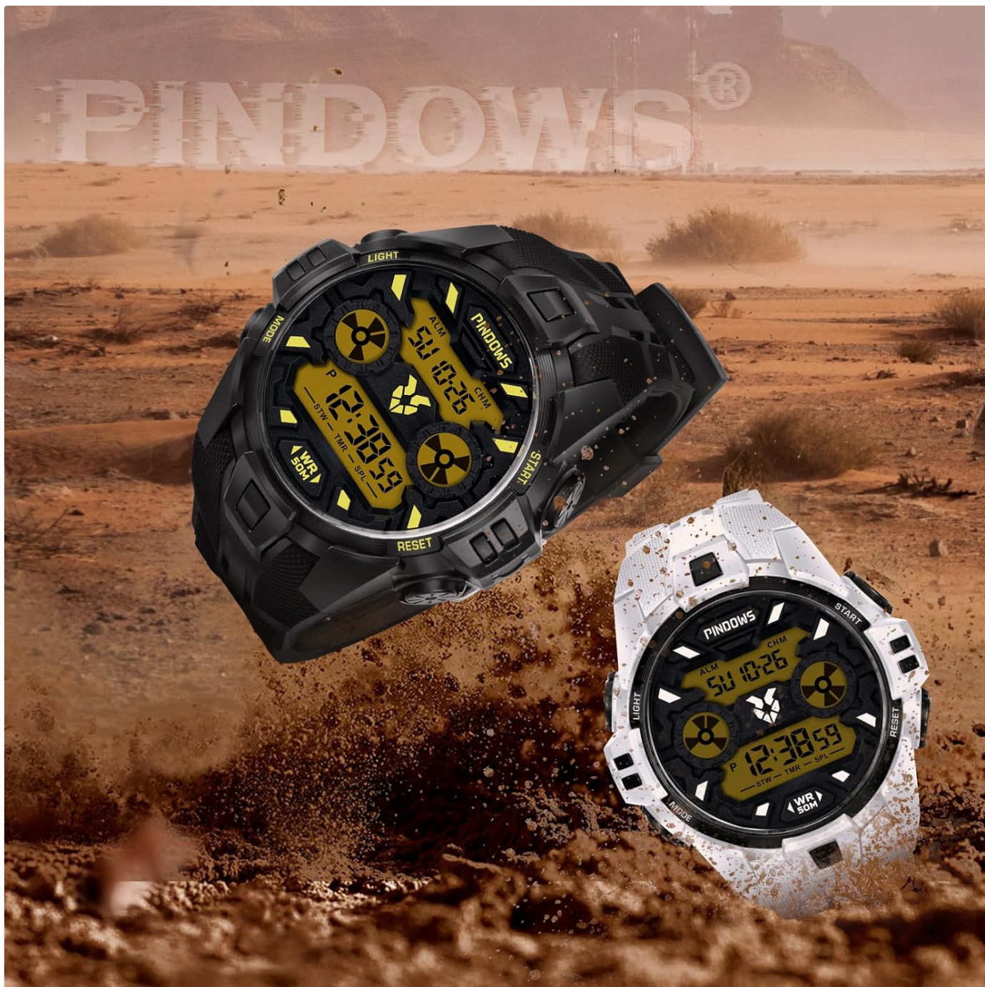
Two PINDOWS watches, one black and one white, displayed in a rugged outdoor setting, emphasizing their durability and design.