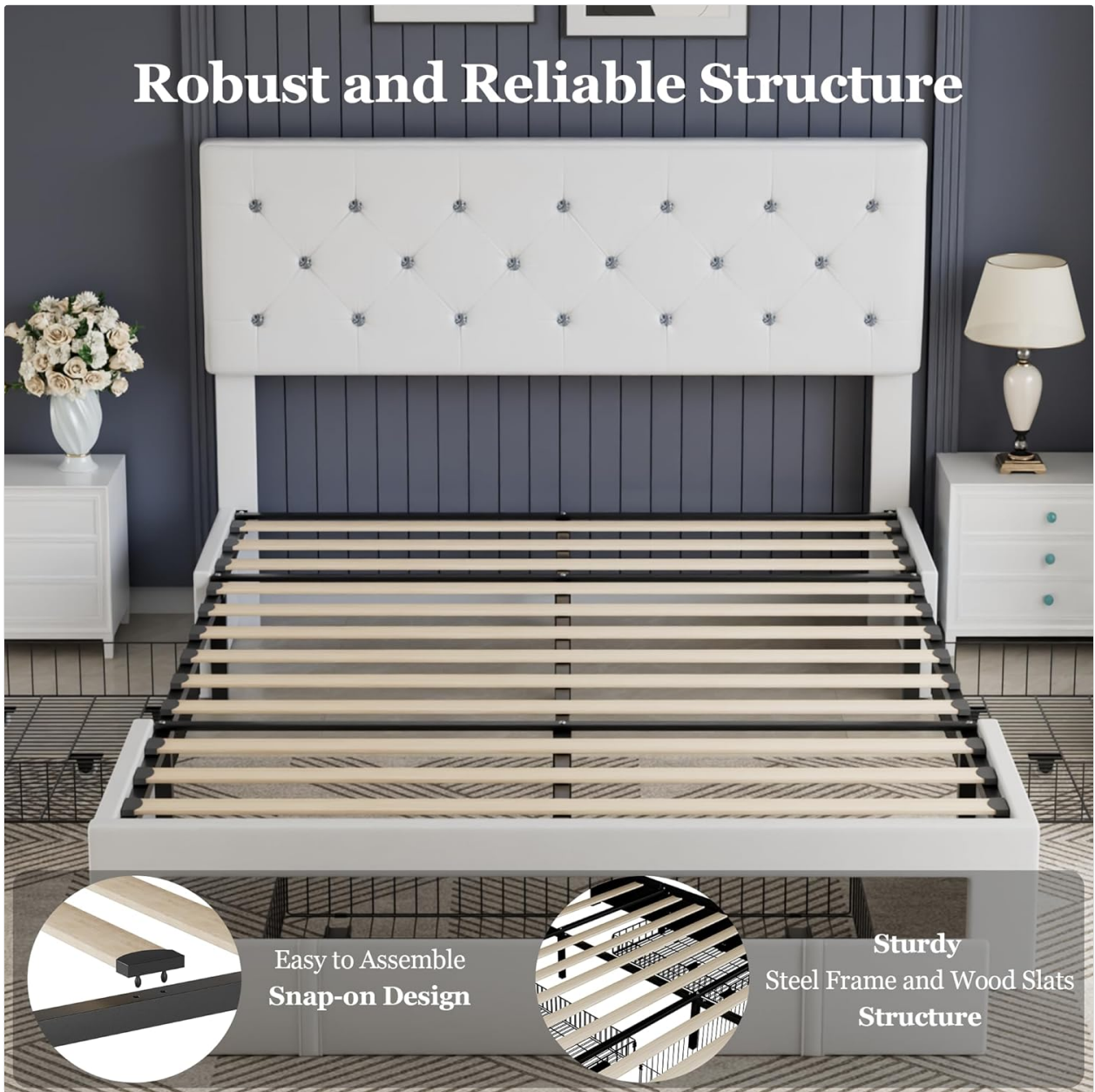
Image Description: This image displays the robust internal structure of the bed frame, featuring sturdy wooden slats securely fitted into a durable metal frame. The design emphasizes strong mattress support and ease of assembly with a snap-on mechanism.