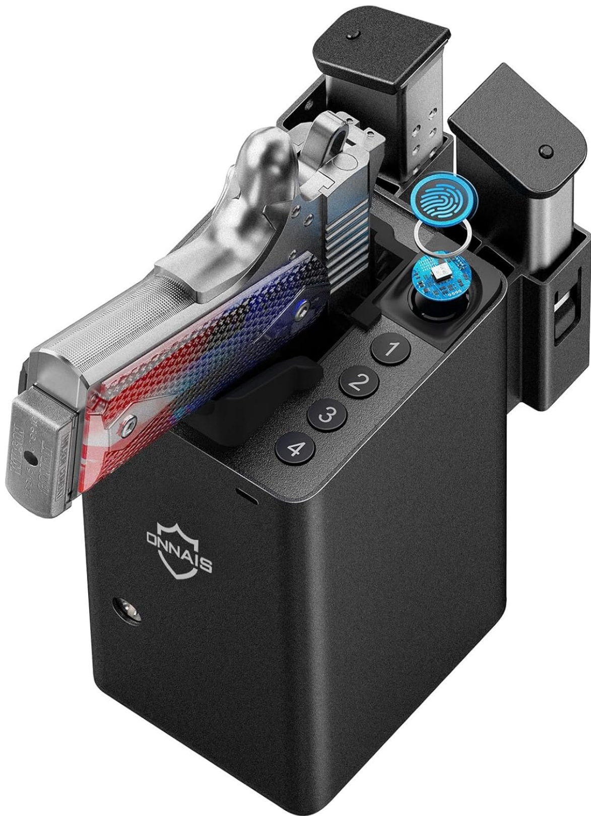
Image 1.1: ONNAIS Biometric Pistol Gun Safe with handgun and spare magazines.