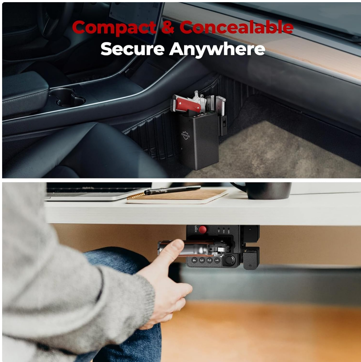
Image 5.2: Examples of the safe mounted under a desk and within a vehicle console.