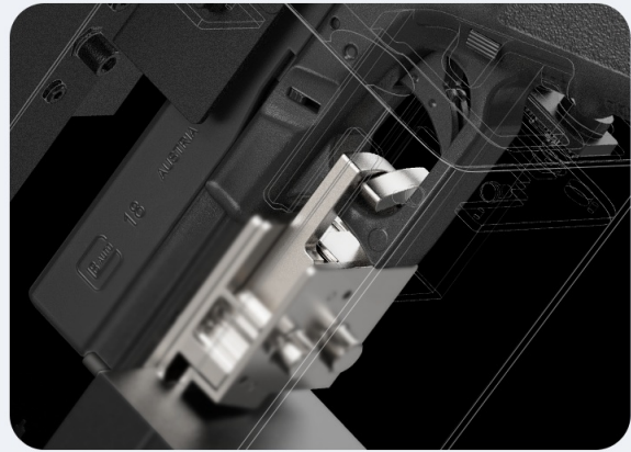
Image 6.2: Quick draw access from the safe, highlighting the exposed grip for immediate retrieval.

Your safety is our top priority. ONNAIS keeps your firearm locked even without power and fully blocks trigger access. Based on customer feedback, we've reinforced security with a tough all-metal mount that resists brute force and withstands up to 1000lb of pressure.