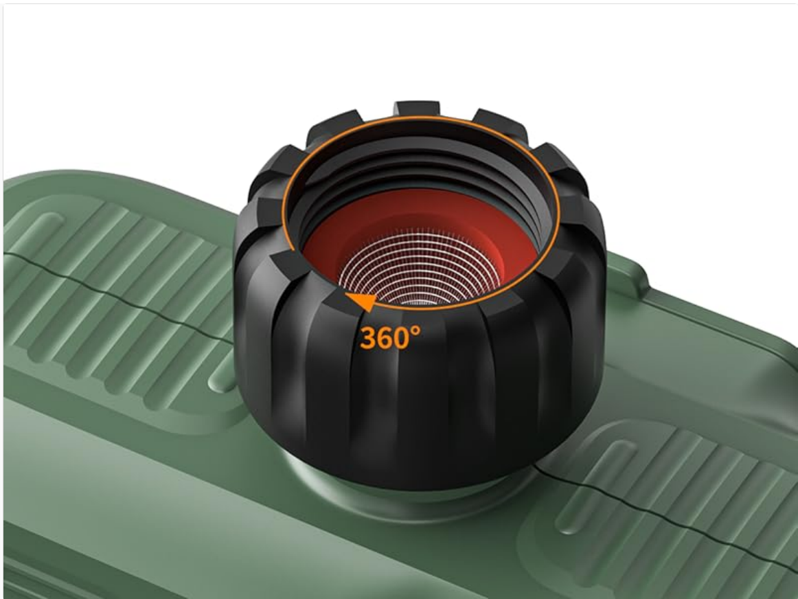
Image description: A diagram illustrating the steps to connect the Diivoo WiFi Sprinkler Timer to a faucet, emphasizing the use of PTFE tape and a leak-proof gasket for a tight seal.