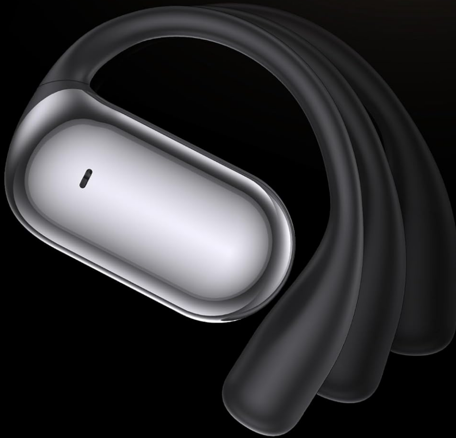
Figure 4: Flexible and Secure Fit

Say Goodbye to Ear Pain and Awkward Fits