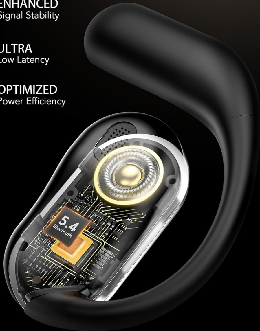
Figure 7: Bluetooth 5.4 Connectivity