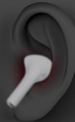
Figure 3: Open-Ear Comfort Design