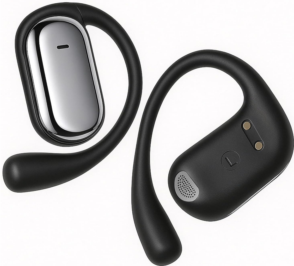
Figure 1: EUQQ Ultra Open-Ear Headphones