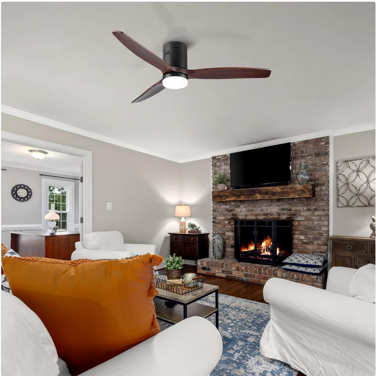
Image 1.1: The 52-inch Integrated LED Low Profile Ceiling Fan installed in a living room setting, showcasing its brown solid wood blades and integrated LED light.