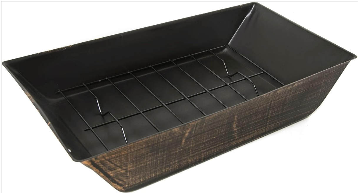
Image 3.1: Close-up view of the removable ash pan, designed for easy ash disposal.