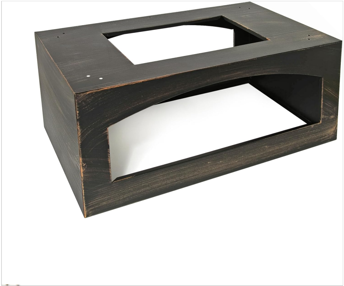
Image 4.1: The sturdy base structure of the fireplace, featuring the integrated log storage area.