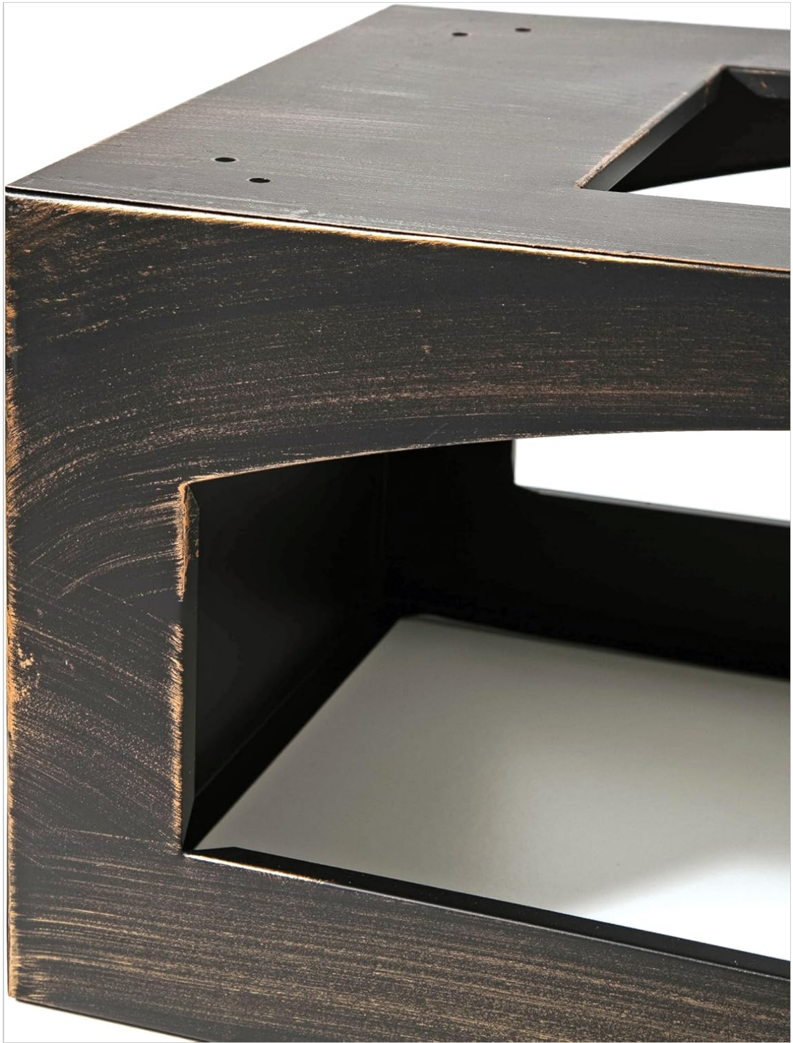
Image 4.2: A detailed view of the base, highlighting the robust construction and the open arch for log storage.