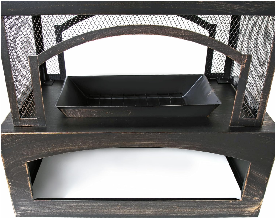
Image 4.3: Front perspective of the assembled fireplace, illustrating the placement of the ash pan and the log storage compartment.