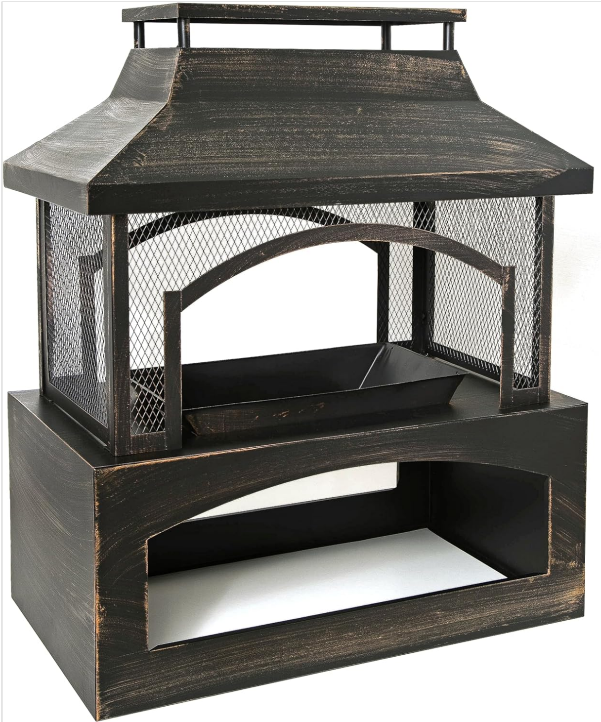
Image 1.1: The Generic 37-Inch Rectangular Outdoor Wood Burning Fireplace, showcasing its overall design with the chimney, mesh screen, and integrated log storage.