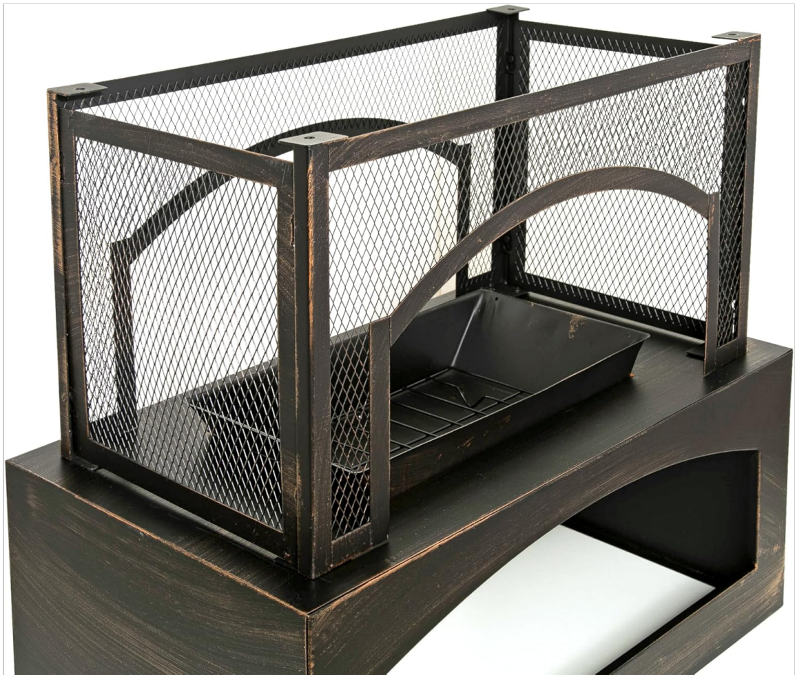
Image 4.4: Overhead view of the fireplace, showing the mesh screen enclosure and the position of the ash pan within the firebox.