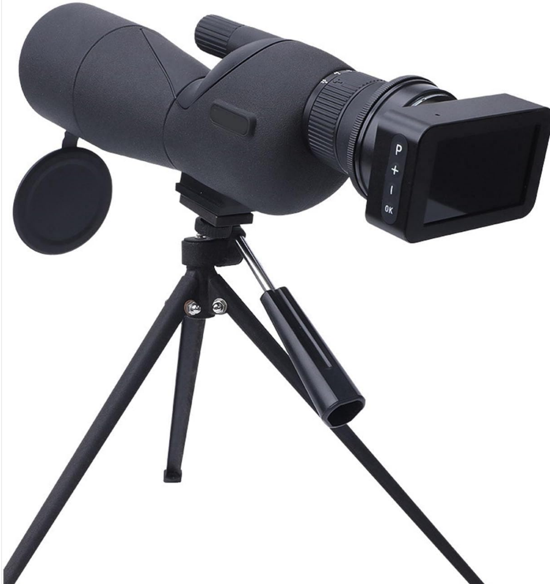
Figure 3: Electronic eyepiece attached to a telescope.