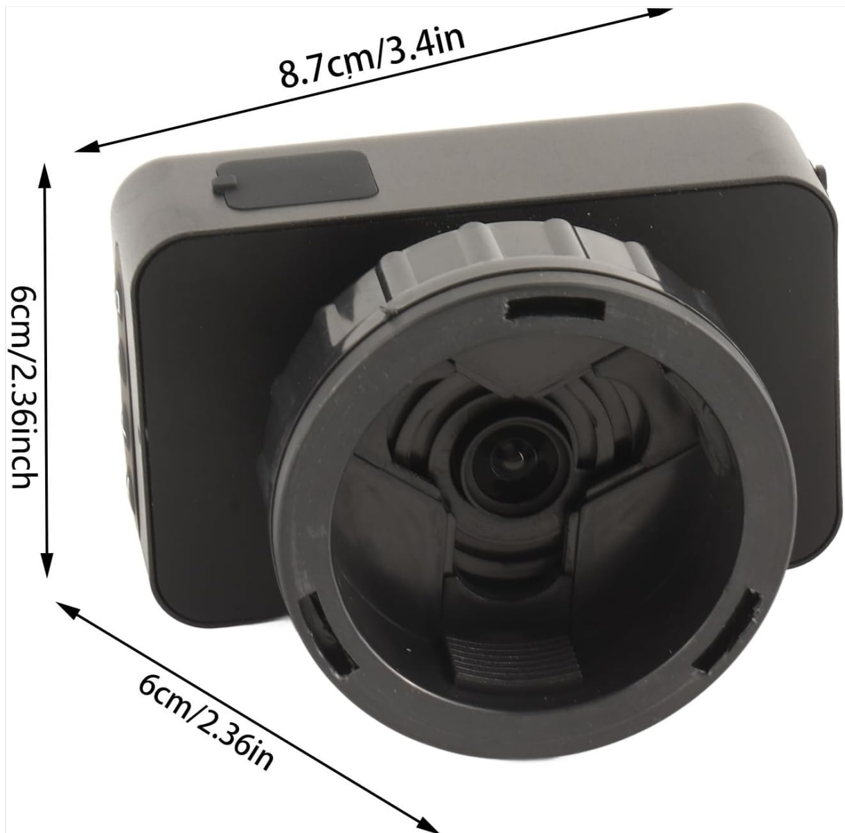
Figure 6: Product dimensions.