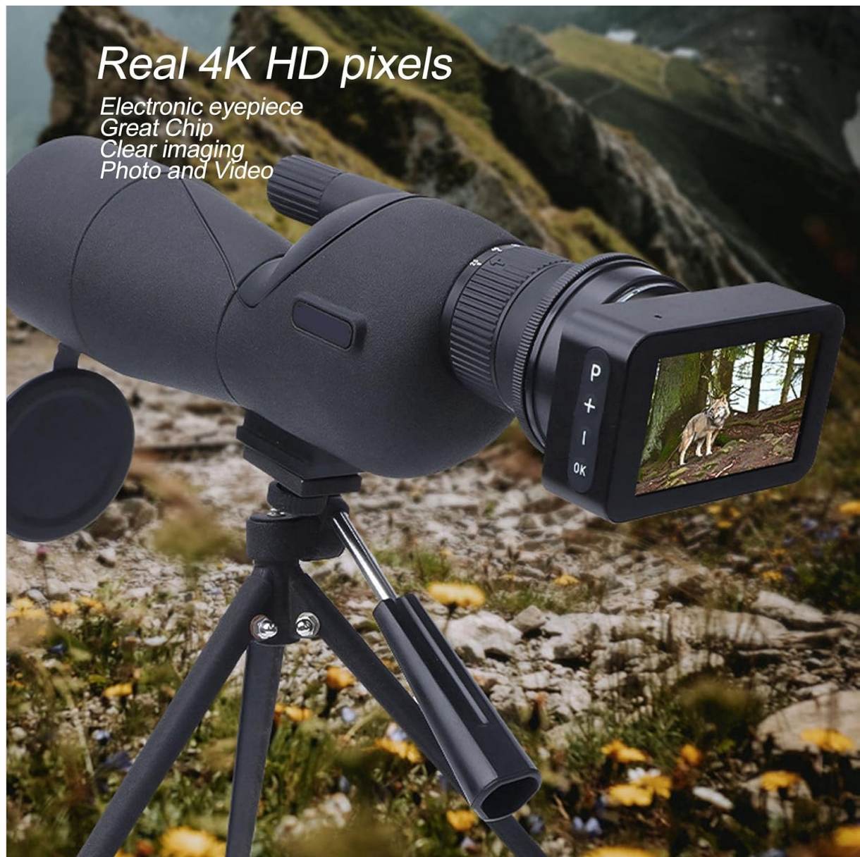
Figure 4: Real-time viewing on the 3-inch display.