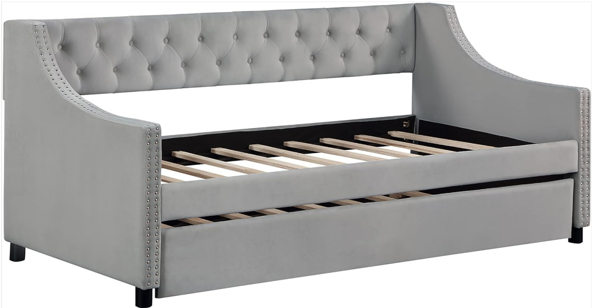
Image: Close-up view of the daybed frame showing the wooden slats properly installed across the support beams.