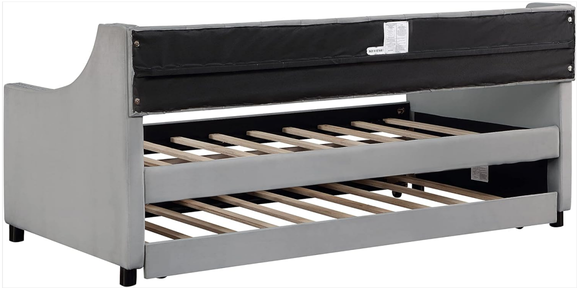
Image: Underside view of the daybed, revealing the structure of the trundle frame and its wooden slats.