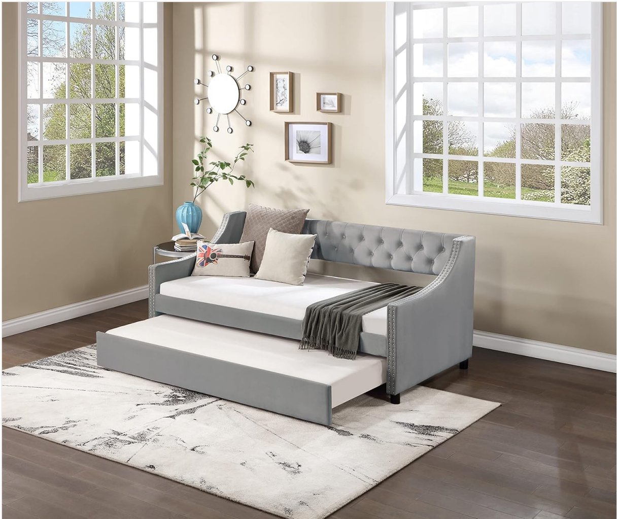
Image: Fully assembled Twin Size Upholstered Daybed with Trundle, showing the main bed and the trundle unit underneath.