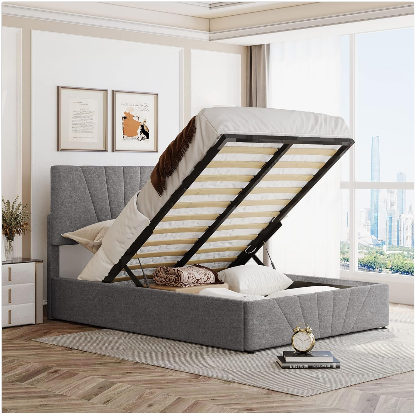
Figure 4: The hydraulic storage system in action, providing ample space underneath the mattress.