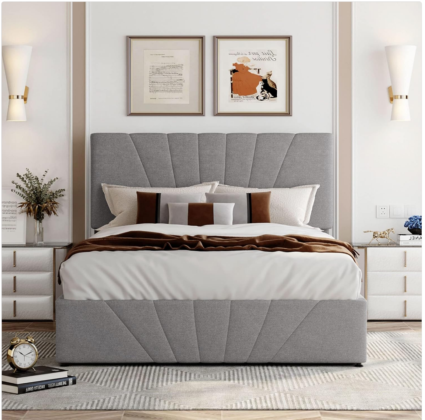
Figure 1: The Full Size Upholstered Platform Bed with its elegant gray linen fabric and decorative headboard.