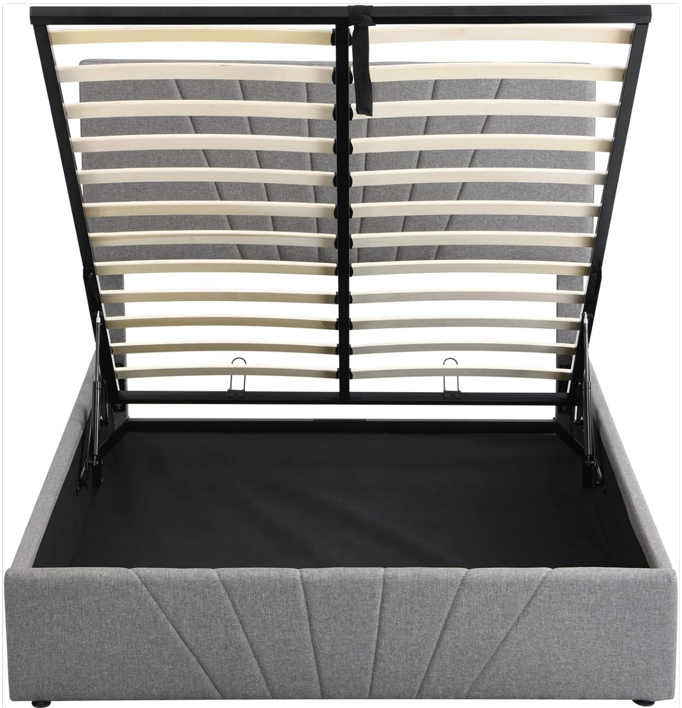
Figure 5: Front view of the bed with the mattress platform lifted, showcasing the full access to the storage area.