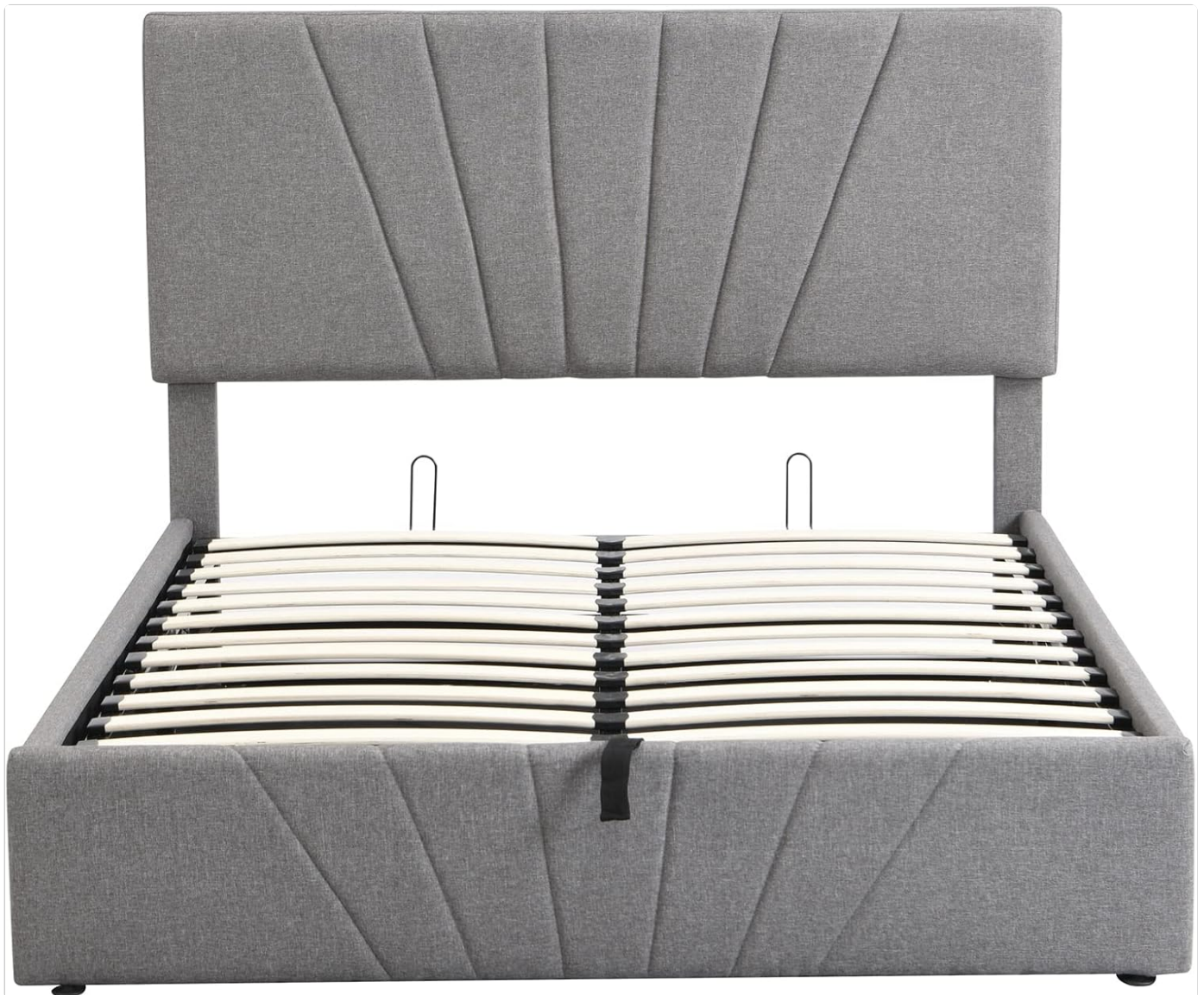
Figure 2: The bed frame structure, showing the slat system and hydraulic mechanism before mattress placement.