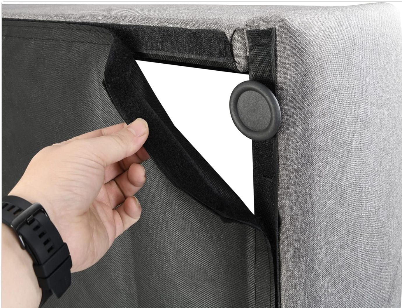
Figure 3: Example of fabric attachment using velcro, often found on the base or headboard.