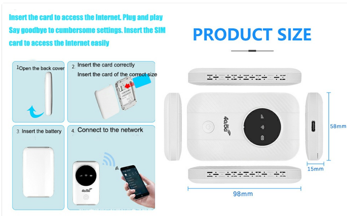
Image: A visual guide demonstrating how to open the back cover, correctly insert a SIM card, place the battery, and connect to the network using a smartphone.