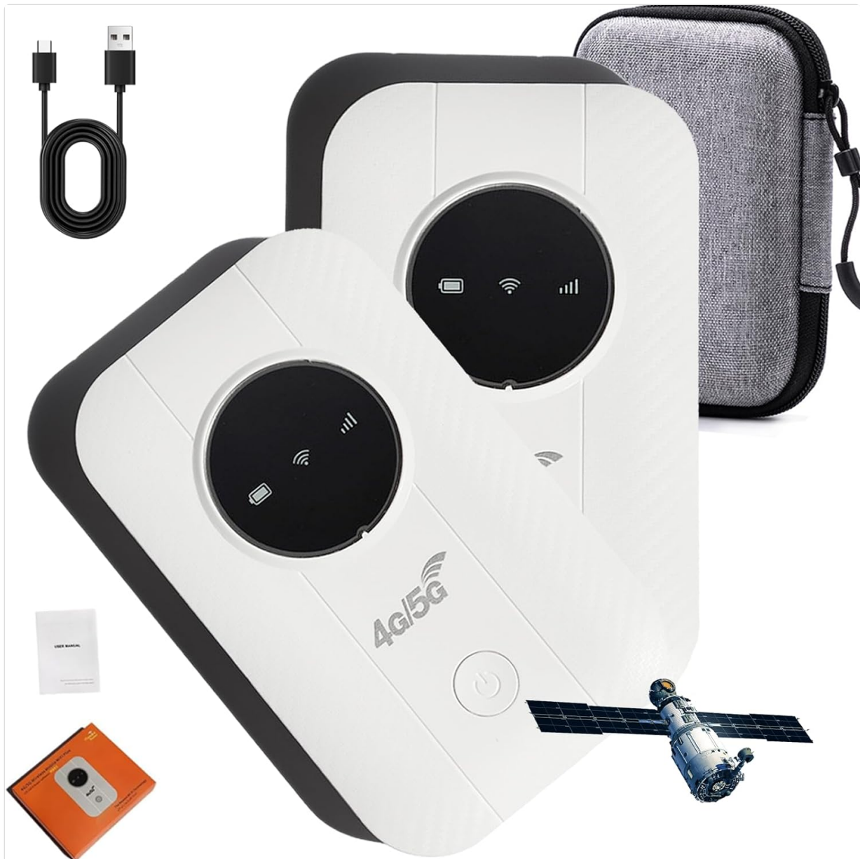
Image: Contents of the EZGHAR Ultralink Pocket package, including the router, USB charging cable, and a grey storage bag.