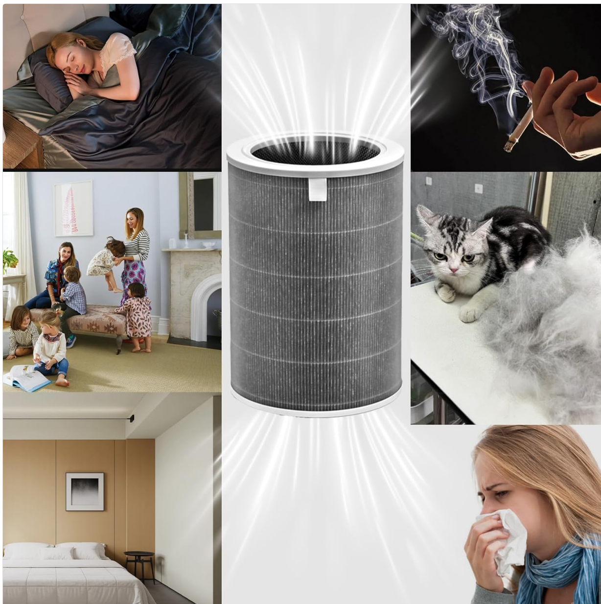
Image: The M8R-FLH filter shown in contexts of pet owners, smokers, and allergy sufferers, highlighting its air purification capabilities.