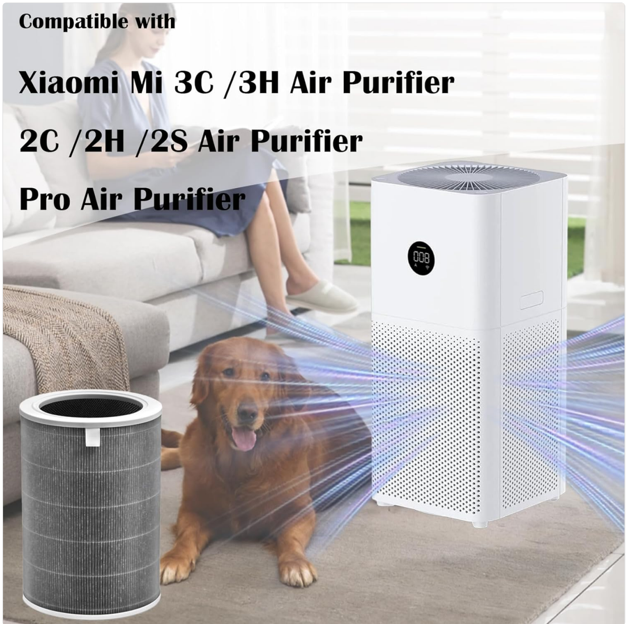
Image: Visual confirmation of the M8R-FLH filter's compatibility with various Xiaomi Mi Air Purifier models.