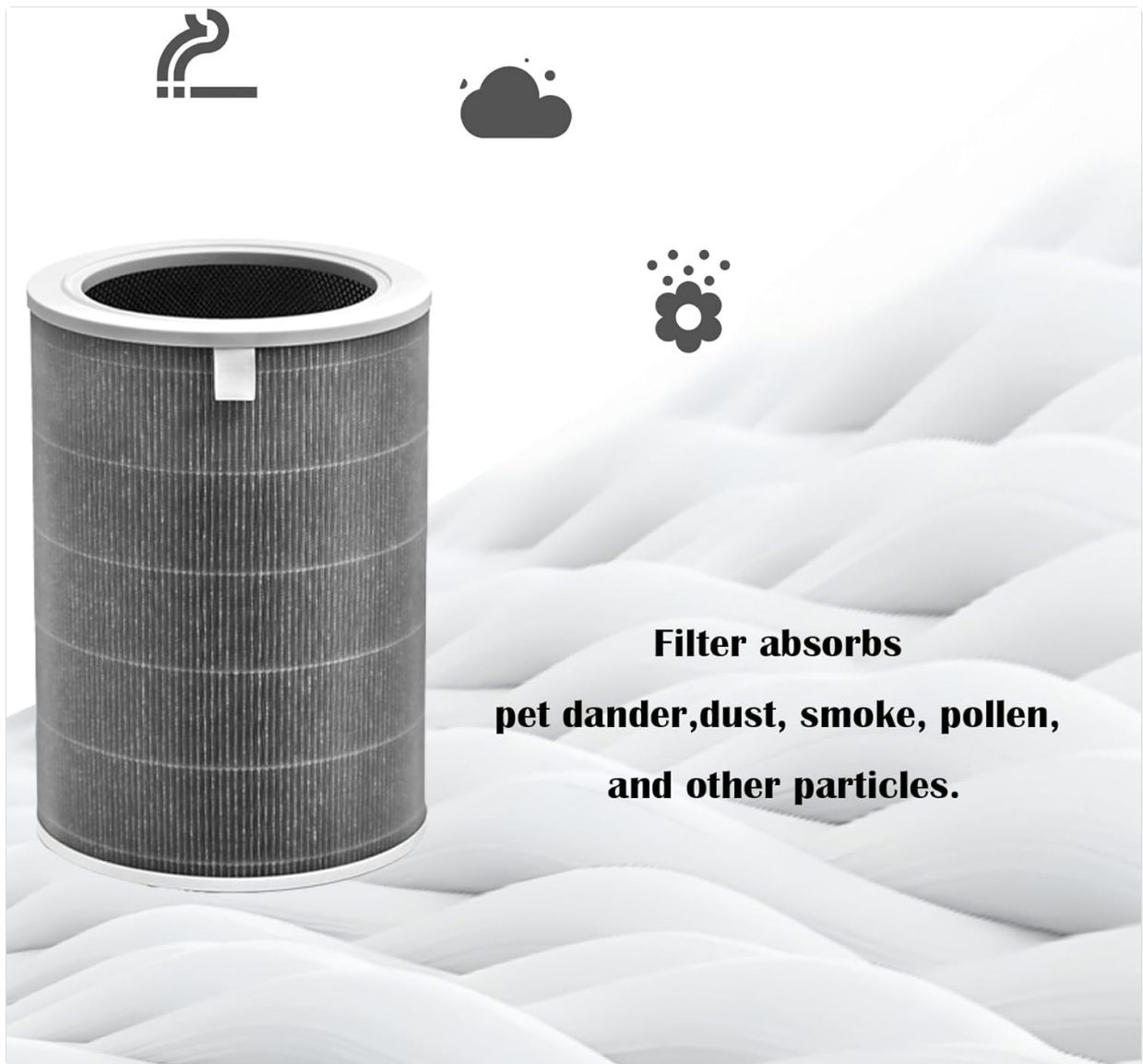
Image: The filter actively capturing various airborne pollutants like pet dander, dust, smoke, and pollen.