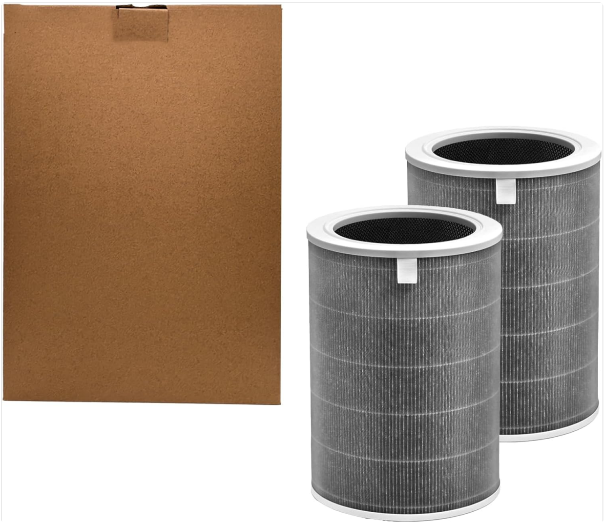
Image: A view of the product packaging, showing two M8R-FLH replacement filters.