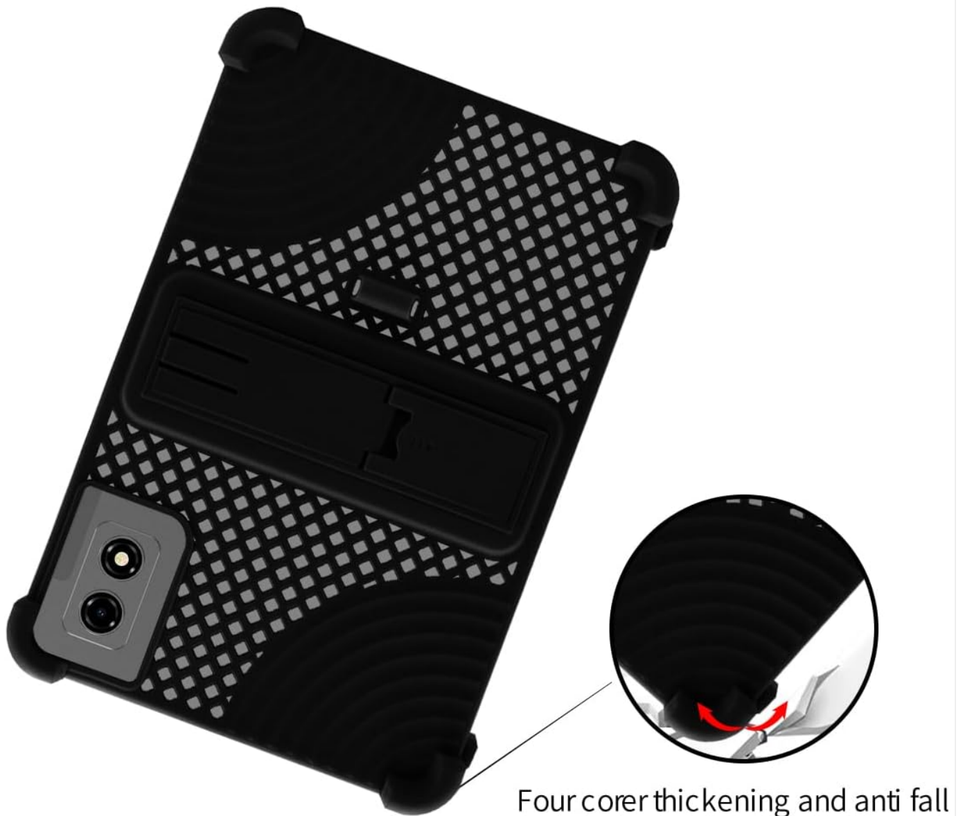
Figure 7.1: The case offers drop resistance and anti-scratch protection with reinforced corners.