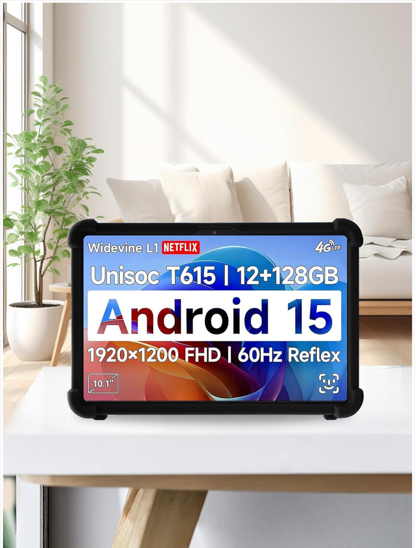
Figure 1.1: BOVUGAC Soft Silicone Tablet Case with a tablet installed.