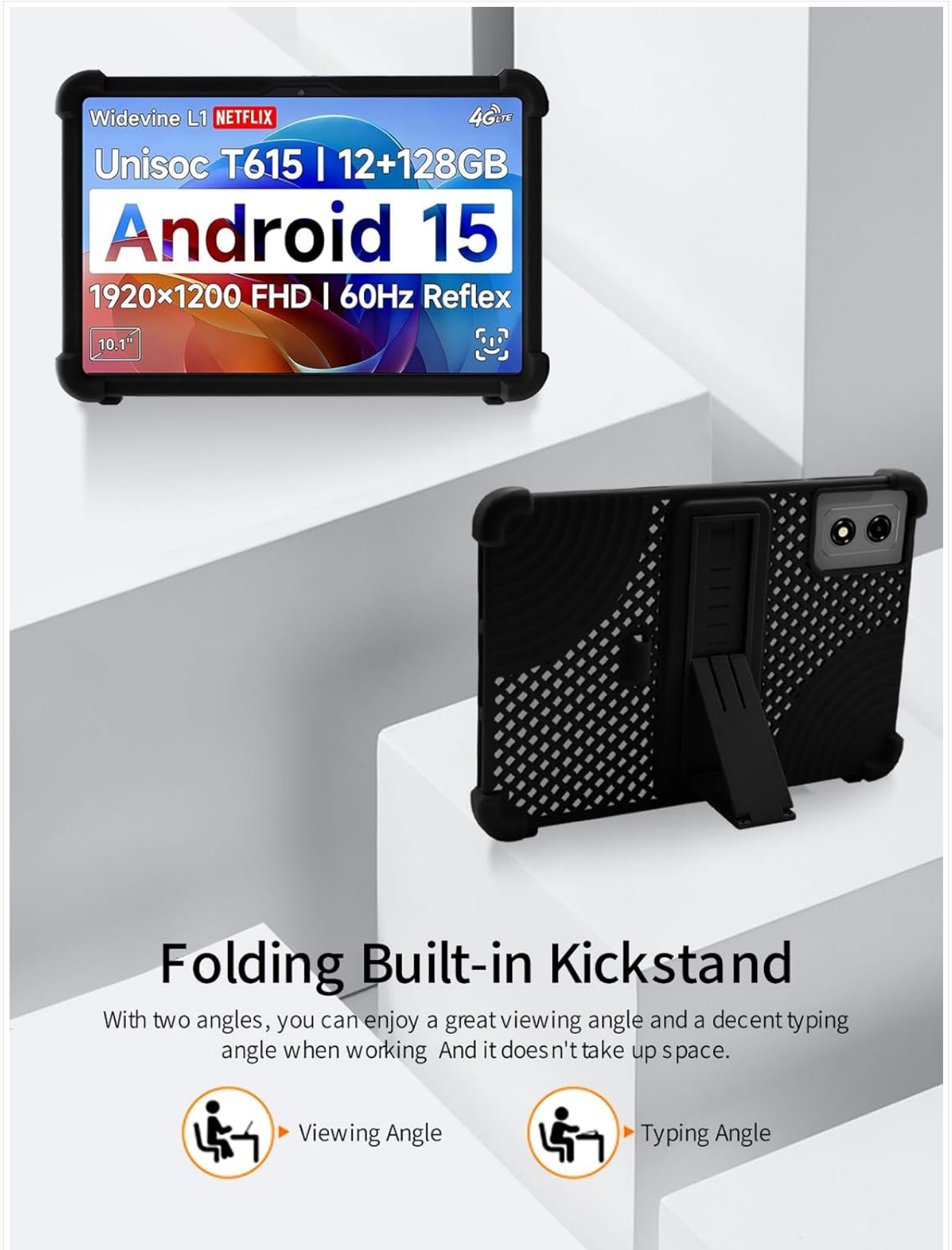
Figure 5.1: The folding kickstand provides stable viewing and typing angles.