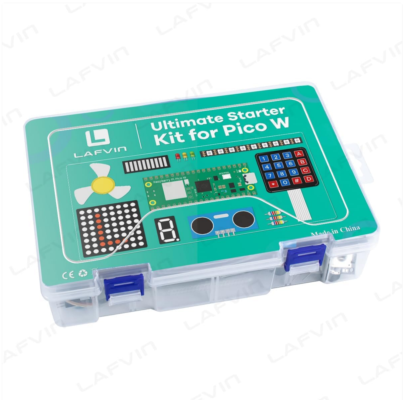
Image 1.1: The LAFVIN Ultimate Starter Kit for Raspberry Pi Pico W packaging.