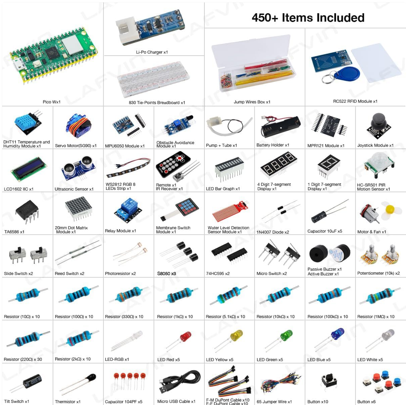
Image 2.1: Visual representation of the 450+ items included in the kit.