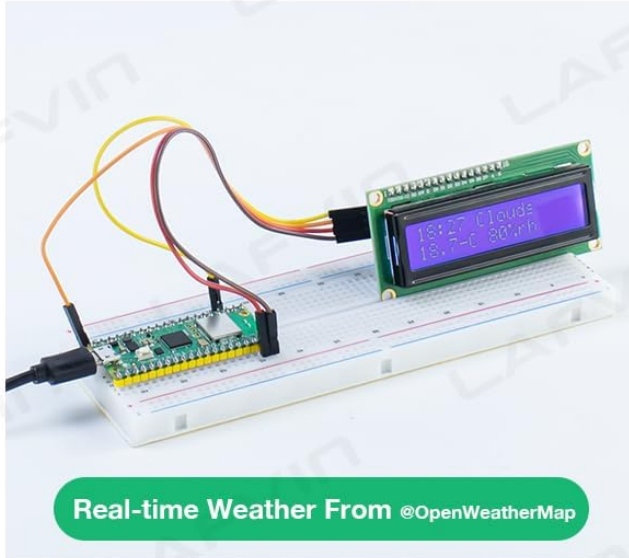
Real-time Weather From @OpenWeatherMap