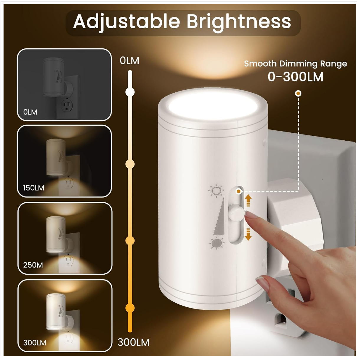
Figure 6.2: The dimming wheel provides a smooth adjustment range from 0 to 300 lumens, allowing precise control over light intensity.