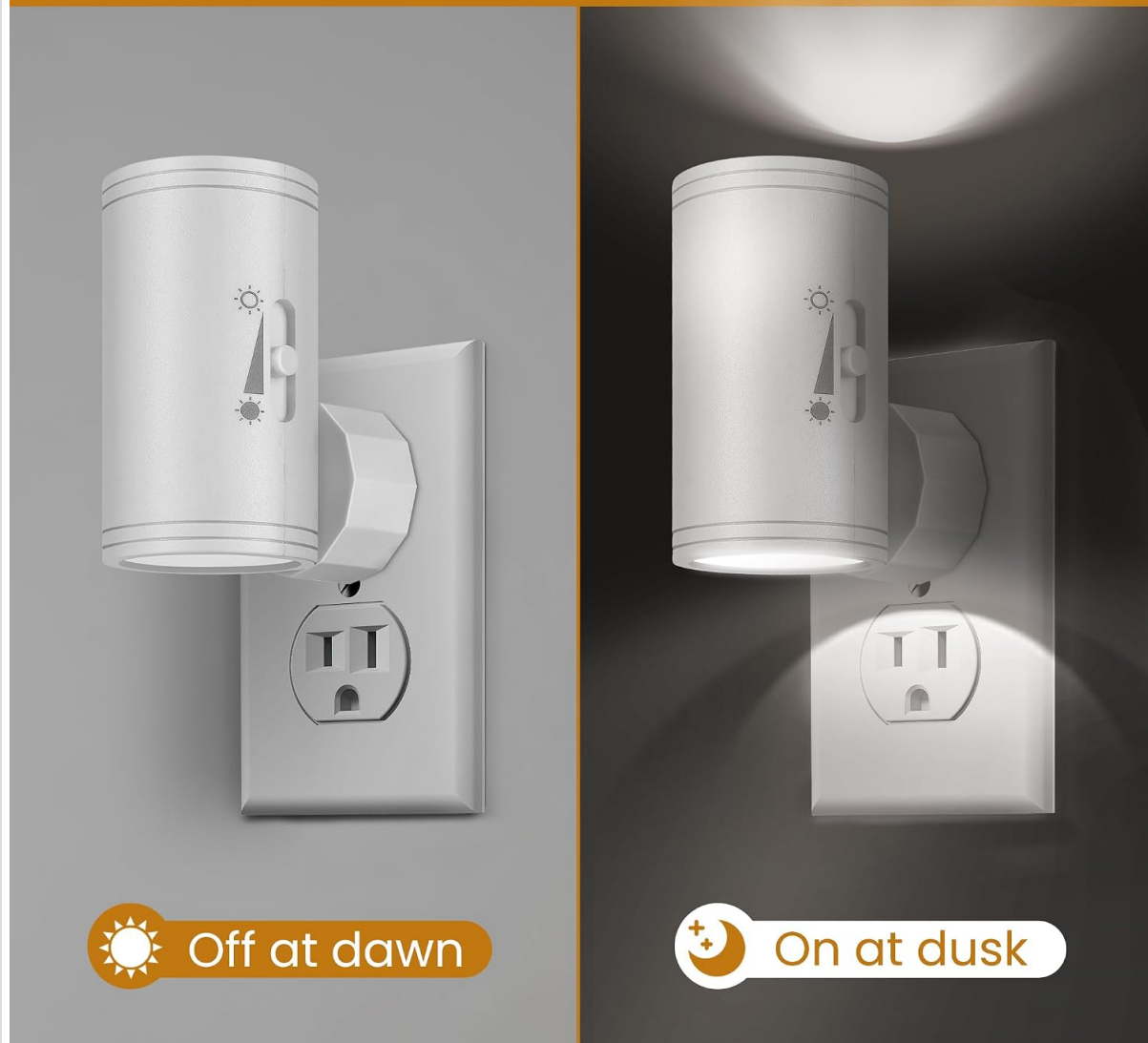
Figure 6.1: The integrated sensor automatically activates the light at dusk and deactivates it at dawn, providing hands-free operation.