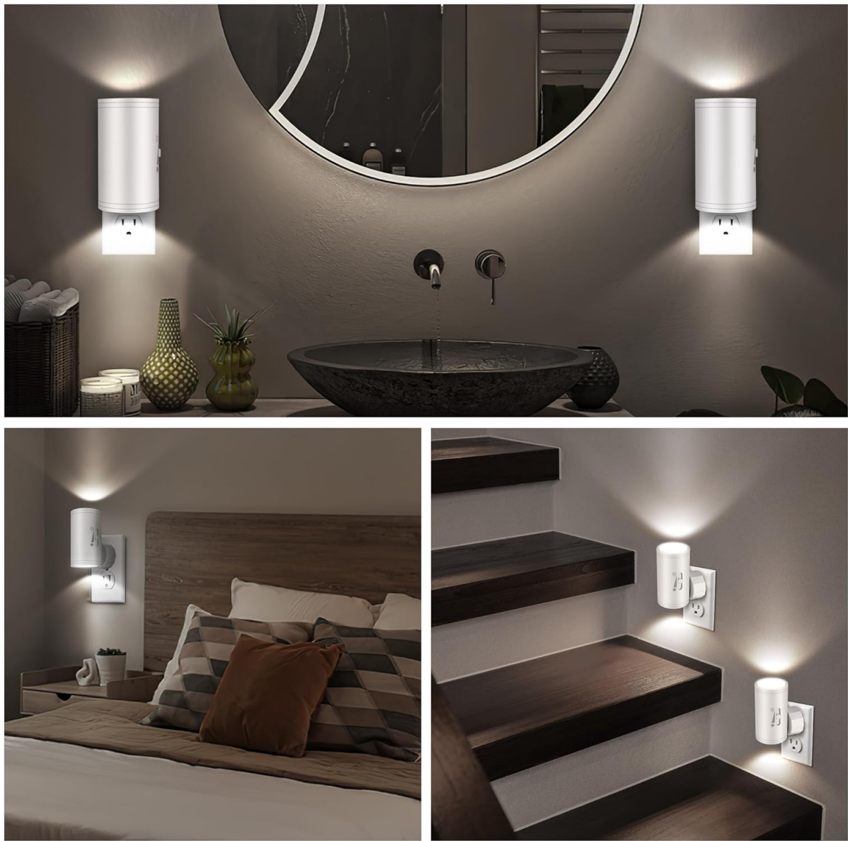
Figure 4.2: Examples of the night light's versatile application in various home environments, including bathrooms, bedrooms, and stairways.