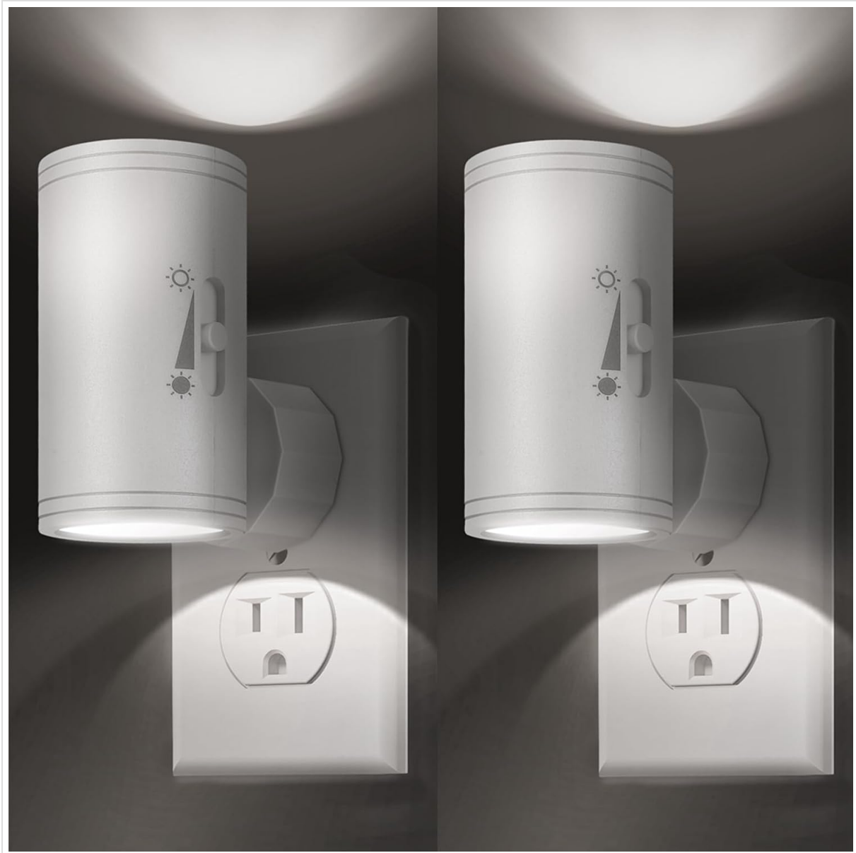
Figure 4.1: Two SETEN Dimmable LED Night Lights in use, showcasing their compact design and light output.