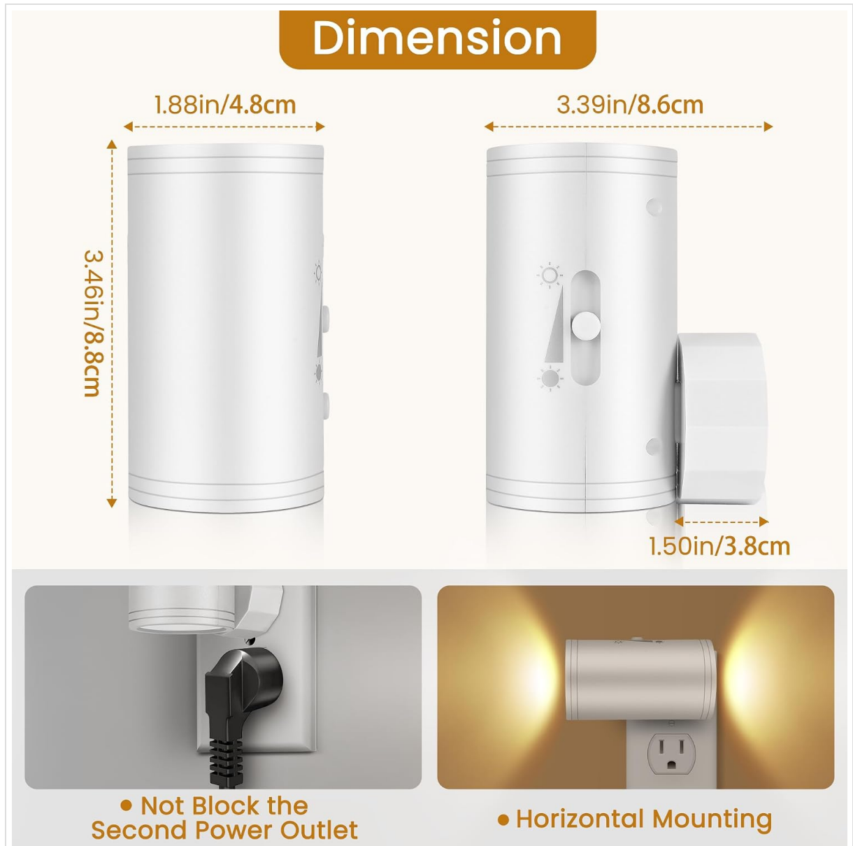
Figure 9.1: Detailed dimensions of the night light for reference.