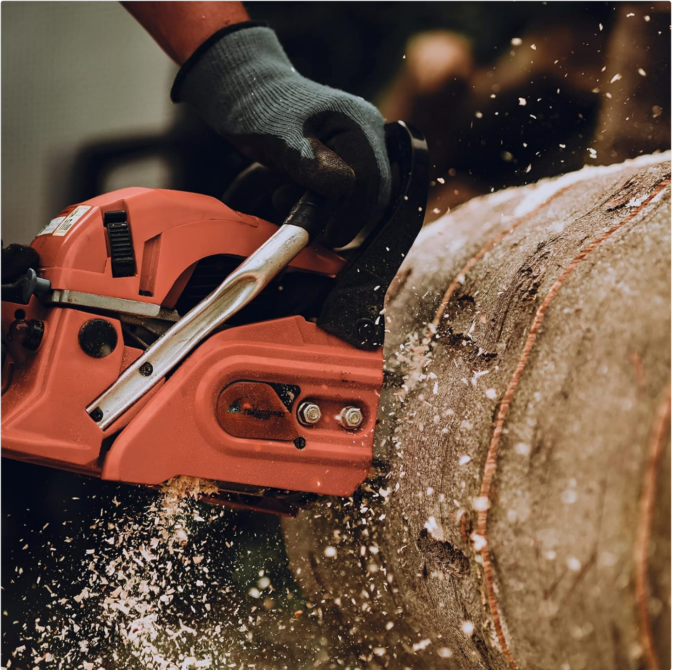
Image: Chainsaw in operation, cutting wood.