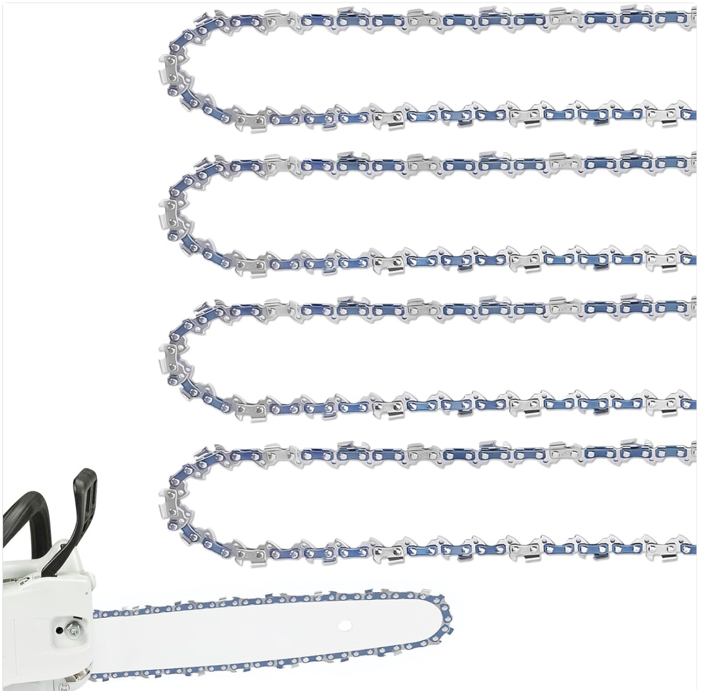
Image: Four FUNKYWOO 8-inch chainsaw chains.