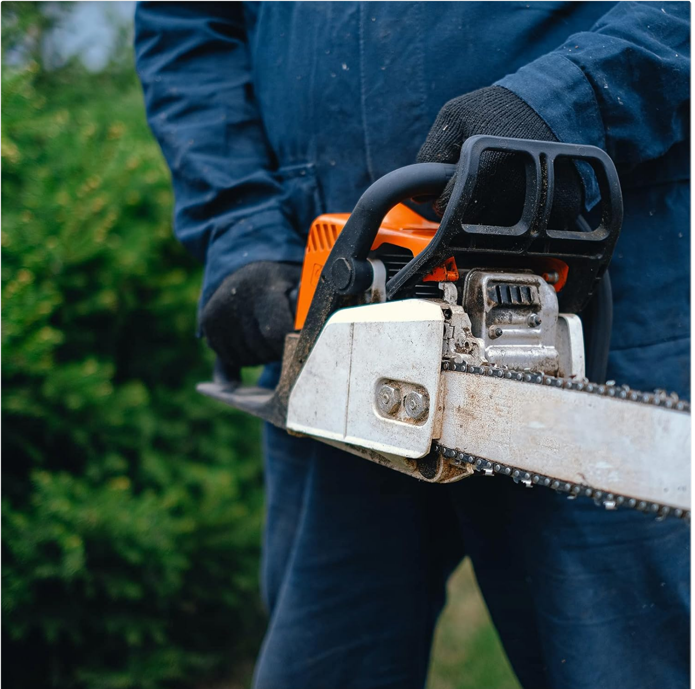
Image: Proper handling of a chainsaw.