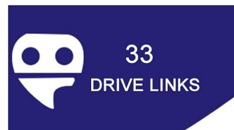
Image: Detailed specifications of the chainsaw chain.