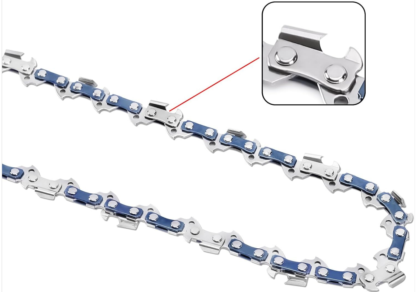
Image: Sharp cutter of the chainsaw chain.