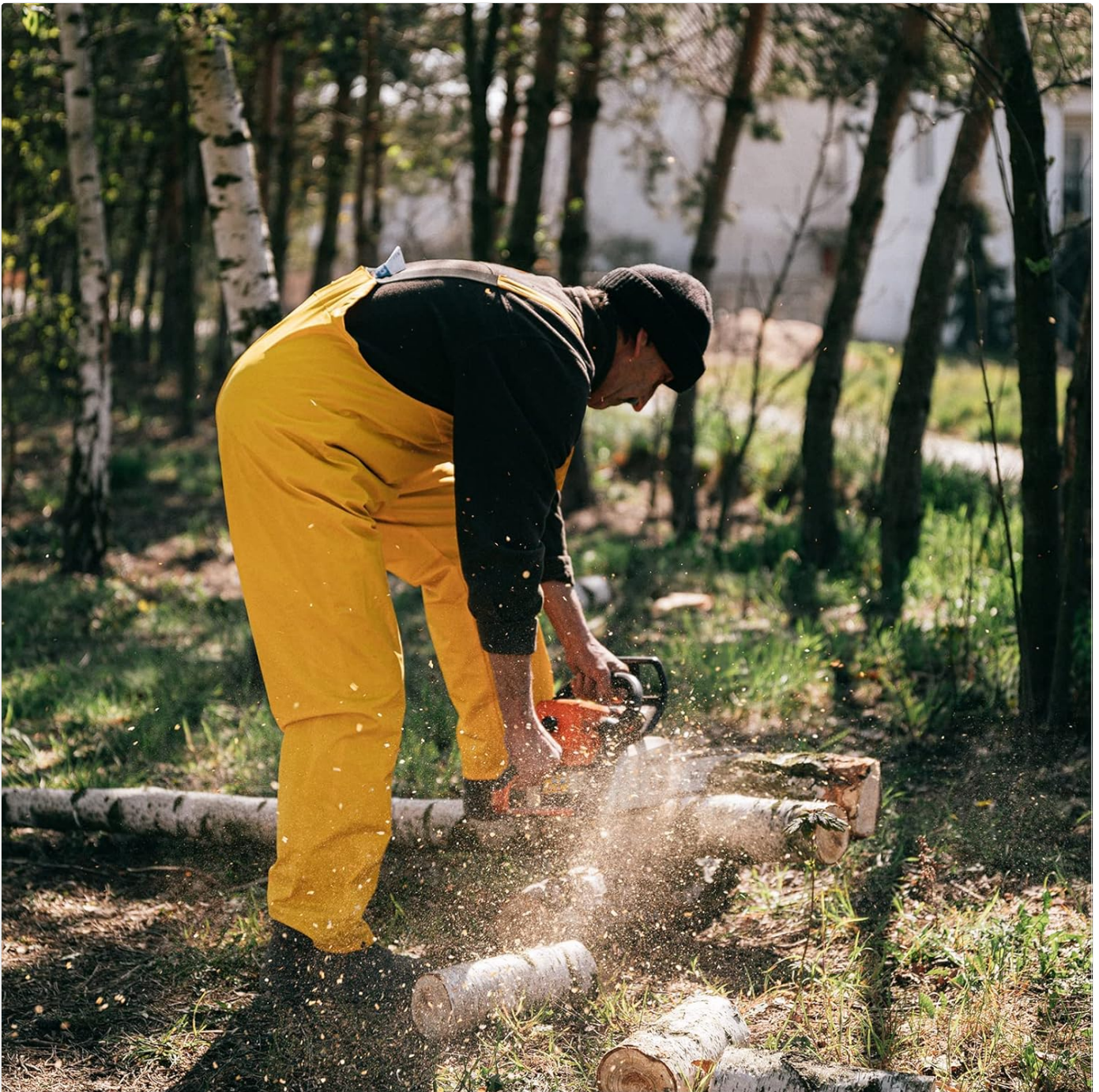
Image: Chainsaw cutting logs outdoors.