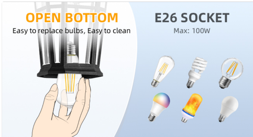
Image: A diagram illustrating the open bottom design of the fixture, which facilitates easy bulb replacement and cleaning. Compatible with E26 bulbs up to 100W.

Image: The pendant light shown with an adapter for installation on a sloped ceiling, highlighting its versatility.