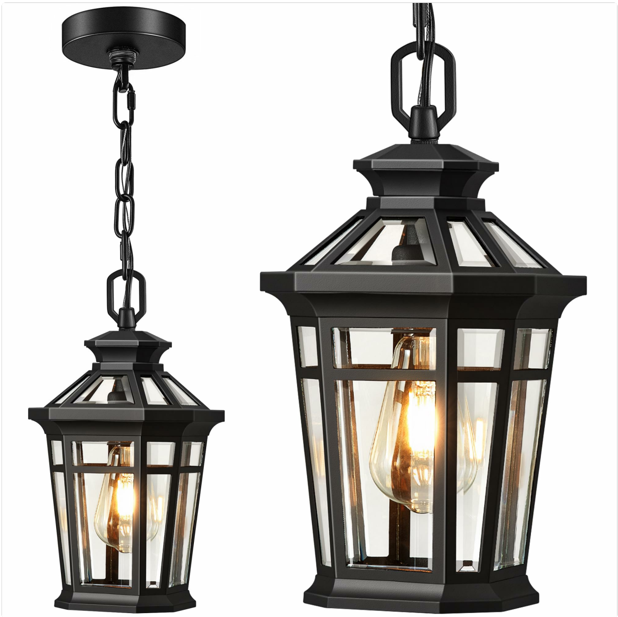
Image: The OPAXIS Outdoor Pendant Light, Model P8305, featuring a matte black finish and beveled glass, suspended from a porch ceiling.