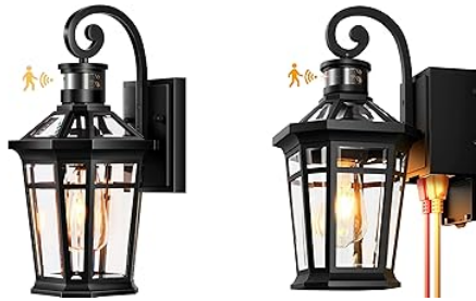
Image: The product is backed by a 3-Year Guaranteed Warranty and is ETL Listed, ensuring safety and quality standards.

This product comes with a 3-Year Limited Warranty , guaranteeing against defects in materials and workmanship under normal use. Please retain your proof of purchase for warranty claims.