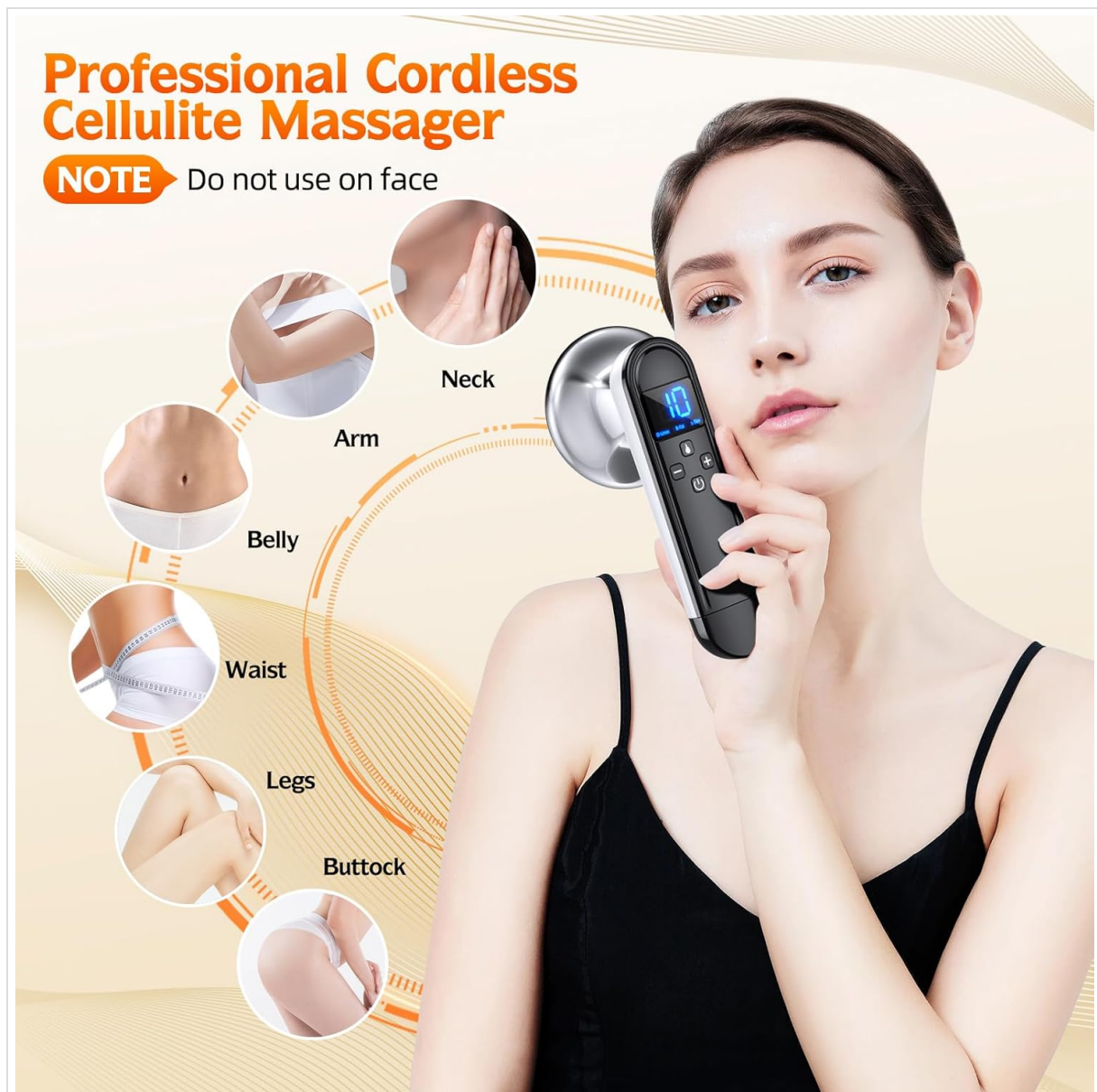
Figure 5.1: Demonstrates suitable application areas for the massager, including the neck, arm, belly, waist, legs, and buttocks. Note: Do not use on face.