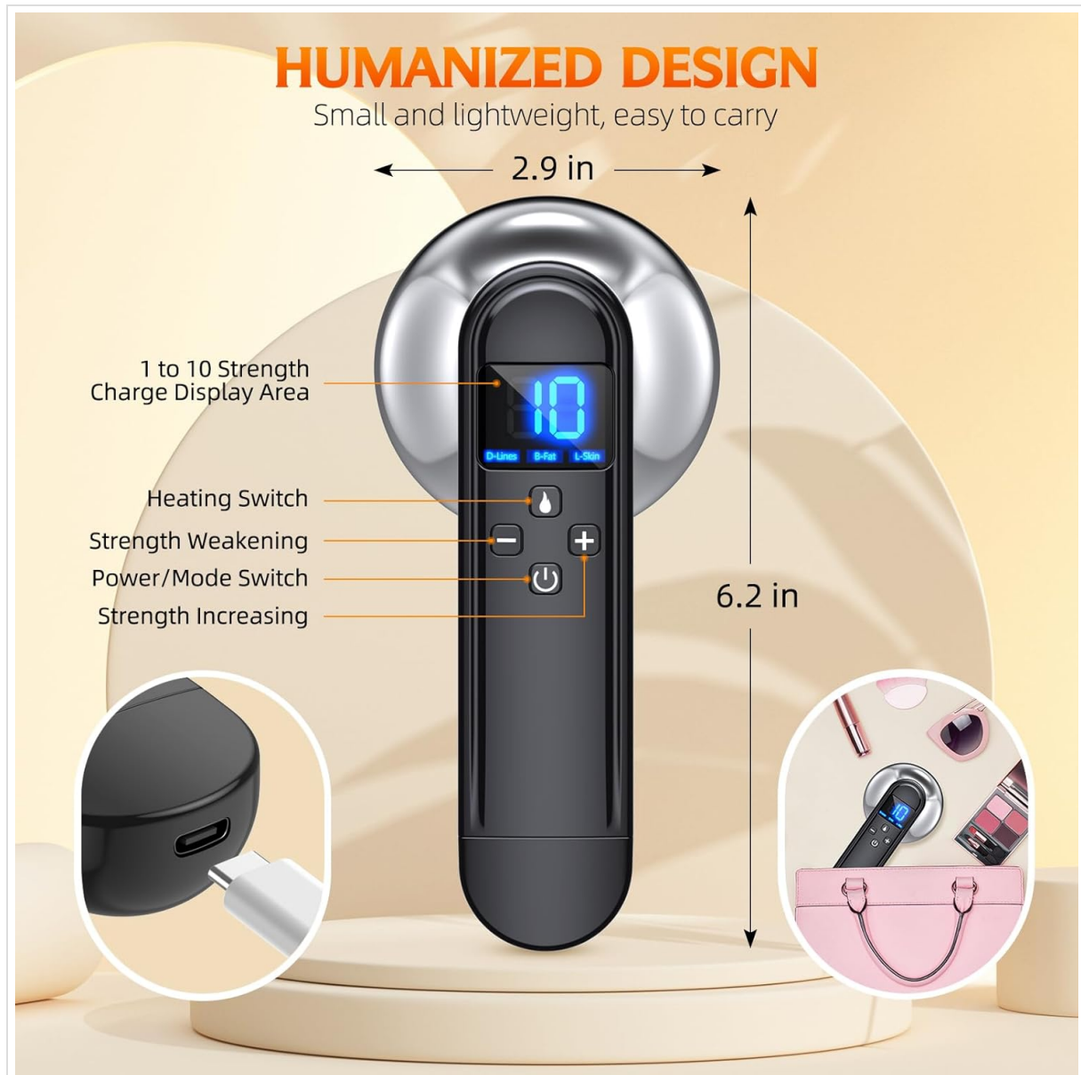
Figure 4.1: Overview of the device's controls, including the strength display, heating switch, strength adjustment buttons, and power/mode switch. Also shows compact dimensions.