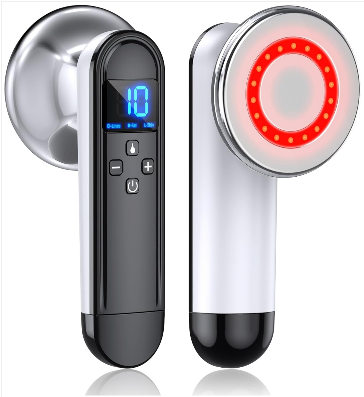
Figure 2.1: Front and back view of the COMEBY Body Sculpting Machine, showcasing its ergonomic design and control panel.