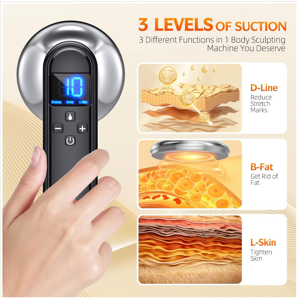
Figure 2.2: Illustration detailing the three primary functions: D-Line for stretch mark reduction, B-Fat for fat reduction, and L-Skin for skin tightening.