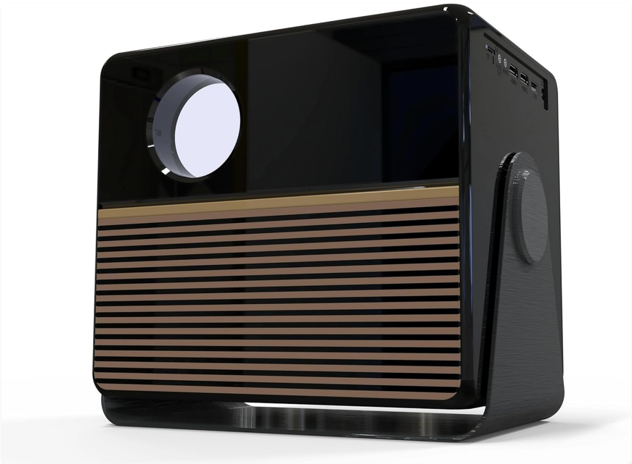
Figure 3.1: Front view of the RCA RPJ227 Mini Projector.