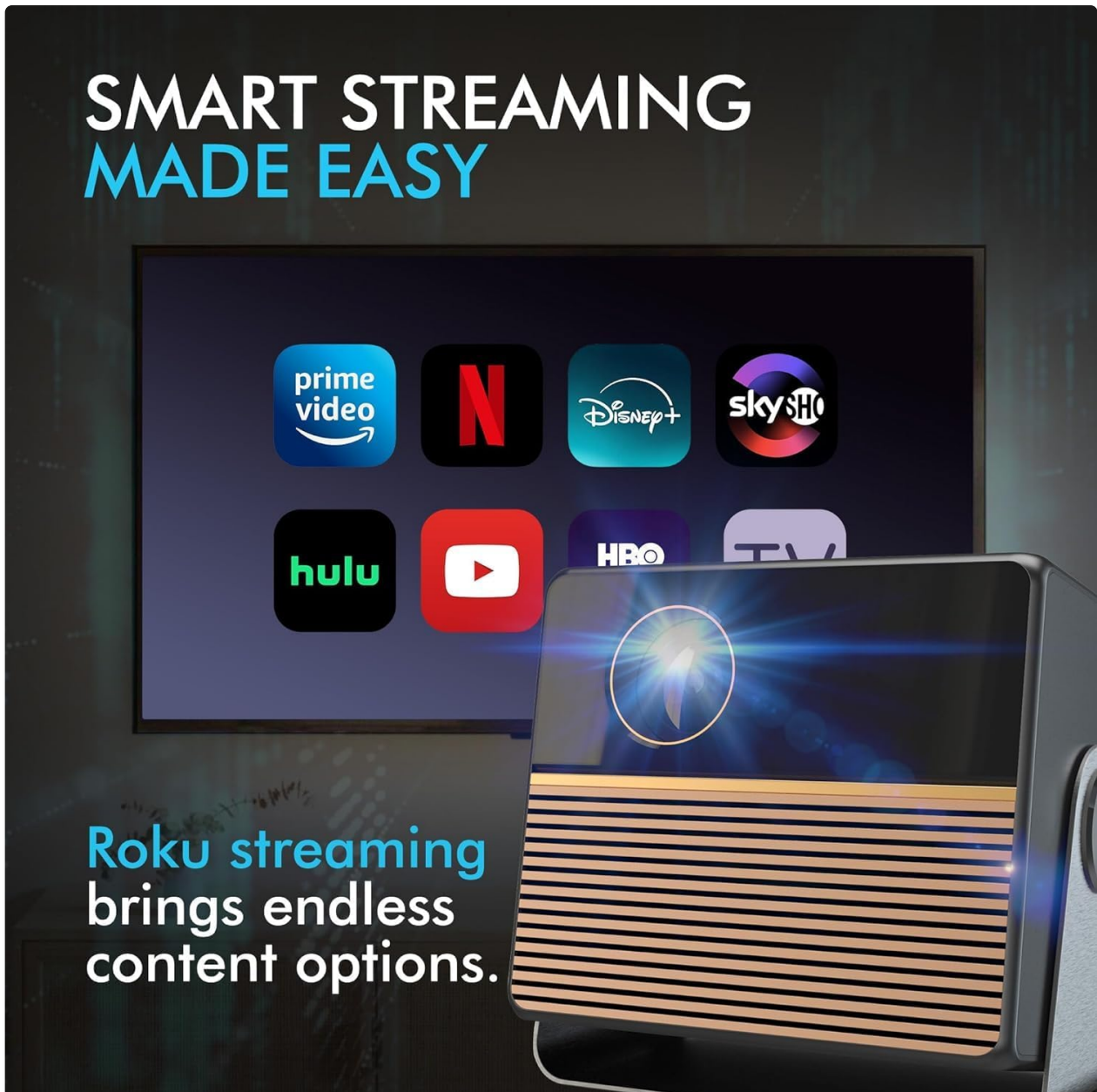
Figure 4.2: Smart streaming options available via Roku.

The projector integrates with Roku for smart streaming. Follow the on-screen instructions from the Roku interface to connect to your Wi-Fi network. This will enable access to streaming apps like Netflix, YouTube, Amazon Prime Video, and more.