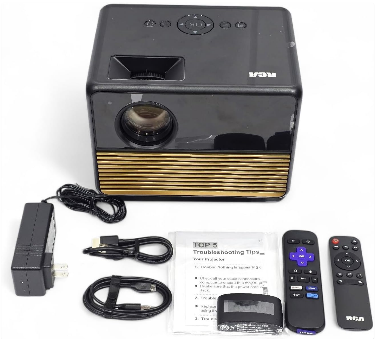
Figure 2.1: Contents of the RCA RPJ227 Mini Projector package.