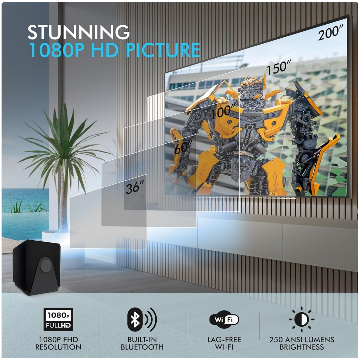
Figure 4.1: Example of adjustable screen sizes and 1080P HD picture quality.