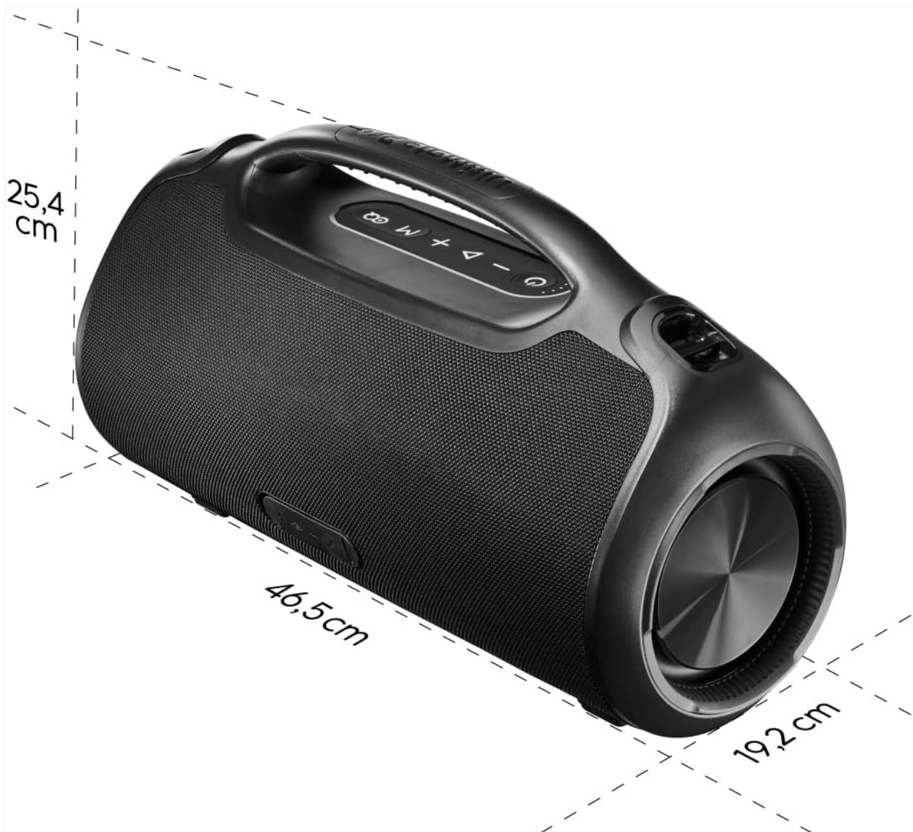
Physical dimensions of the Hama Ultimate Pro speaker for reference.