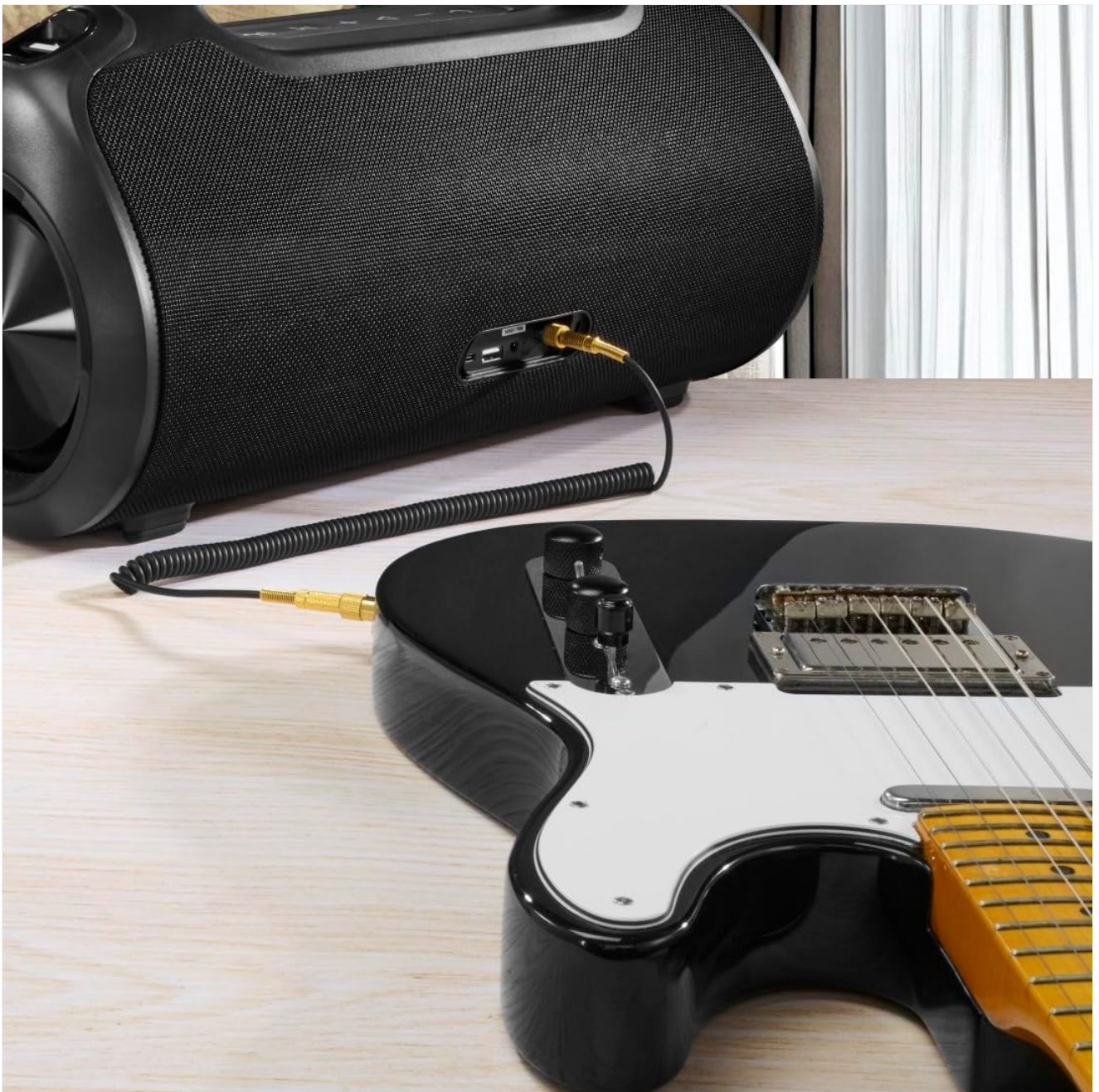
The speaker can be used as an amplifier by connecting an electric guitar via its 6.3mm jack input.