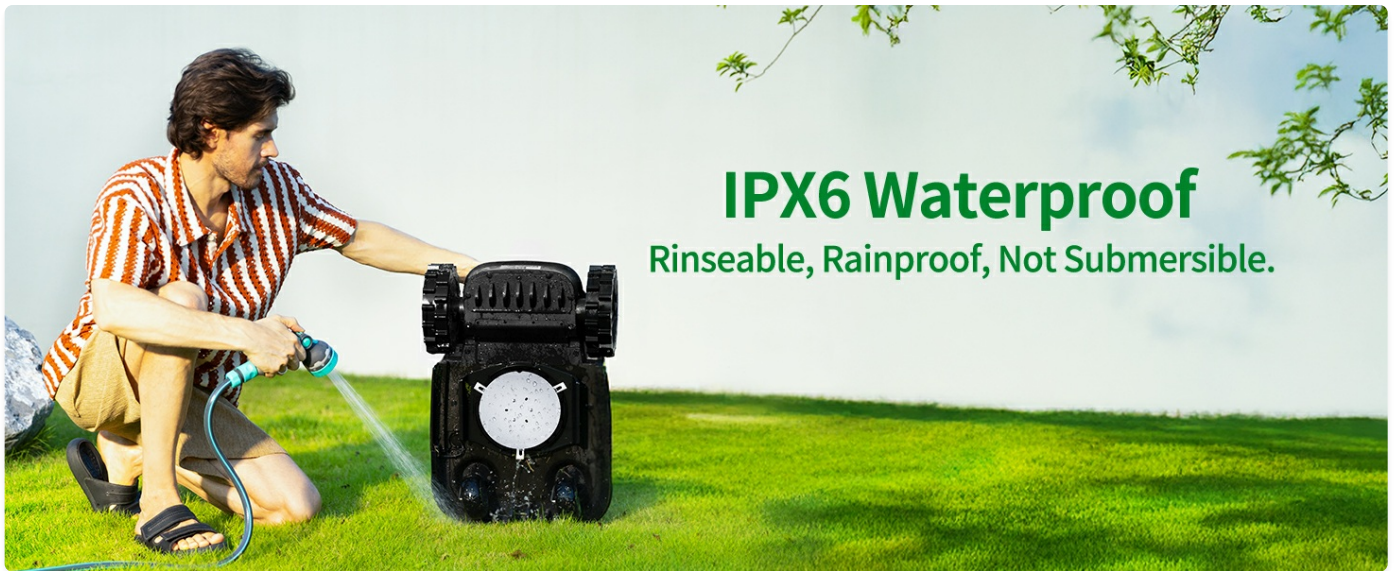
Figure 11: A user cleaning the underside of the mower with a hose, highlighting its IPX6 waterproof rating.