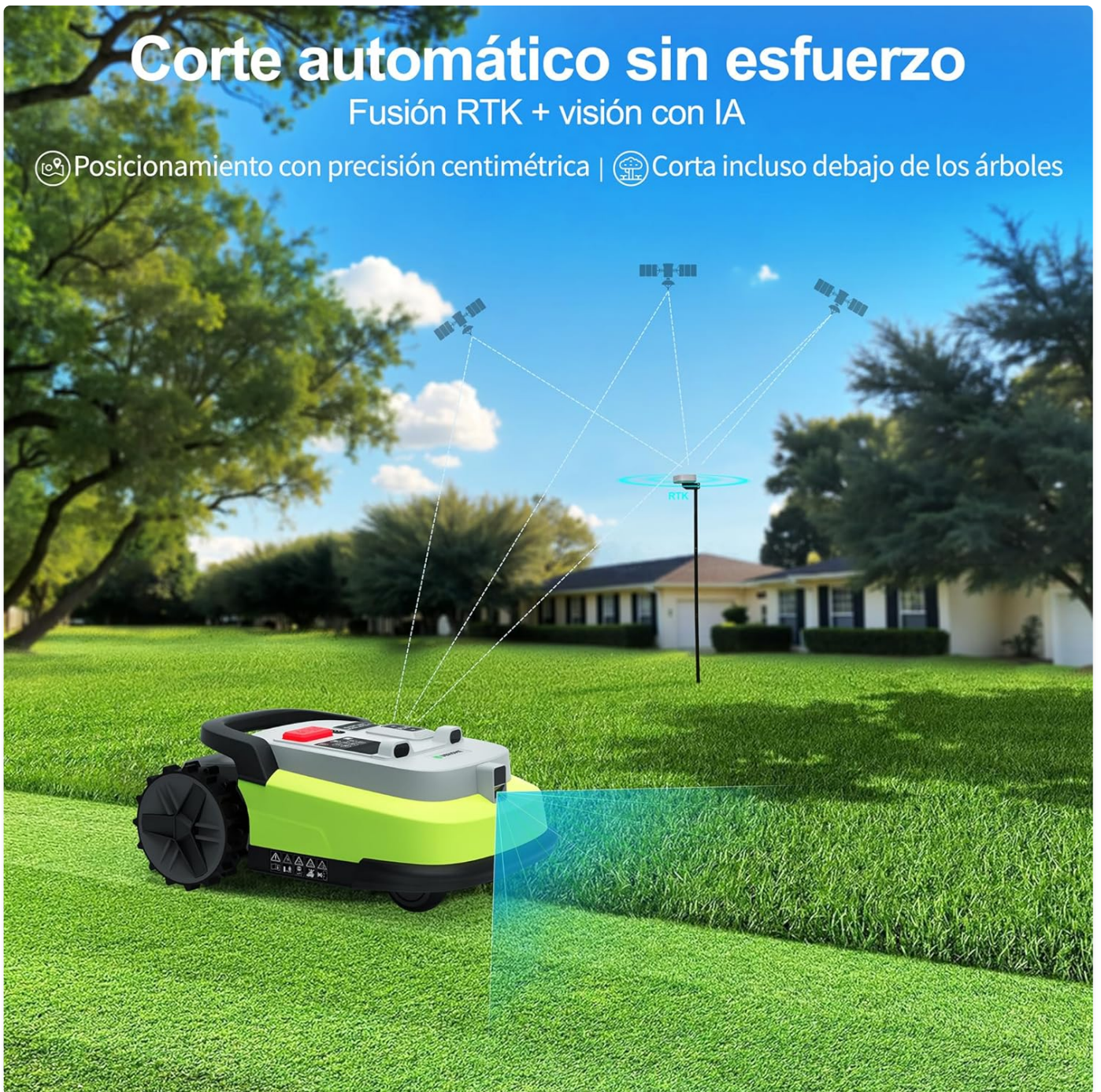
Figure 7: Visual representation of RTK and AI vision working together for precise navigation.

📍 Posicionamiento con precisión centimétrica | 🌐 Corta incluso debajo de los árboles