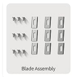
Figure 12: Illustration of the replacement blade assembly.

Regularly inspect the cutting blades for wear and tear. Replace dull or damaged blades using the provided replacement blade set and Allen wrench to ensure optimal cutting performance.