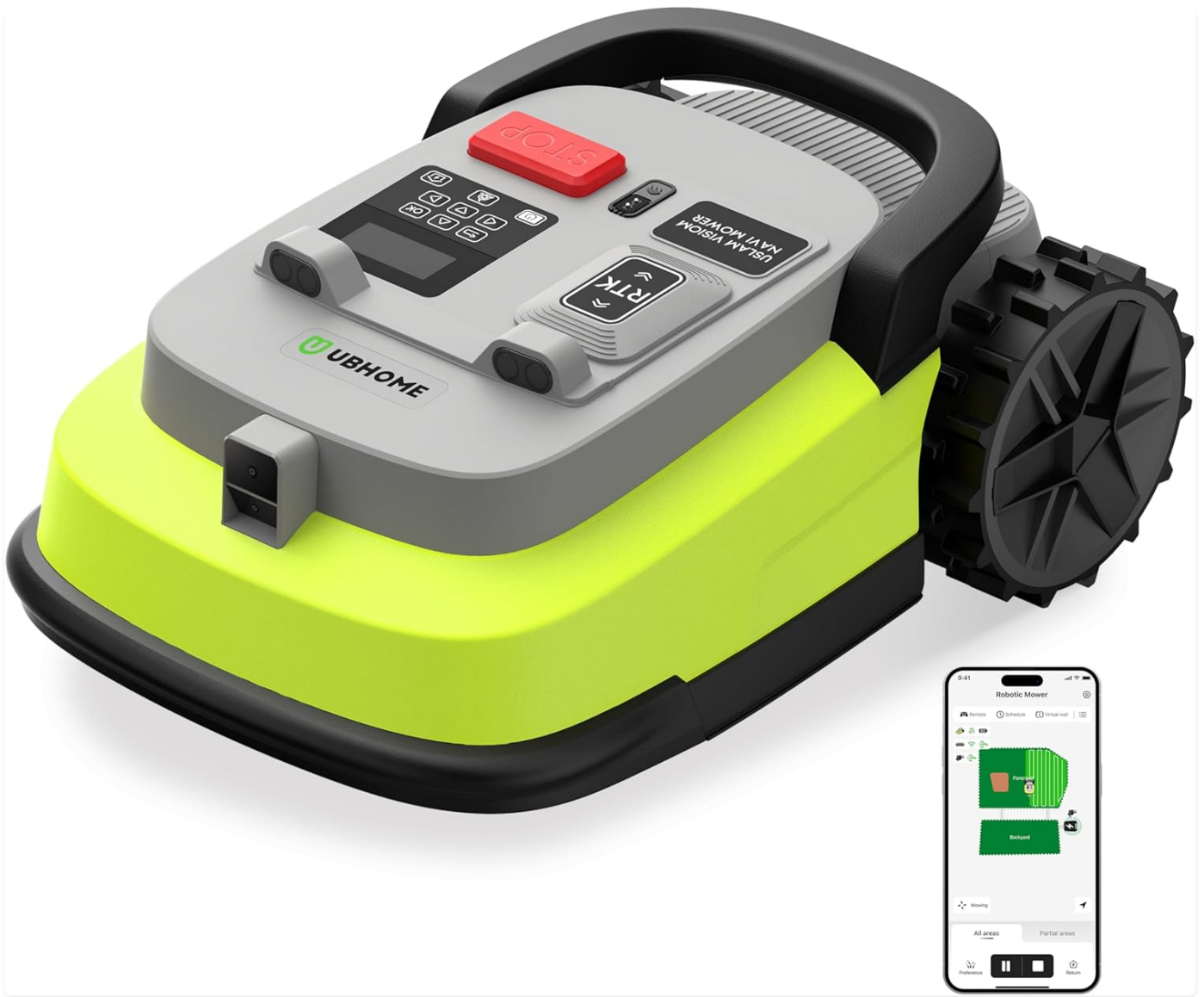
Figure 1: UBHOME Robot Lawn Mower M10 with its charging station and app interface.