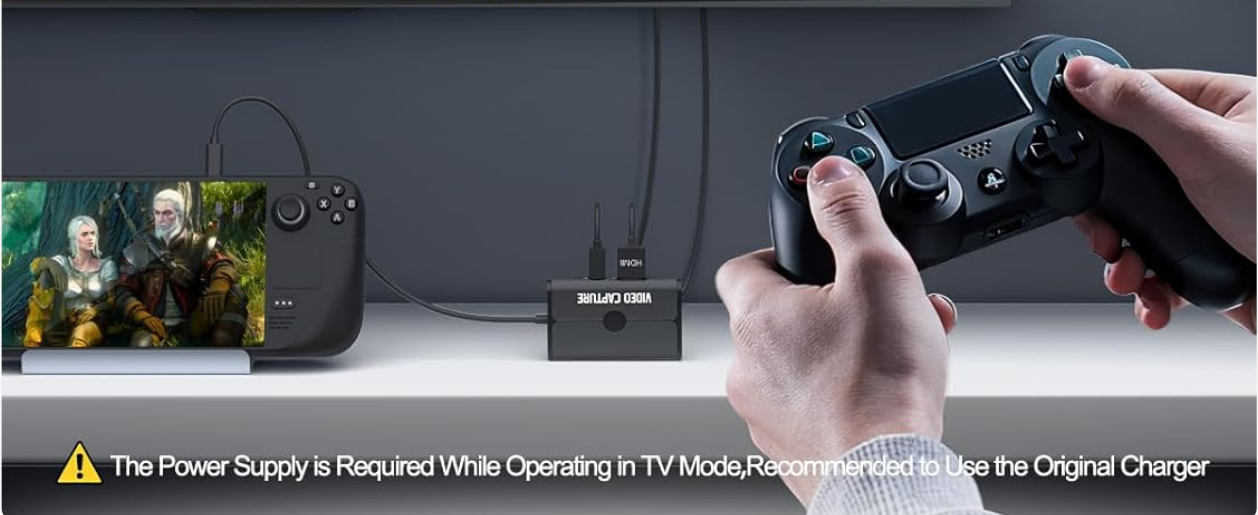
Image: A Nintendo Switch connected to the capture card, which is then connected to a large TV, enabling TV mode for multiplayer gaming. Power supply is recommended for TV mode.