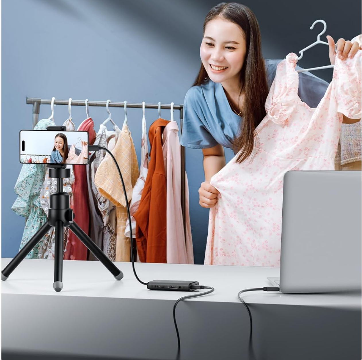
Image: A mobile phone connected to the capture card, which is then connected to a laptop for real-time recording without delay.