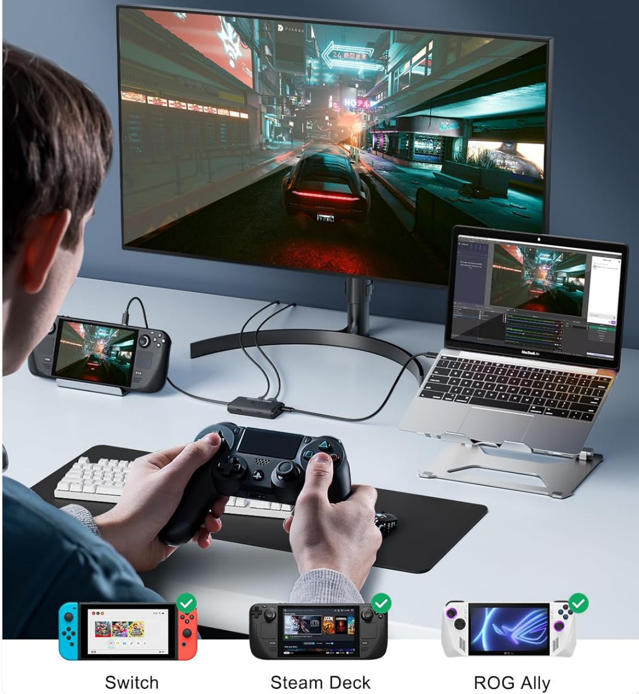
Image: A Nintendo Switch, Steam Deck, and ROG Ally connected to the capture card, which is then connected to a laptop and an external monitor for 1080P recording and display.