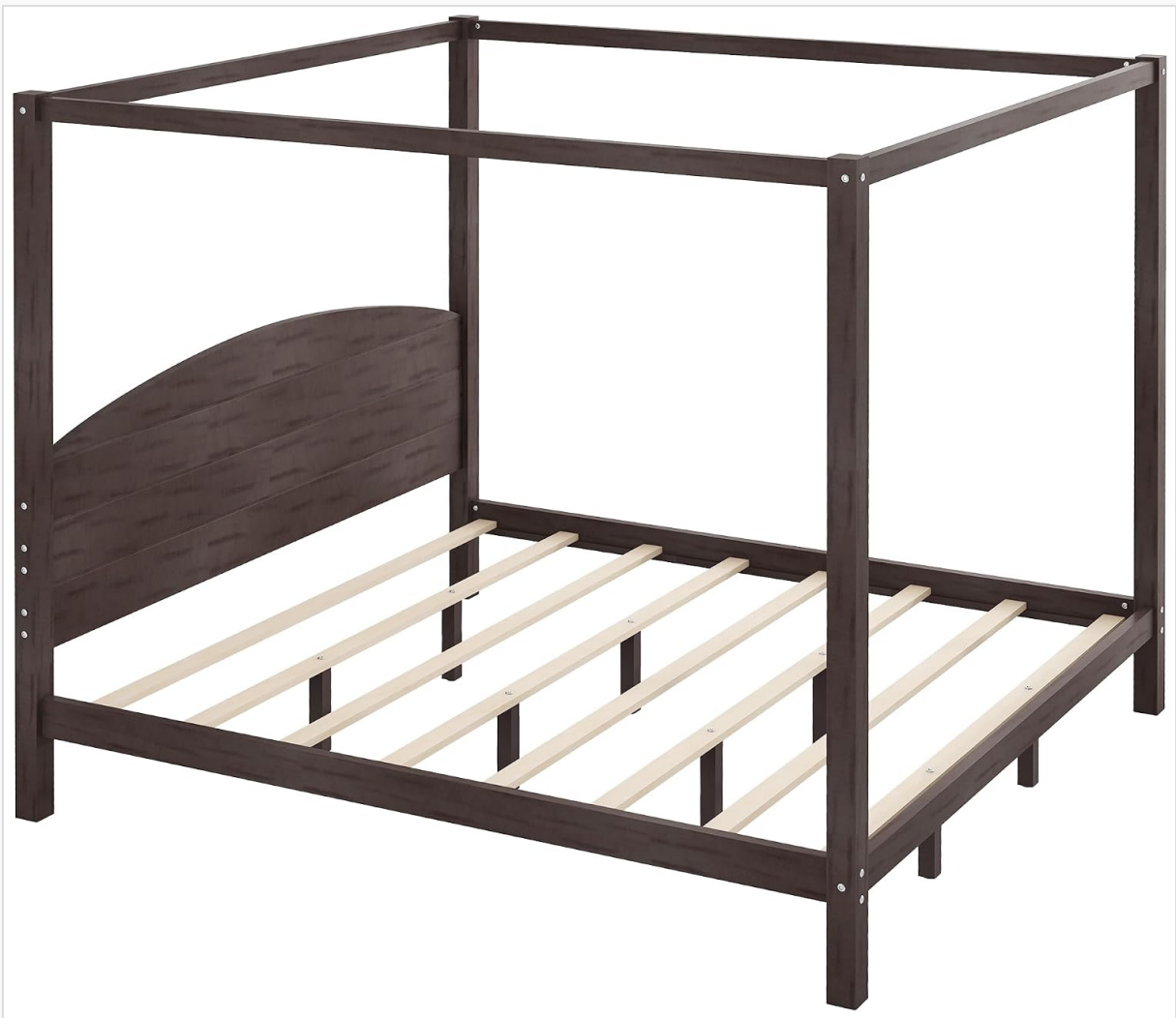
Image: Overview of the Merax King Canopy Bed Frame components before full assembly, showing the headboard, side rails, and canopy posts.