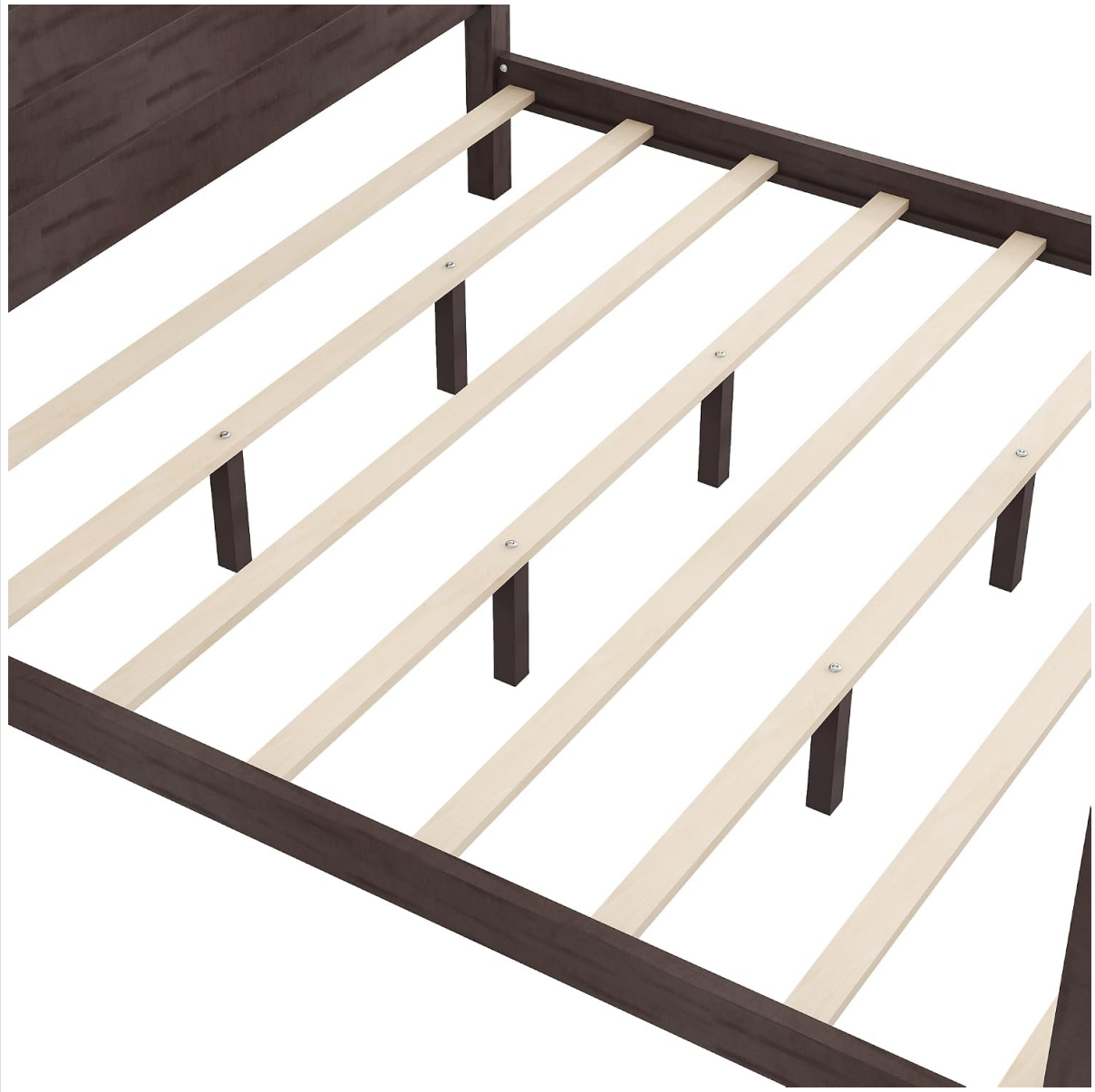
Image: Close-up view of the wooden slat support system and center support legs, illustrating how the mattress is supported.