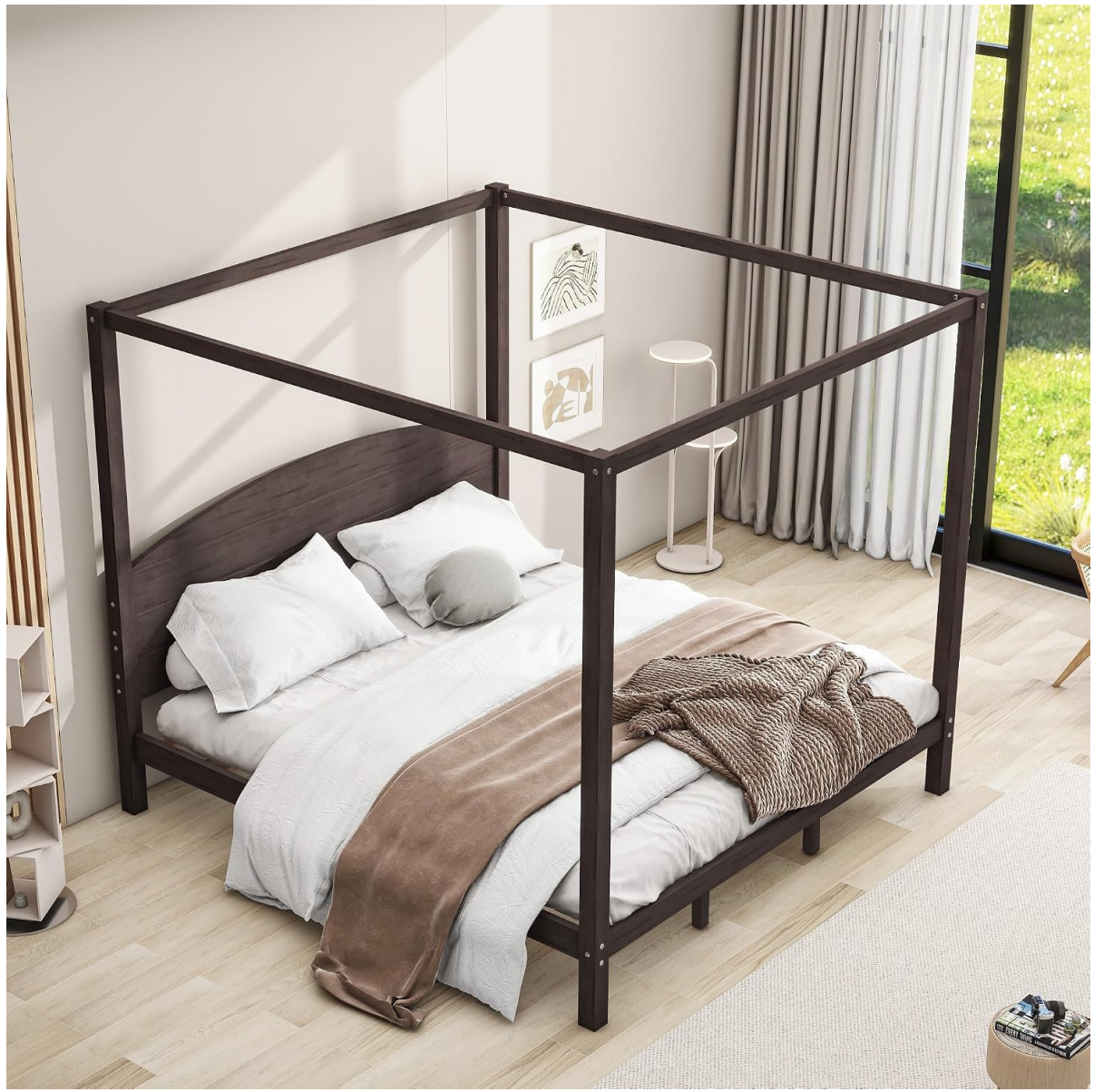
Image: The Merax King Canopy Bed Frame fully assembled with a mattress and bedding, showcasing its design and potential for decoration.