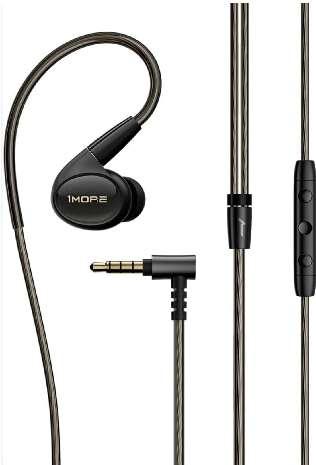
Image: The 1MORE P50 earphones, showcasing the earbud design, detachable cable with inline remote, and 3.5mm audio jack.