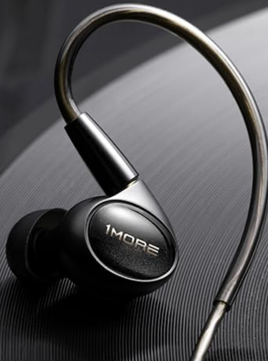
Image: Visual representation of key comfort features of the 1MORE P50, including the nozzle angle, ear hooks, lightweight design, and customizable ear tips.