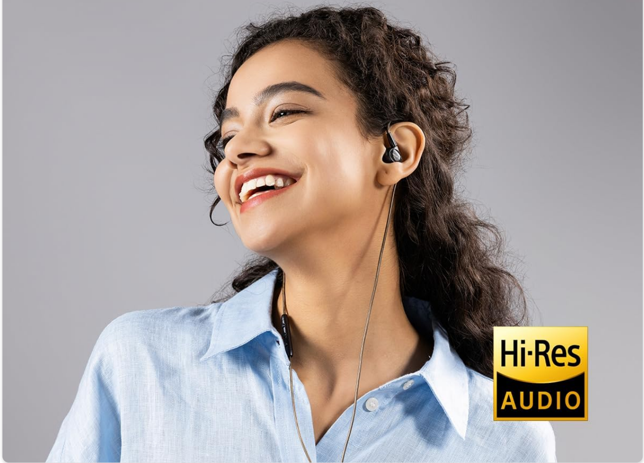
Image: The 1MORE P50 earphones being worn, illustrating the ergonomic design with ear hooks for a stable fit.

Expansive Soundstage High-fidelity Transmission No Need For An Amplifier