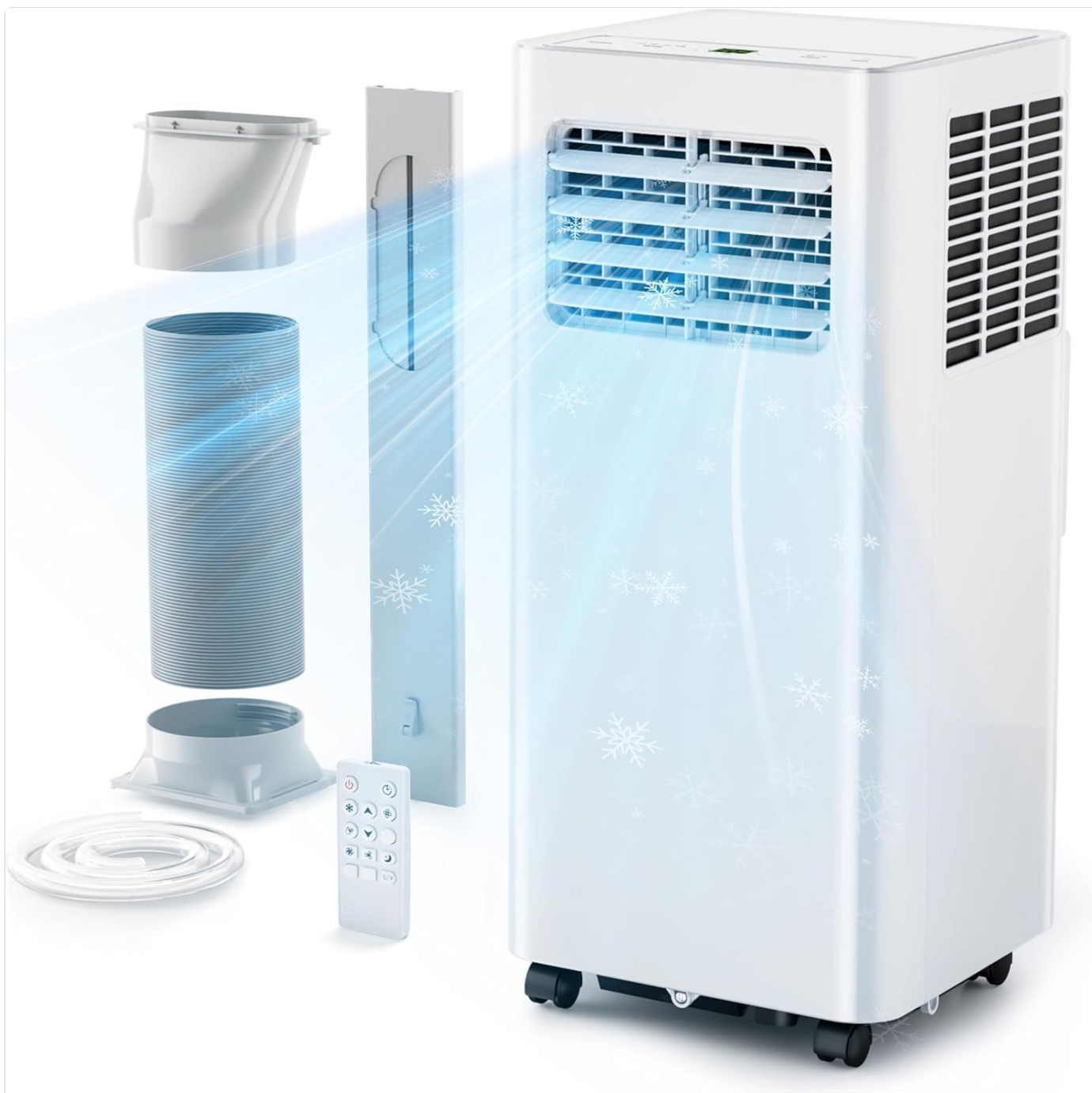
Figure 1: Main unit and included accessories (exhaust hose, window kit, remote control).