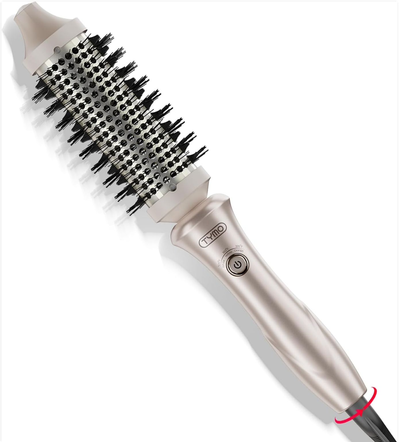
Figure 1: TYMO STYLUX 1.5 Inch Thermal Brush, Gold.