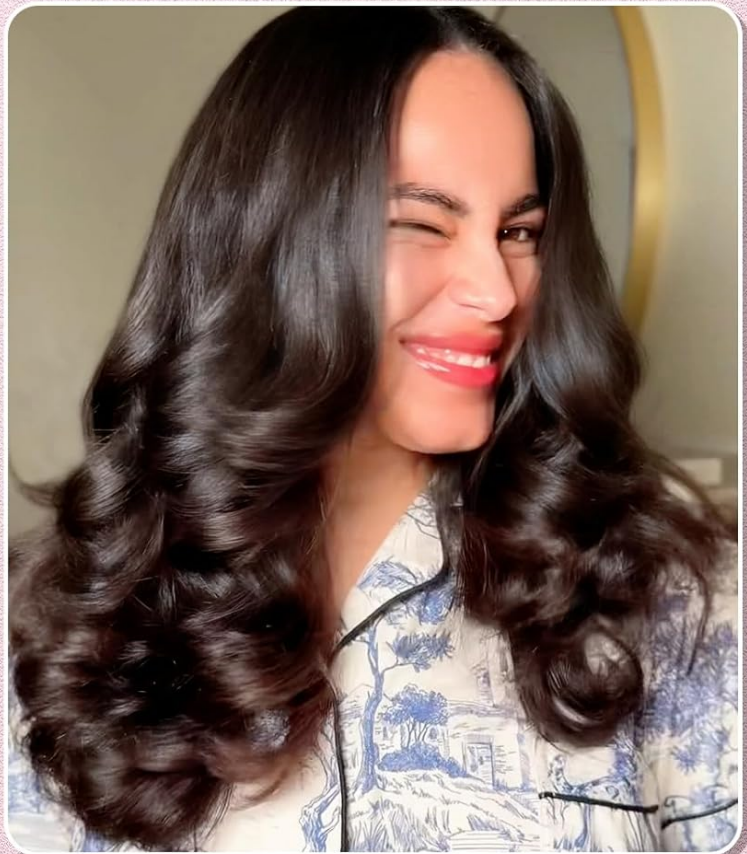
Figure 5: Achieving a bouncy blowout with the thermal brush.