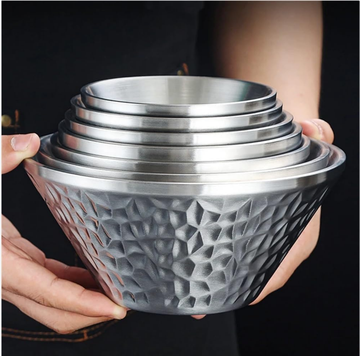
Figure 2: Illustration of the nested storage capability of the EFDNK-HB mixing bowls, demonstrating how they save cabinet space.