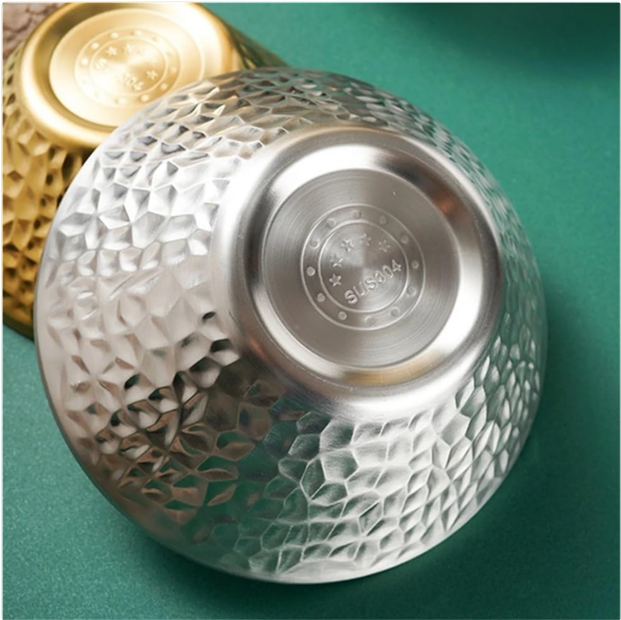
Figure 6: Close-up of the bowl's bottom, confirming the SUS304 stainless steel material.