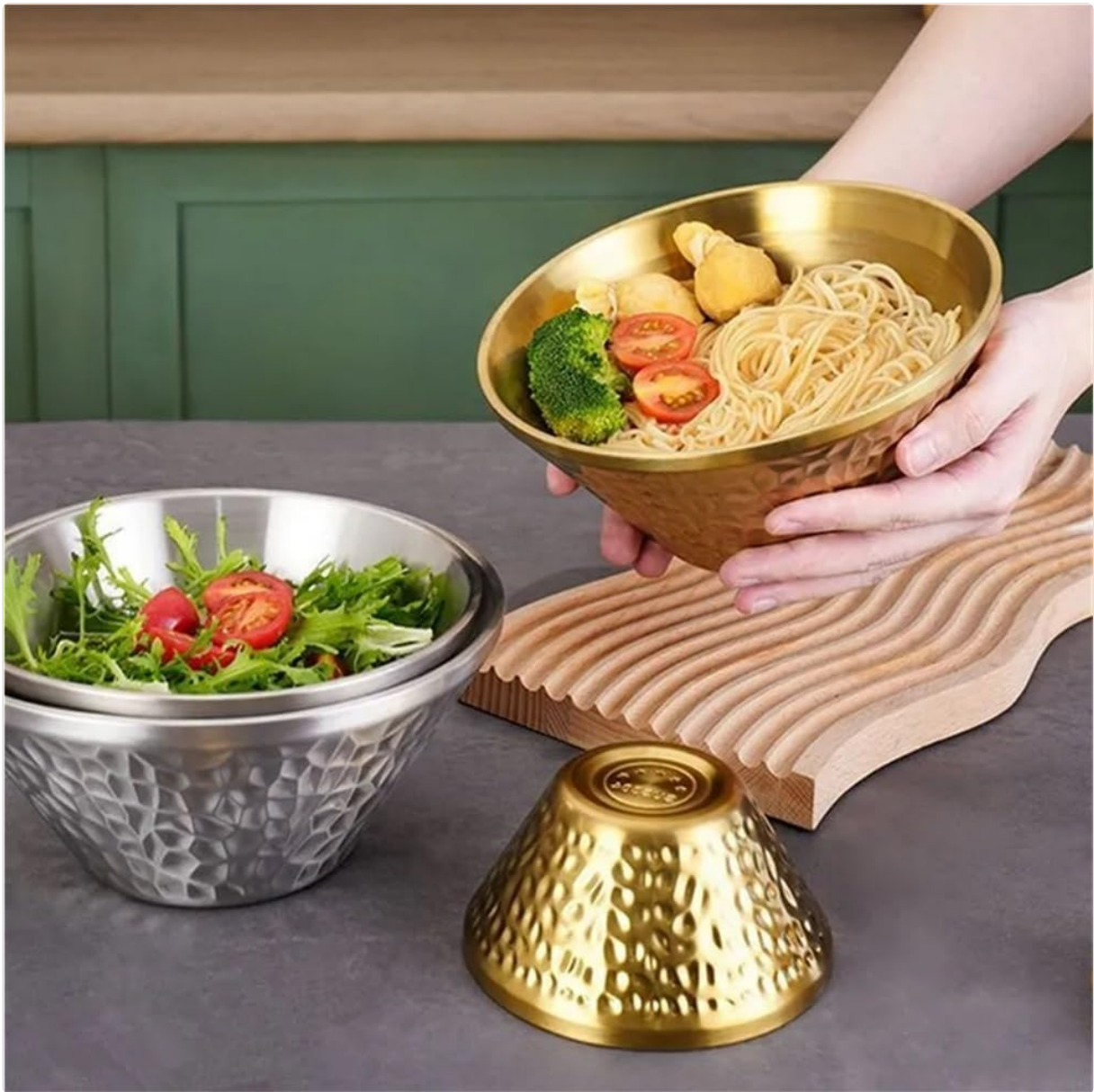
Figure 4: The bowls in use for preparing and holding different food items, highlighting their practical application in a kitchen setting.