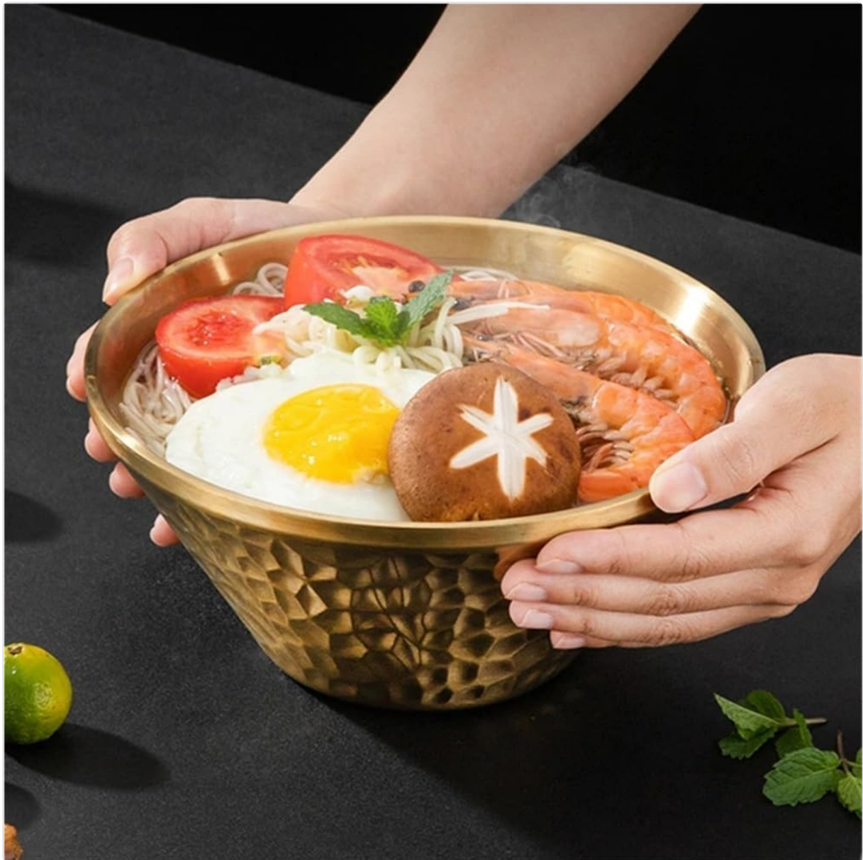
Figure 3: Example of the mixing bowl being used to hold and serve a meal, showcasing its versatility beyond just mixing.