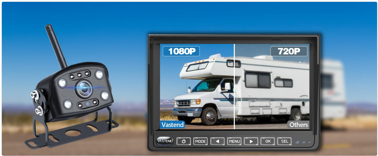
Image: All components included in the VASTEND RV Backup Camera Kit.

Video: Unboxing and overview of the VASTEND VE-7C backup camera kit components.