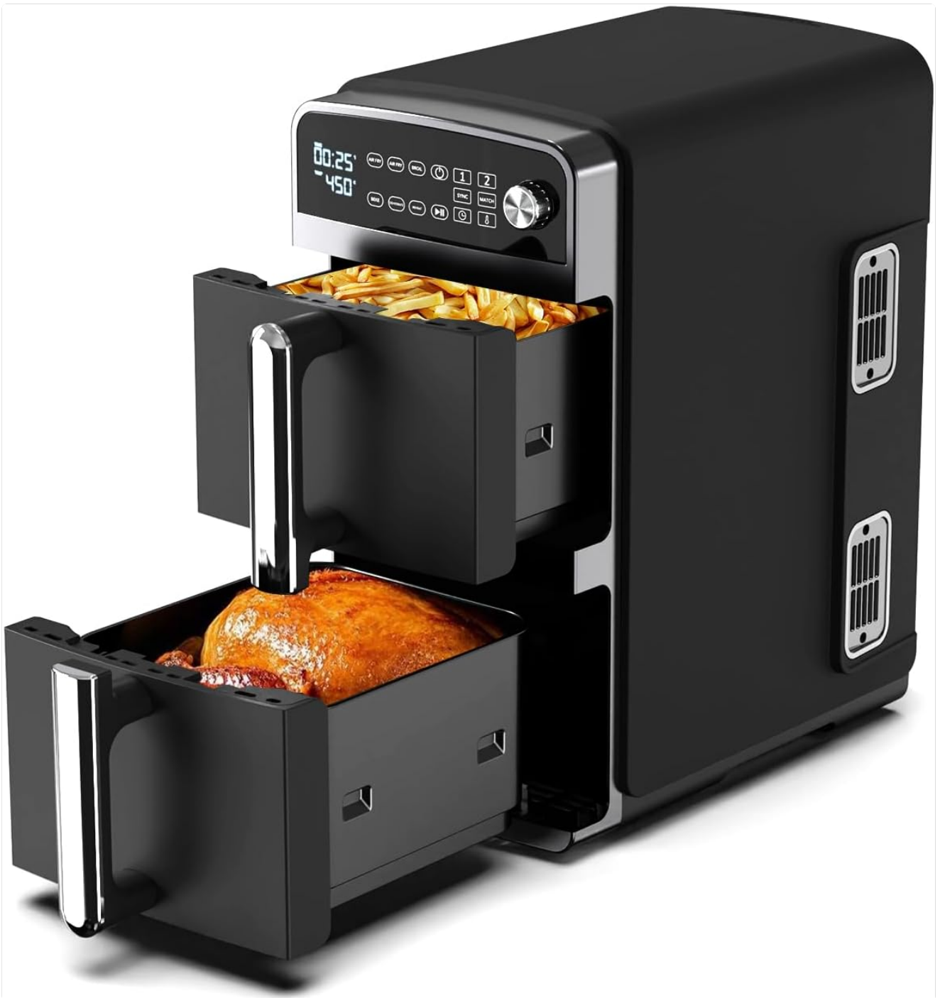
Figure 1: Front view of the Kaitoi 12QT Dual Layer Air Fryer Oven with both cooking baskets partially extended. The top basket contains french fries, and the bottom basket holds a roasted chicken, demonstrating the dual cooking capability.