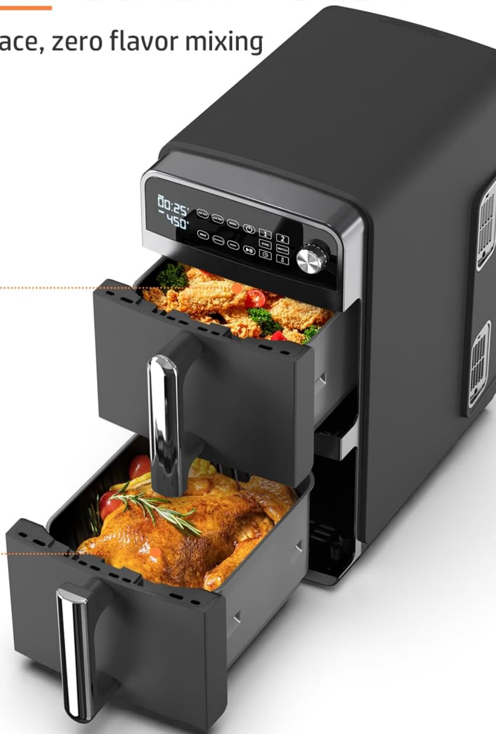
Figure 2: Illustration highlighting the two independent 6-quart air fryer baskets. The image labels the "Upper Air Fryer Basket 6QT" and "Lower Air Fryer Basket 6QT", emphasizing the vertical stacking design for increased capacity.