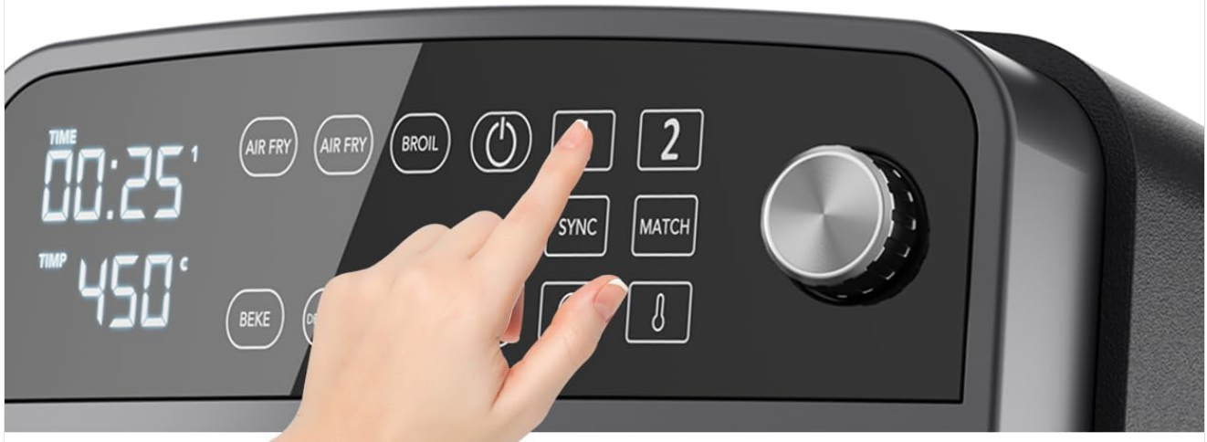
Figure 4: Detailed view of the air fryer's control panel. It displays the digital timer and temperature settings, along with touch buttons for functions like Air Fry, Broil, Bake, Reheat, Dehydrate, and Roast, and a central rotary knob for fine-tuning settings.