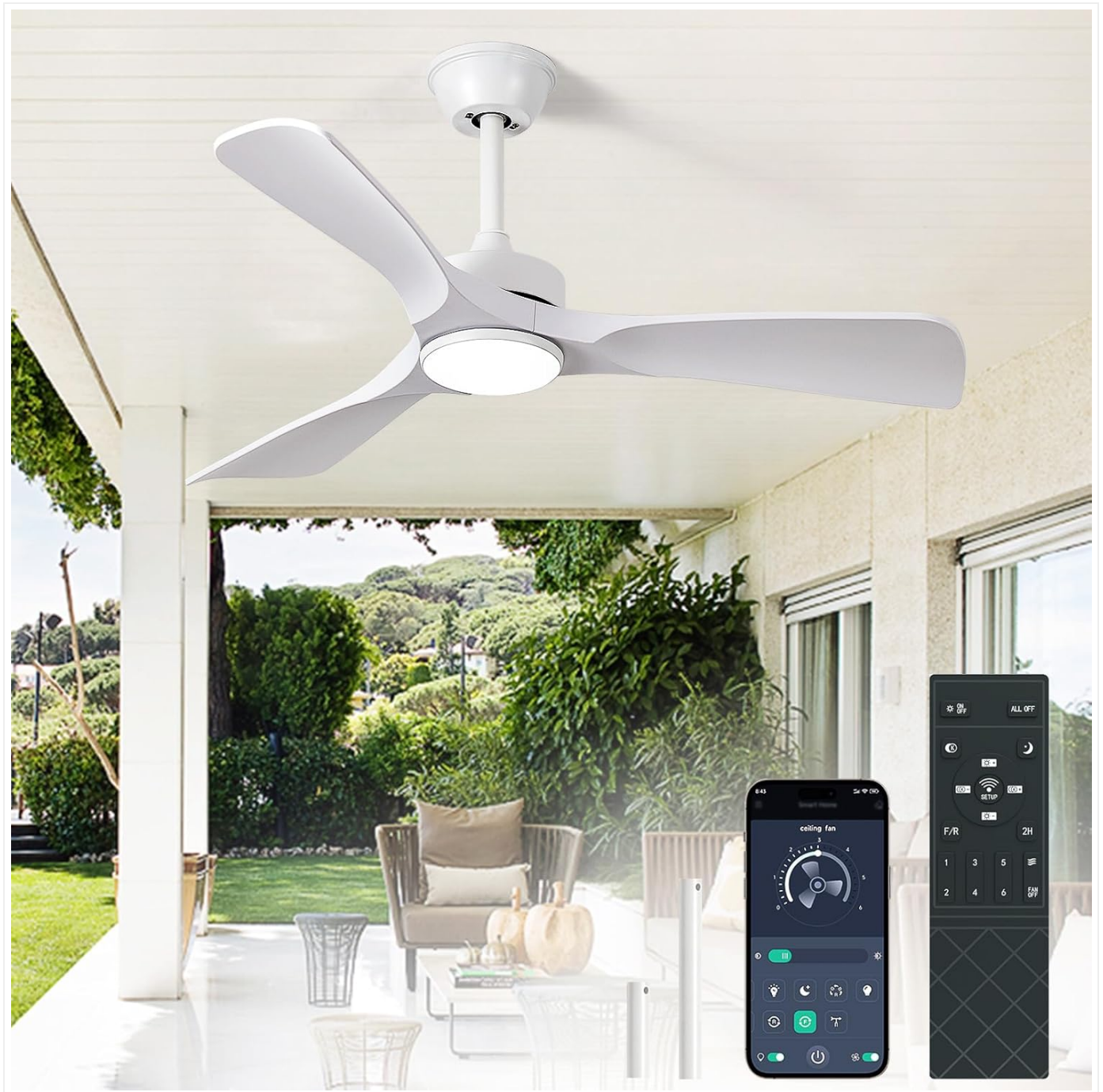
Image: Overview of the BvenuBigLite 42-inch white ceiling fan, showing the fan installed on a patio ceiling, along with its remote control and smartphone app interface.