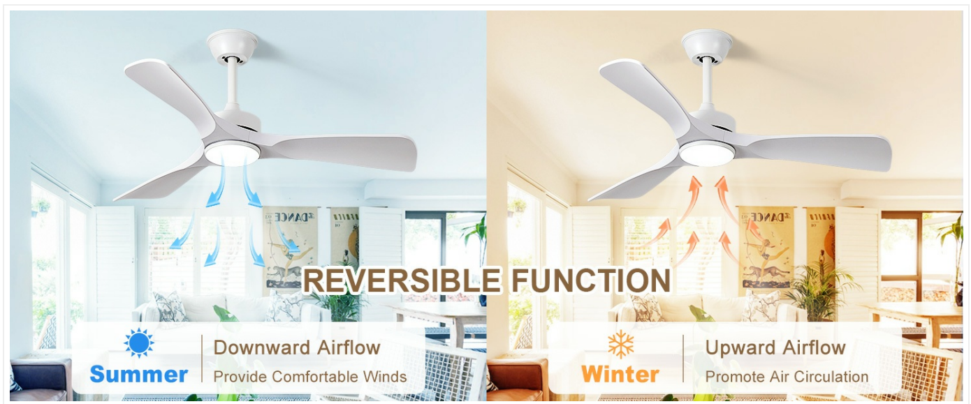
Image: Explanation of the reversible function, demonstrating how downward airflow provides cooling in summer and upward airflow promotes heat circulation in winter.