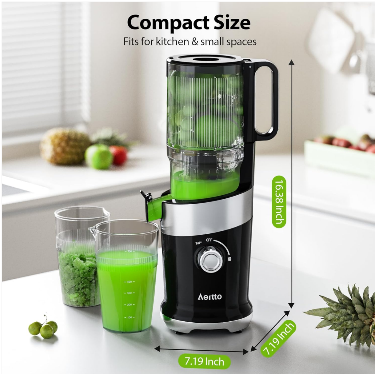
Image: This image displays the juicer's compact dimensions (16.38 inches high, 7.19 inches wide/deep), illustrating its suitability for various kitchen spaces.