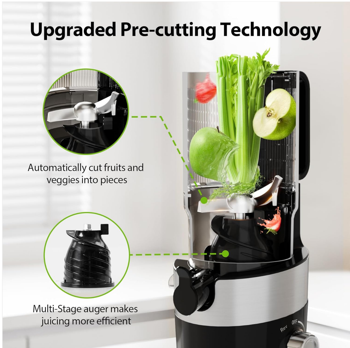
Image: This image details the internal mechanism of the juicer, specifically the pre-cutting blades that automatically chop fruits and vegetables, and the multi-stage auger designed for efficient cold pressing.