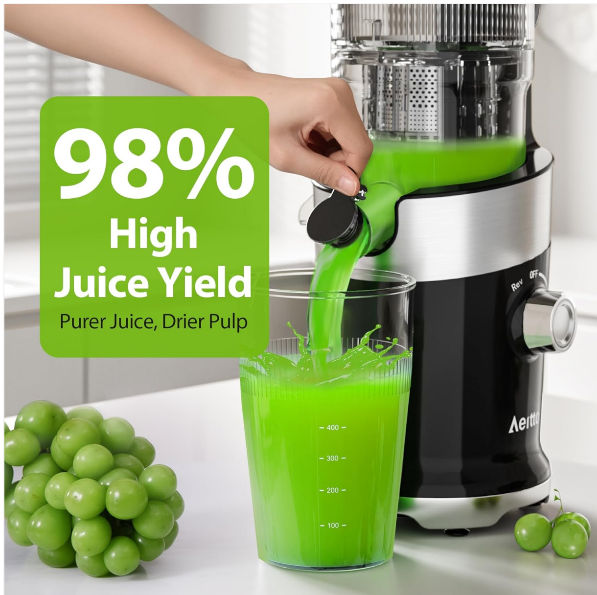
Image: This image demonstrates the juicer's high efficiency, showing a glass full of pure juice and a separate container with very dry pulp, indicating maximum extraction.