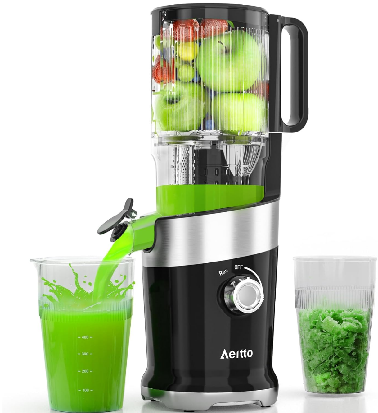
Image: The Aertto HSJ1908 Cold Press Juicer Machine in operation, showcasing its design and the juicing process. Freshly extracted green juice is visible in a glass, alongside a container for pulp.