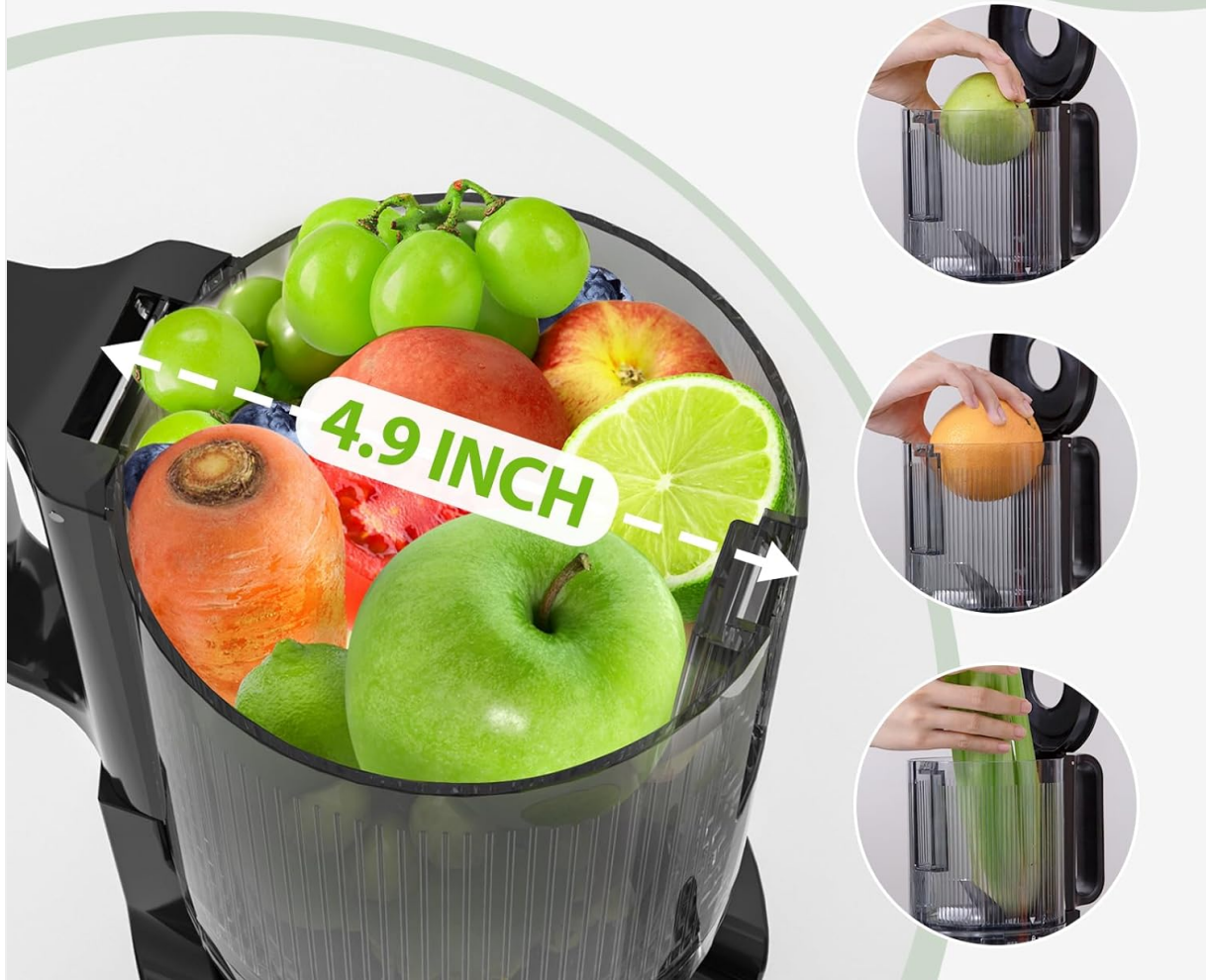
Image: This image highlights the large 4.9-inch feed chute, illustrating how it can accommodate whole or large pieces of fruits and vegetables, significantly reducing preparation time.