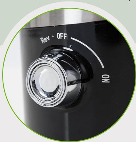
Image: This image highlights three key safety and operational features: the automatic stop mechanism when the hopper cover is opened, the anti-drip spout to maintain cleanliness, and the simple one-button control with a reverse function to prevent clogging.

Easy to operate & Reverse Function prevent clogging