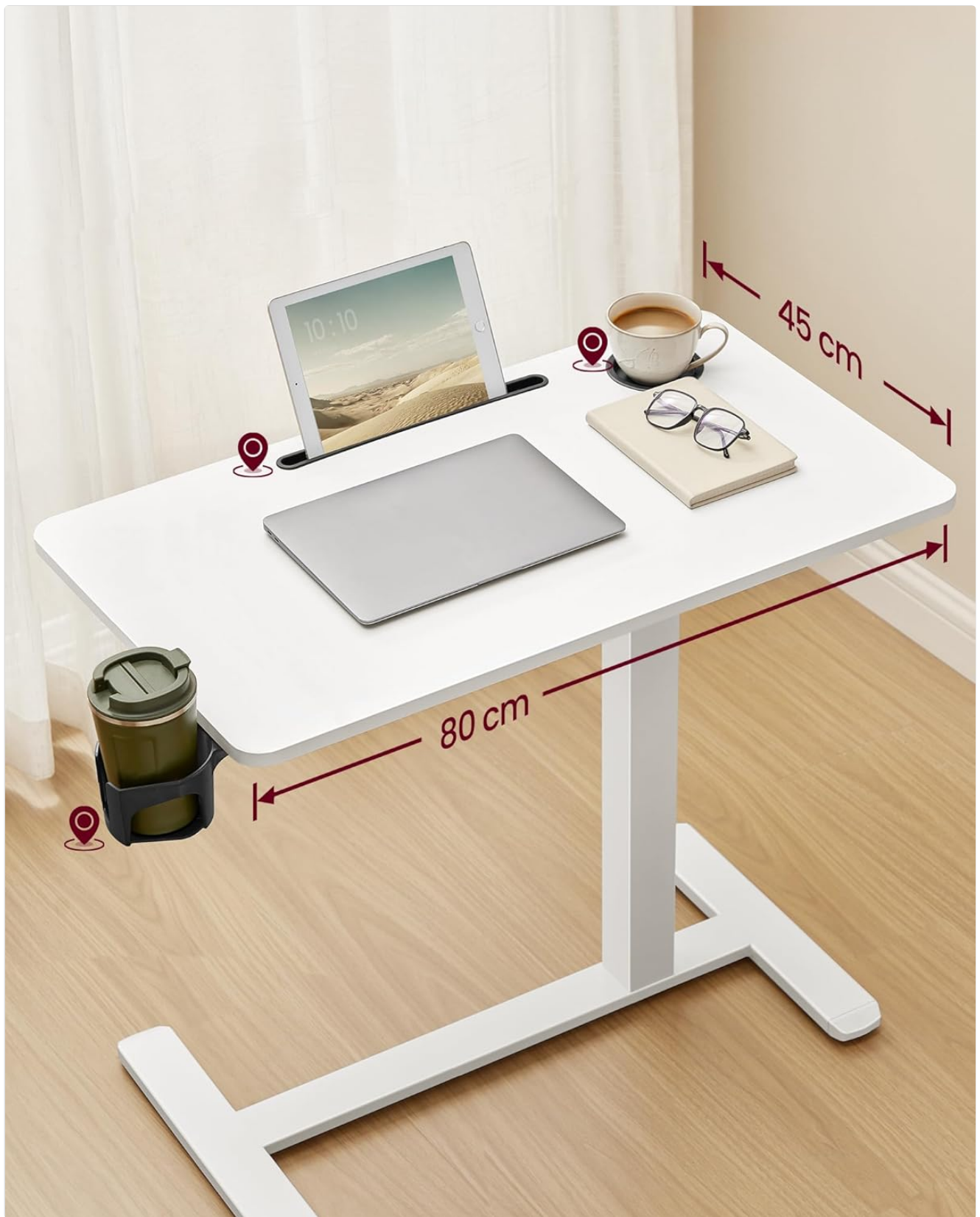
Image: A detailed view of the tabletop, measuring 80 cm in length and 45 cm in width, showcasing the integrated cup holder, a tablet/phone slot, and the rotatable side cup holder.