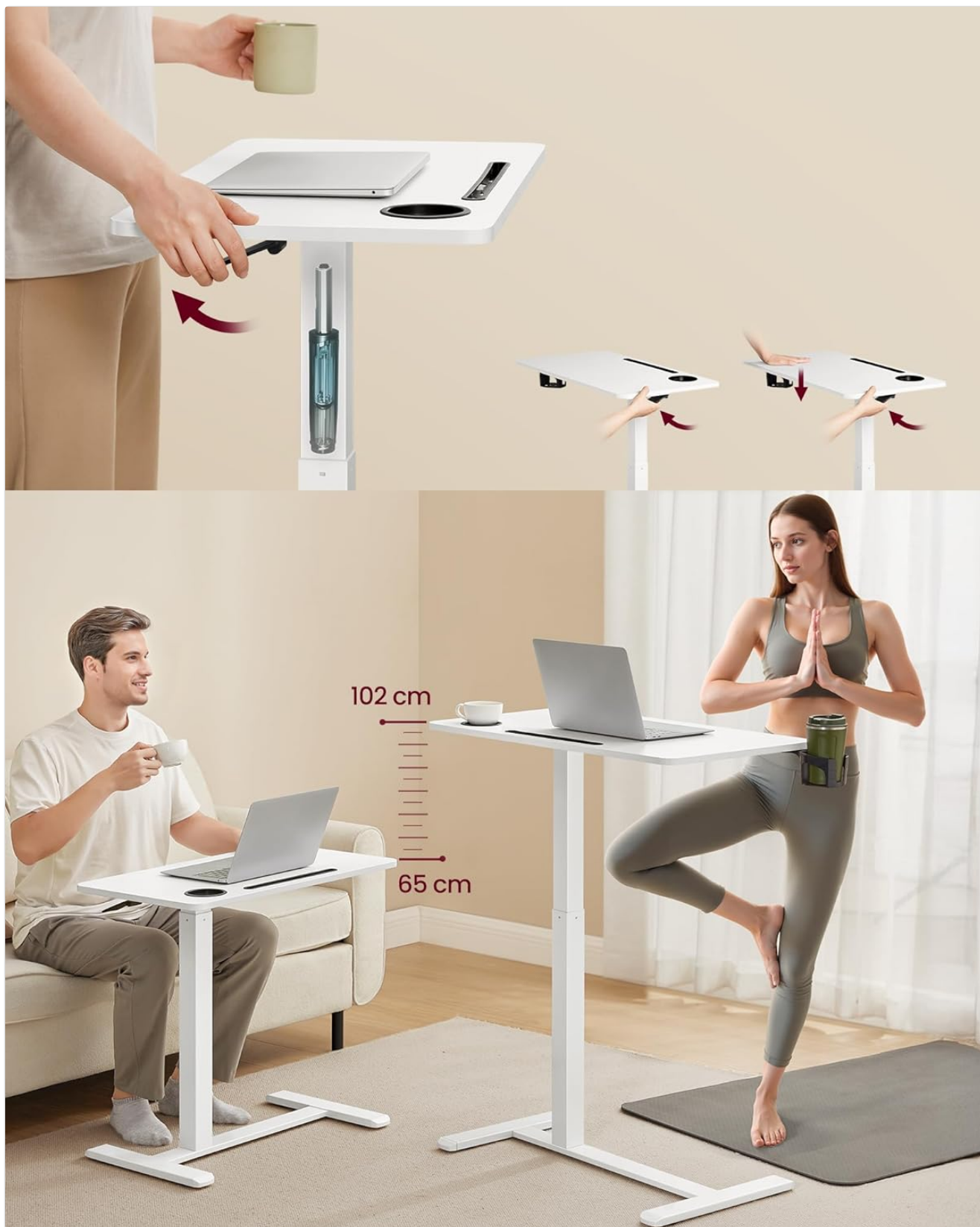
Image: A person demonstrates adjusting the table height by lifting a lever located beneath the tabletop, allowing the gas lift

The height can be adjusted smoothly between 65 cm and 102 cm.