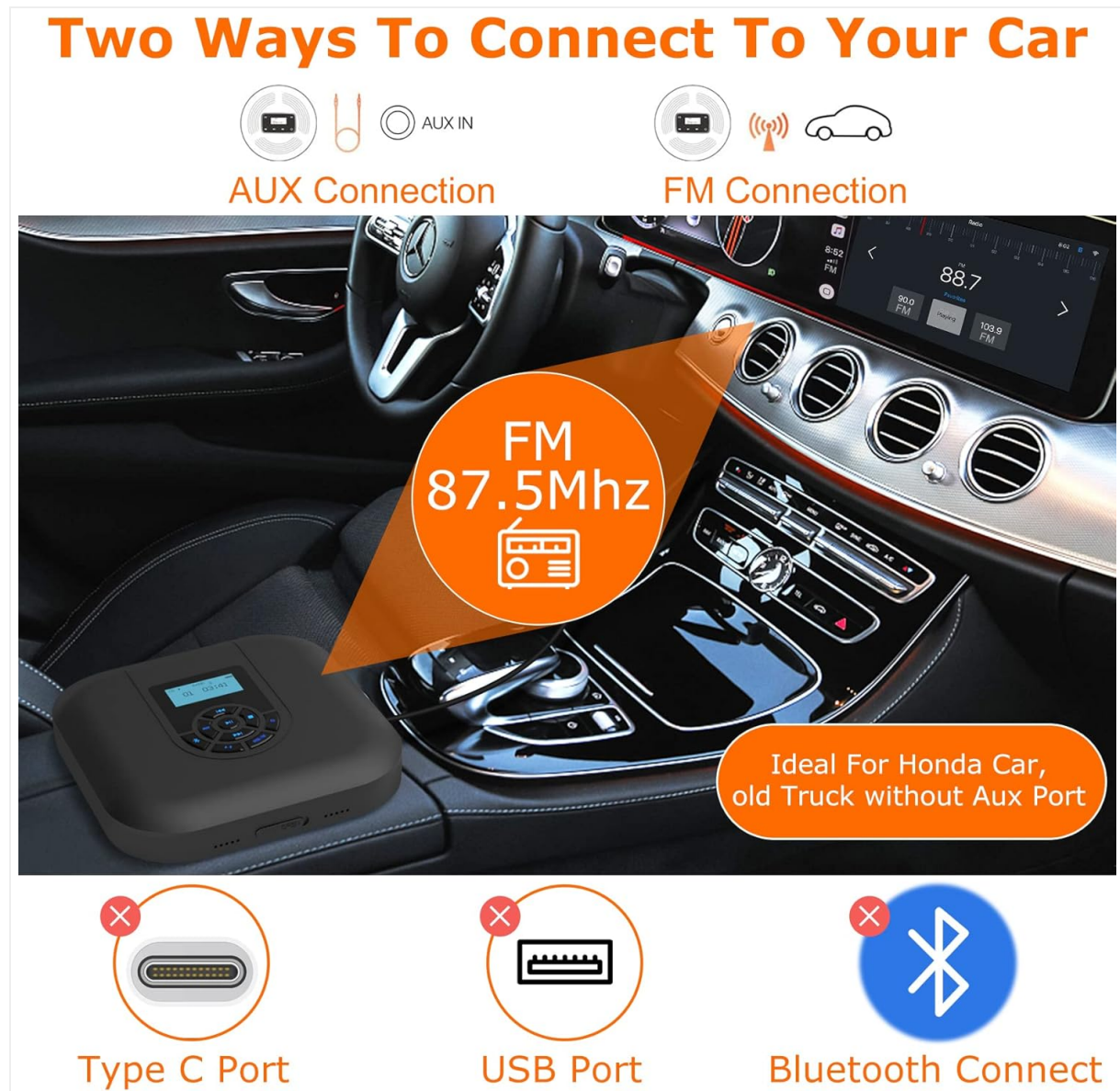
Figure 5: Car Connection Options. This image illustrates two methods to connect the CD player to a car audio system: via AUX connection or FM connection, highlighting its suitability for cars without a built-in CD player.

The player can transmit audio to an FM radio, ideal for car stereos without a CD player.