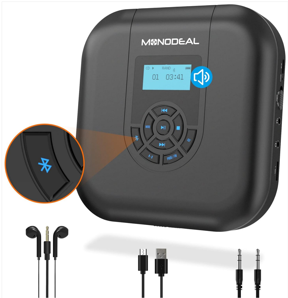
Figure 2: Front view of the MONODEAL Portable CD Player, highlighting the central control panel with playback buttons, mode selection, volume, and the digital display showing track information and battery status.

The MONODEAL Portable CD Player features a compact design with intuitive controls. It includes a digital display for track information, battery status, and mode indicators. Key features include: