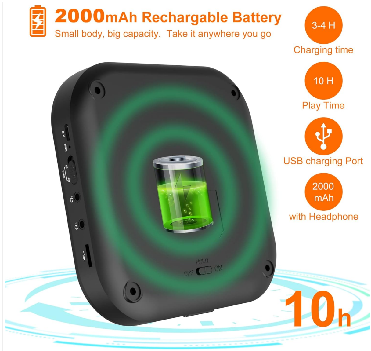
Figure 3: Battery and Charging. This image illustrates the 2000mAh rechargeable battery capacity, indicating a charging time of 3-4 hours and a play time of up to 10 hours with headphones, using the USB charging port.

Before first use, fully charge the CD player. Connect the supplied USB-C charging cable to the device's USB-C port and the other end to a USB power adapter (not included) or a computer's USB port. The charging indicator light will show the charging status. A full charge typically takes 3-4 hours and provides up to 10 hours of playback with headphones.