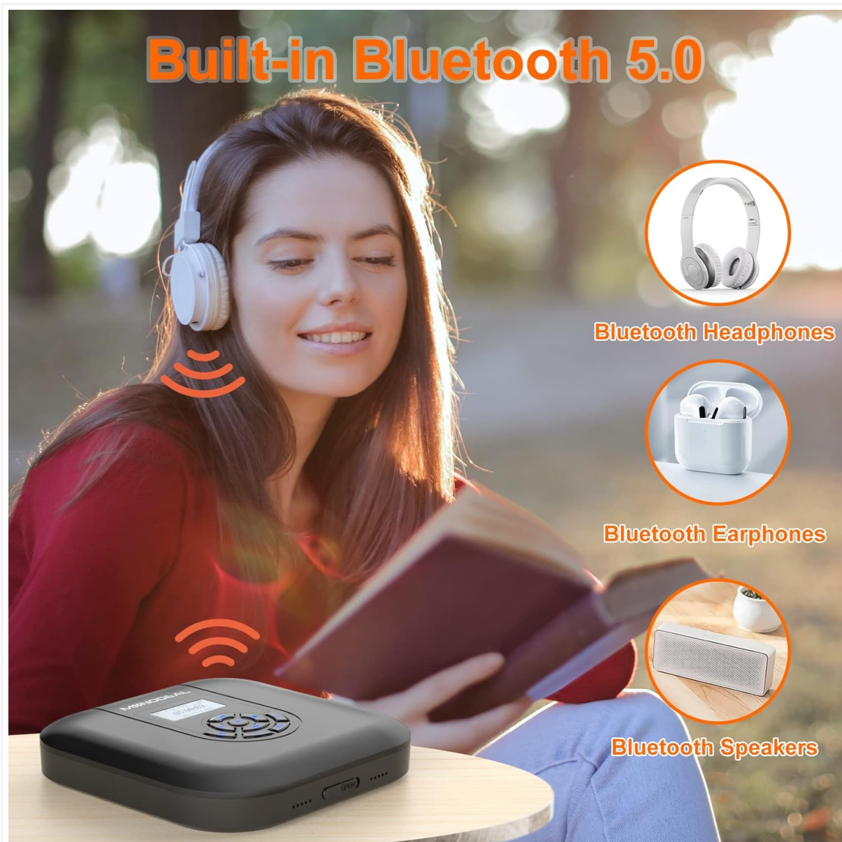
Figure 4: Bluetooth Connectivity. This image demonstrates the player's built-in Bluetooth 5.0, showing its compatibility with Bluetooth headphones, earphones, and speakers, with a woman enjoying music wirelessly.