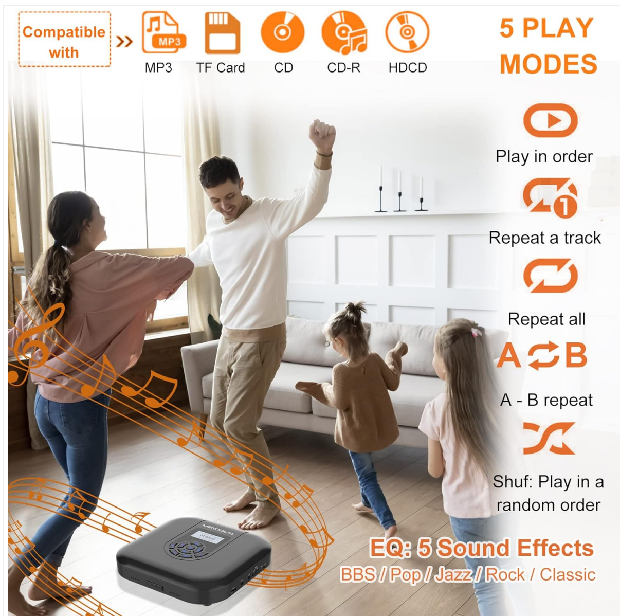
Figure 6: Play Modes and EQ. This image shows a family enjoying music, with text detailing the 5 available play modes (Play in order, Repeat a track, Repeat all, A-B repeat, Shuffle) and 5 EQ sound effects (BBS, Pop, Jazz, Rock, Classic).