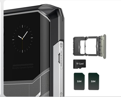
Image: The smartphone displaying face unlock and a detailed view of the triple card slot for two SIM cards and one TF card.