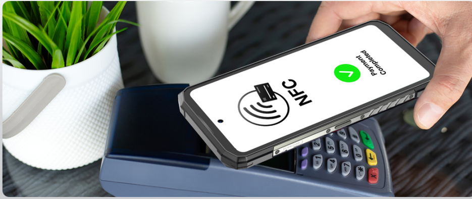
Image: The smartphone displaying an NFC payment icon, positioned over a card payment terminal, indicating a successful transaction.