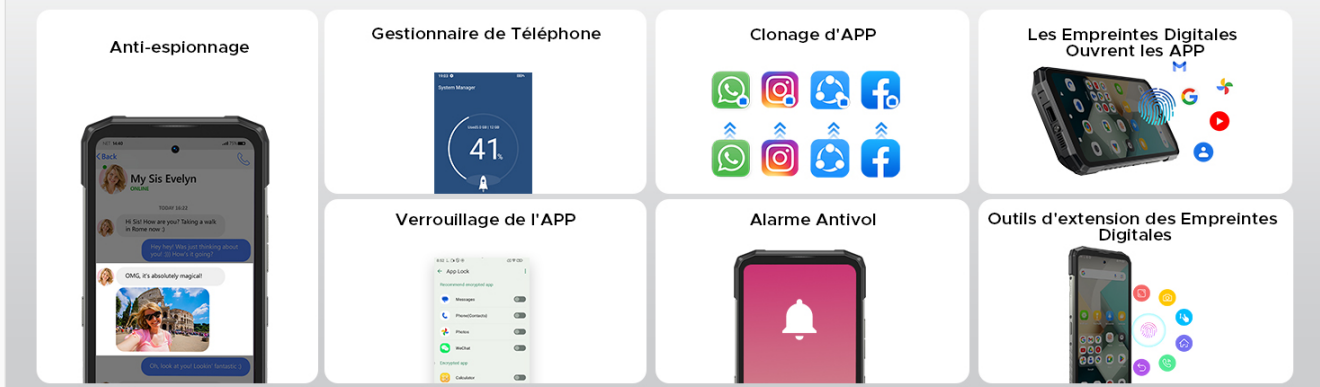
Image: A composite image showcasing various Android 14 privacy and security features on the Blade 20 Ultra, including anti-espionnage, app management, and fingerprint tools.