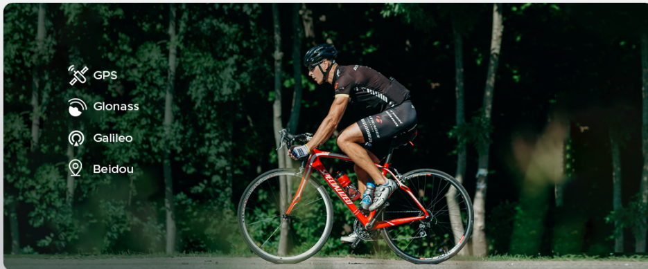
Image: A cyclist riding through a forest, with icons for GPS, Glonass, Galileo, and Beidou overlaid, emphasizing the phone's precise navigation system.