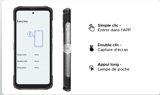
Image: The Blade 20 Ultra with a diagram illustrating the customizable side button's functions: single click for app entry, double click for screenshot, and long press for flashlight.