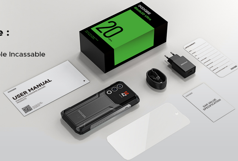
Image: Unboxing display of the DOOGEE Blade 20 Ultra kit, showing the smartphone, charger, USB cable, protective film, user manual, and warranty card.