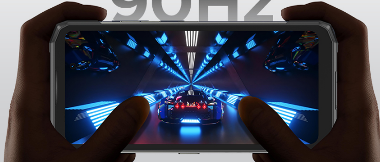
Image: A user holding the Blade 20 Ultra horizontally, engaged in a racing game, demonstrating the 6.6-inch 90Hz display's performance.