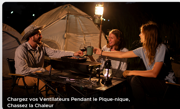
Image: Two scenarios illustrating OTG reverse charging: sharing power for navigation during a night hike and charging fans during a picnic.