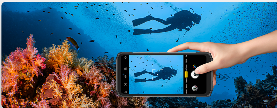
Image: A hand holding the Blade 20 Ultra underwater, capturing a diver and marine life, demonstrating its underwater photography capability.

Ouvrez des Perspectives Différentes sur la Vie