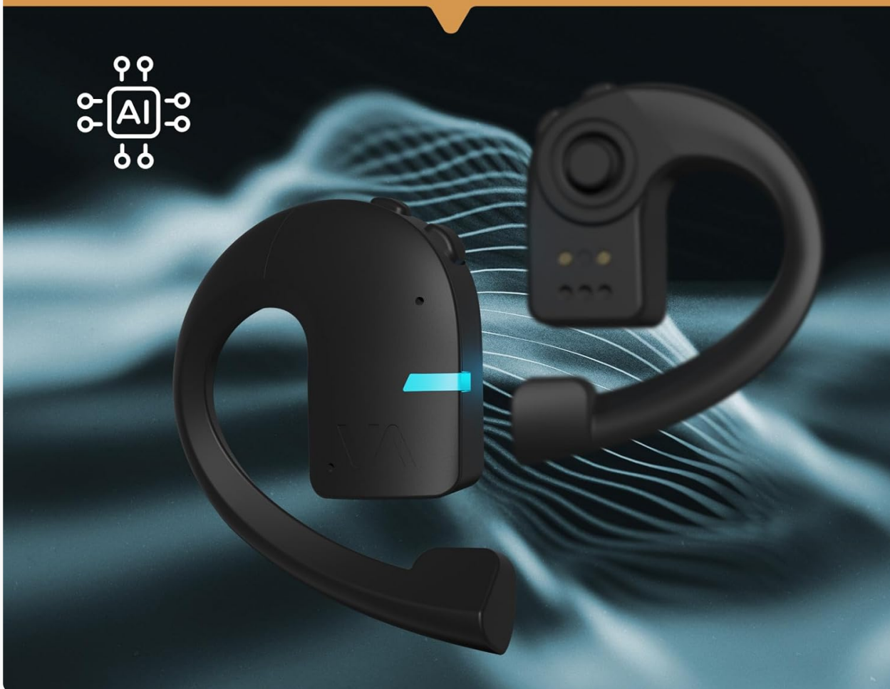
Figure 1.2: Visual representation of the AI algorithms that power the Vasco Translator E1 for unmatched translation accuracy.

The most innovative AI algorithms provide unmatched translation accuracy