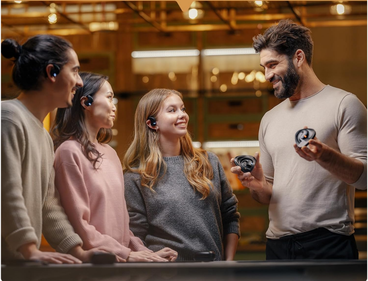
Figure 3.2: Individuals participating in a conversation using the touchless translation mode of the Vasco Translator E1, maintaining a natural interaction.

Use the touchless translation mode to keep the natural flow in every conversation