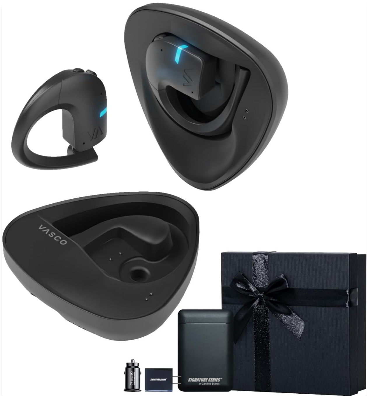
Figure 1.1: Vasco Translator E1 earbuds and their charging case, showcasing the sleek design.