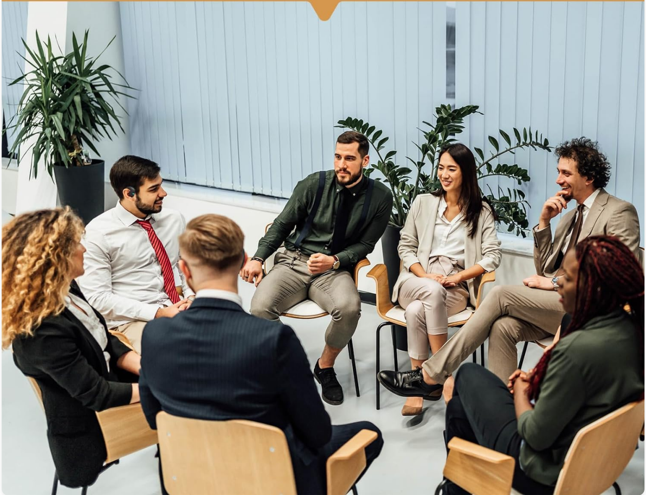
Figure 3.3: A group meeting where participants are utilizing the Vasco Translator E1 earbuds to facilitate communication across multiple languages.

Use up to 10 languages in one conversation. Multilingual meetings have never been easier!