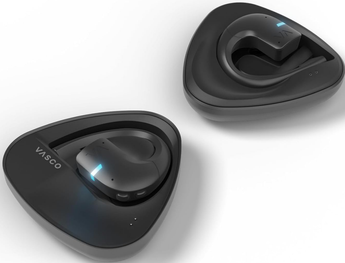
Figure 2.2: The Vasco Translator E1 earbuds securely seated within their charging case, ready for charging.