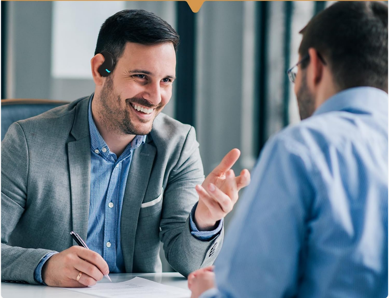
Figure 3.1: A user engaging in a hands-free business conversation with the aid of Vasco Translator E1 earbuds.

Use hands-free communication to seal the best international deals.