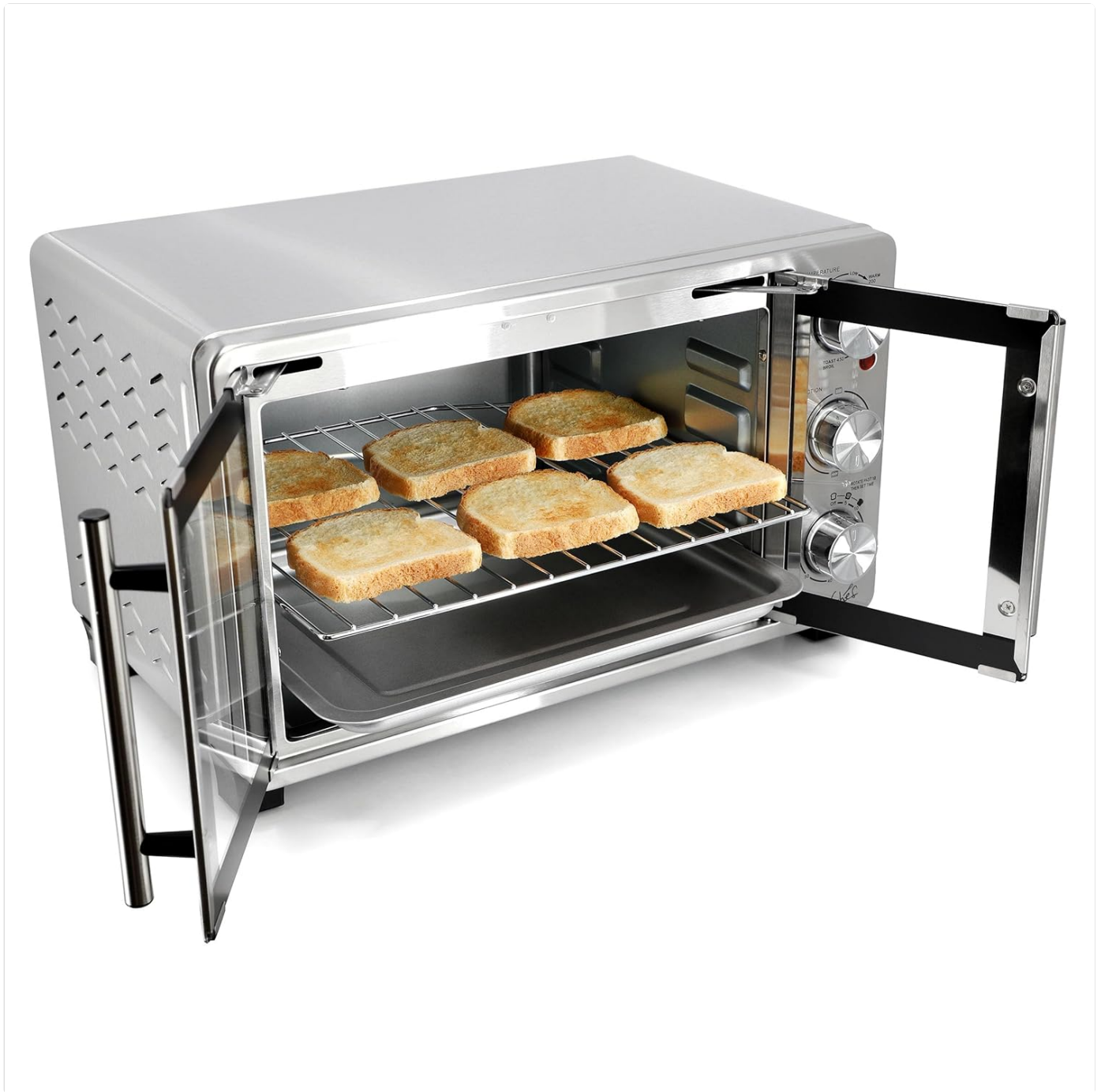
Image: The MegaChef Toaster Oven with its French doors open, revealing perfectly toasted bread slices on the wire rack, demonstrating the toast function.