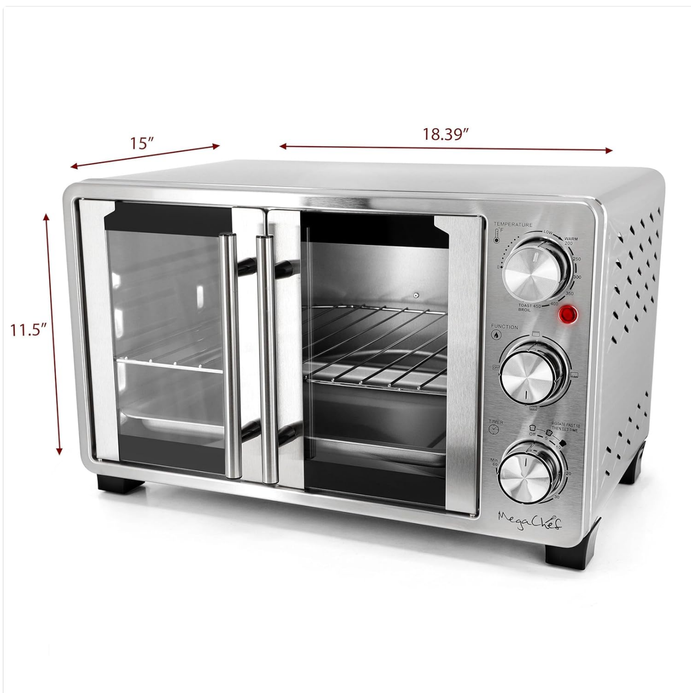
Image: The MegaChef Toaster Oven with its key dimensions (depth, width, height) clearly labeled, providing a visual reference for its size.