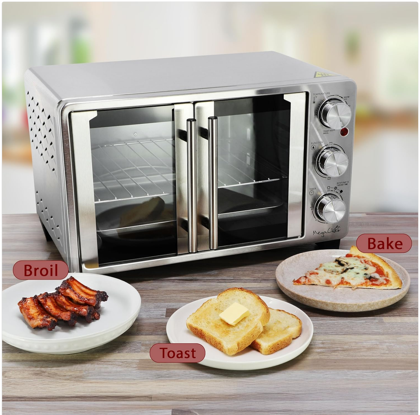
Image: The MegaChef Toaster Oven with examples of food prepared using its different functions: broiled ribs, baked pizza, and toasted bread slices.