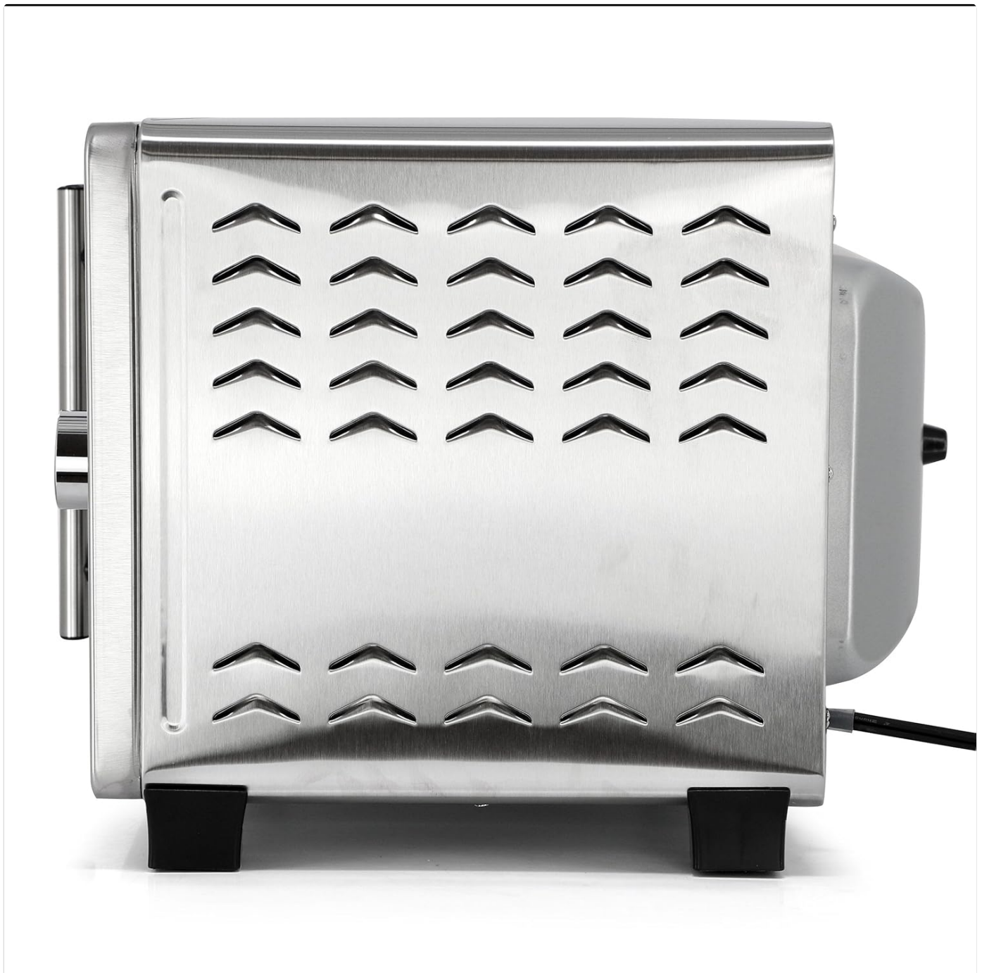
Image: Side view of the MegaChef Toaster Oven, highlighting the ventilation vents on the side panel, crucial for proper airflow during operation.