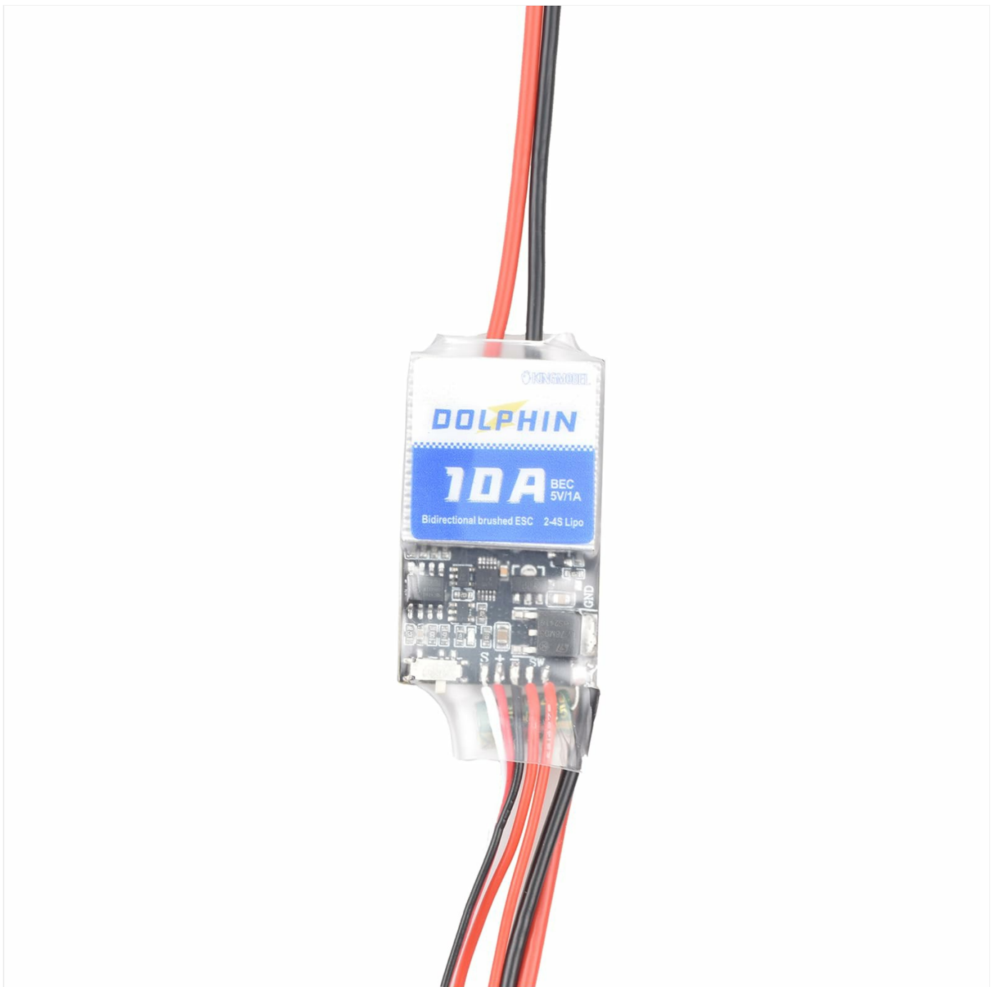
Image: The KINGMODEL 10A RC Bidirectional Brushed ESC, showing the main unit, power wires, motor wires, receiver connection, and an external switch.