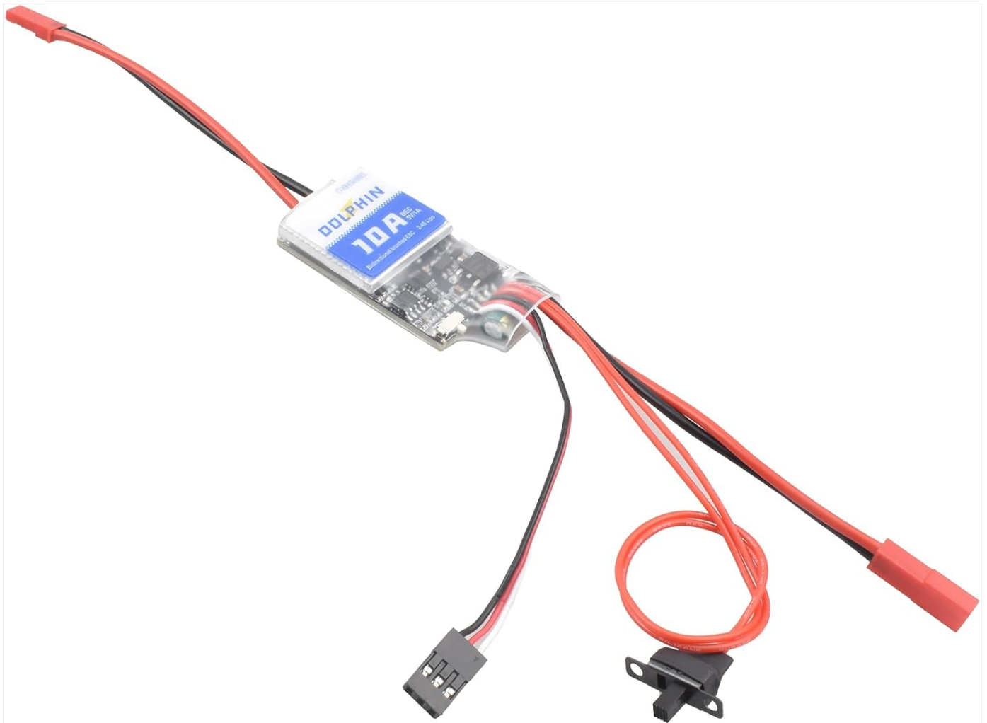
Image: The ESC with its various wires clearly visible, illustrating the connections for battery, motor, and receiver.