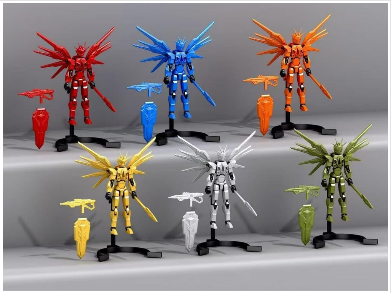
Image 6.1: A collection of T13 figures in different color variants, showcasing their design and accessories.