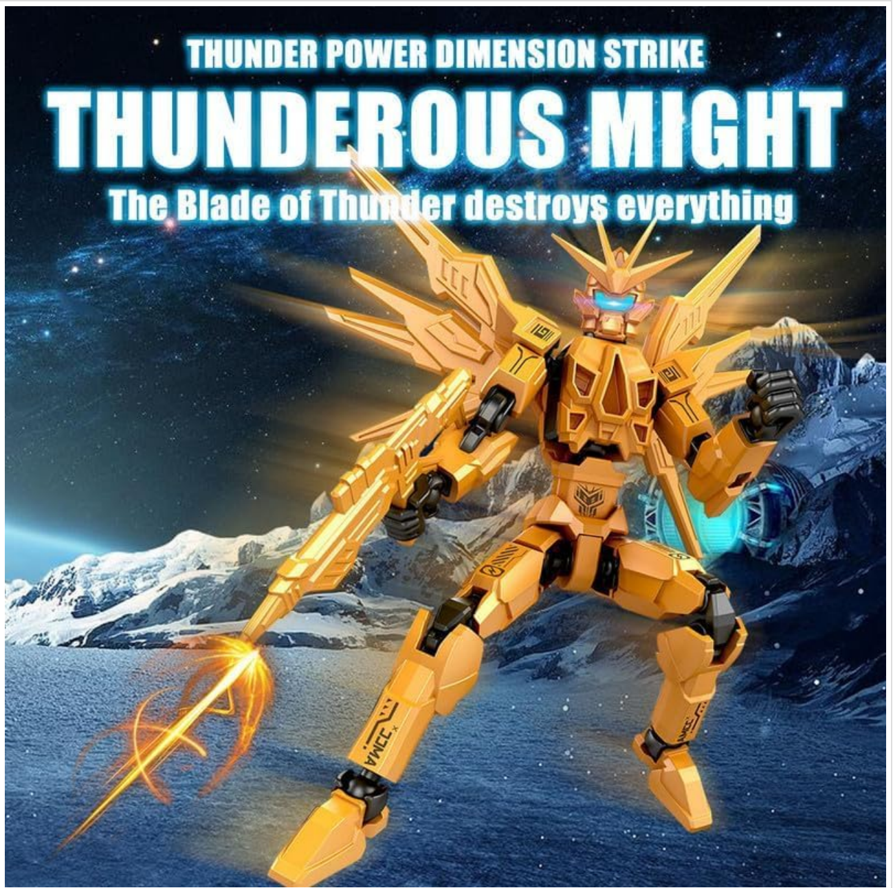
Image 3.2: Example of a T13 figure in an action pose with accessories.