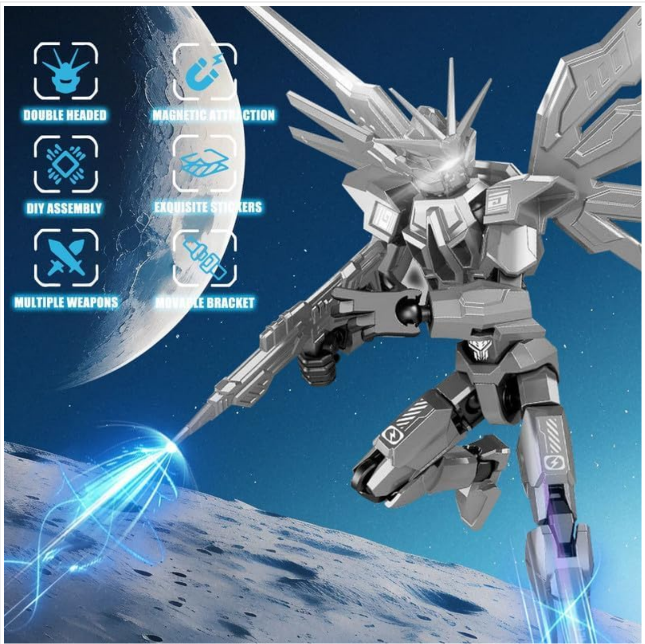
Image 2.2: Features of the T13 figure, including the movable bracket for display.