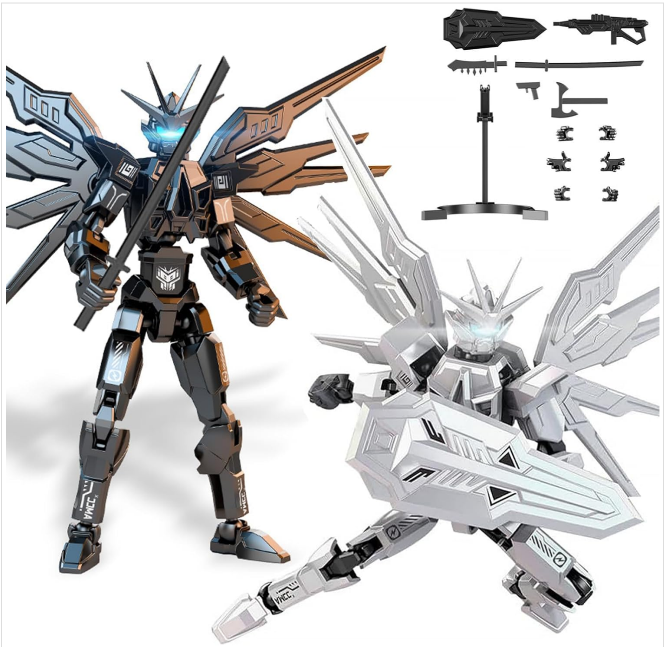
Image 1.1: Overview of the T13 Titan 13 Action Figure 2-Pack, showing both figures and included accessories.