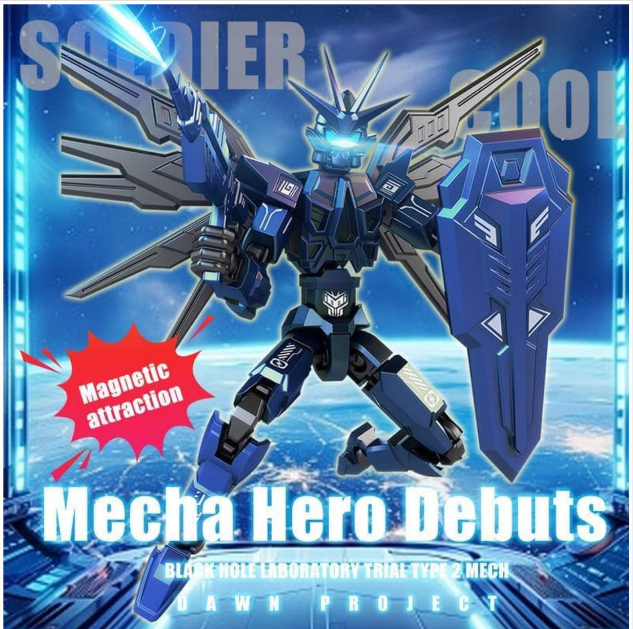
Image 3.3: A blue T13 figure demonstrating magnetic attraction for stability.