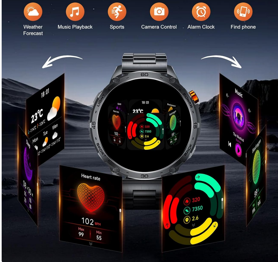
Image: The LIGE TX2-A smartwatch showing an incoming call interface and various app notification icons, highlighting its communication features.