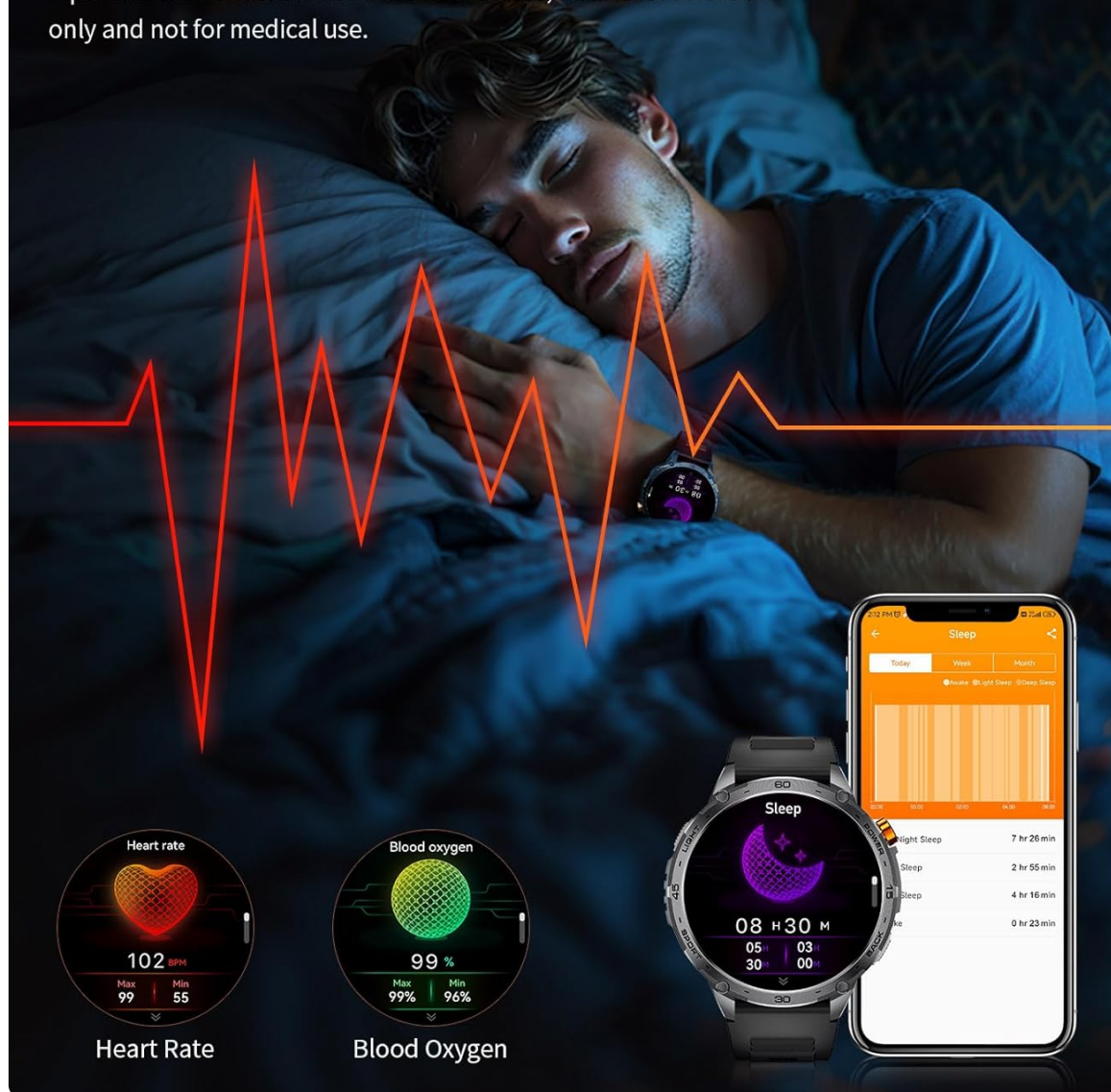
Image: The LIGE TX2-A smartwatch showing its health monitoring capabilities, including heart rate, blood oxygen, and sleep tracking data.

Tips: This smartwatch is not a medical device, data is for reference only and not for medical use.