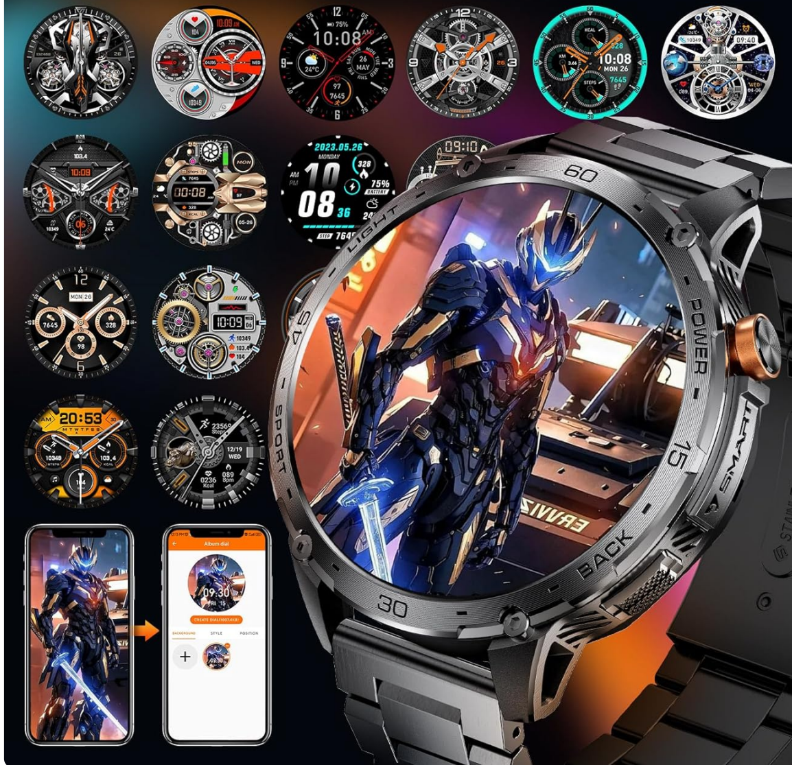
Image: The LIGE TX2-A smartwatch showcasing a selection of its 250+ customizable watch faces, including digital and analog styles.