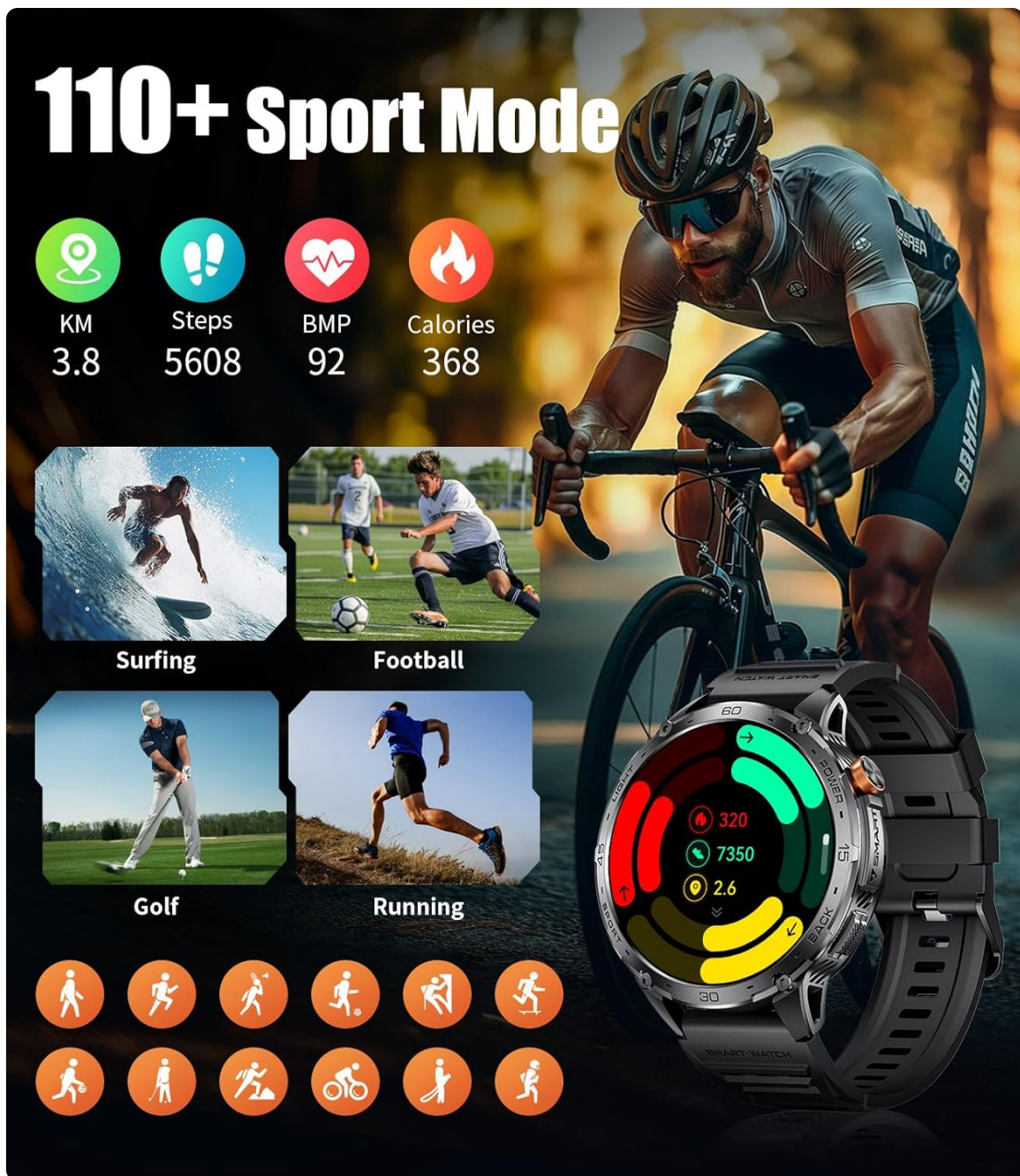
Image: The LIGE TX2-A smartwatch showcasing its extensive range of sport modes, with icons for activities like surfing, football, golf, and running, along with tracking metrics.

Your browser does not support the video tag.