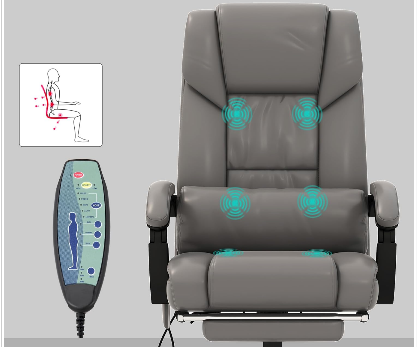
Image: Diagram showing the 6 vibration points in the chair and the remote control for massage and heat functions.