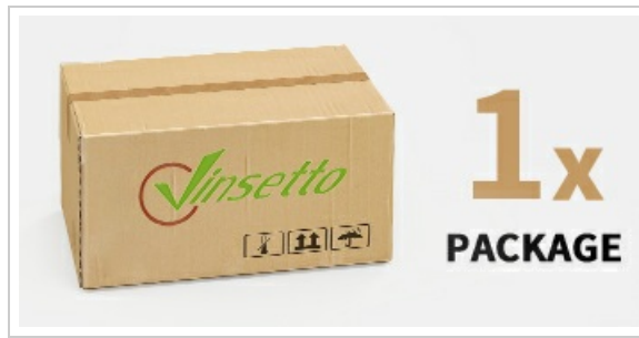
Image: A brown cardboard box labeled "Vinsetto" indicating 1x package.