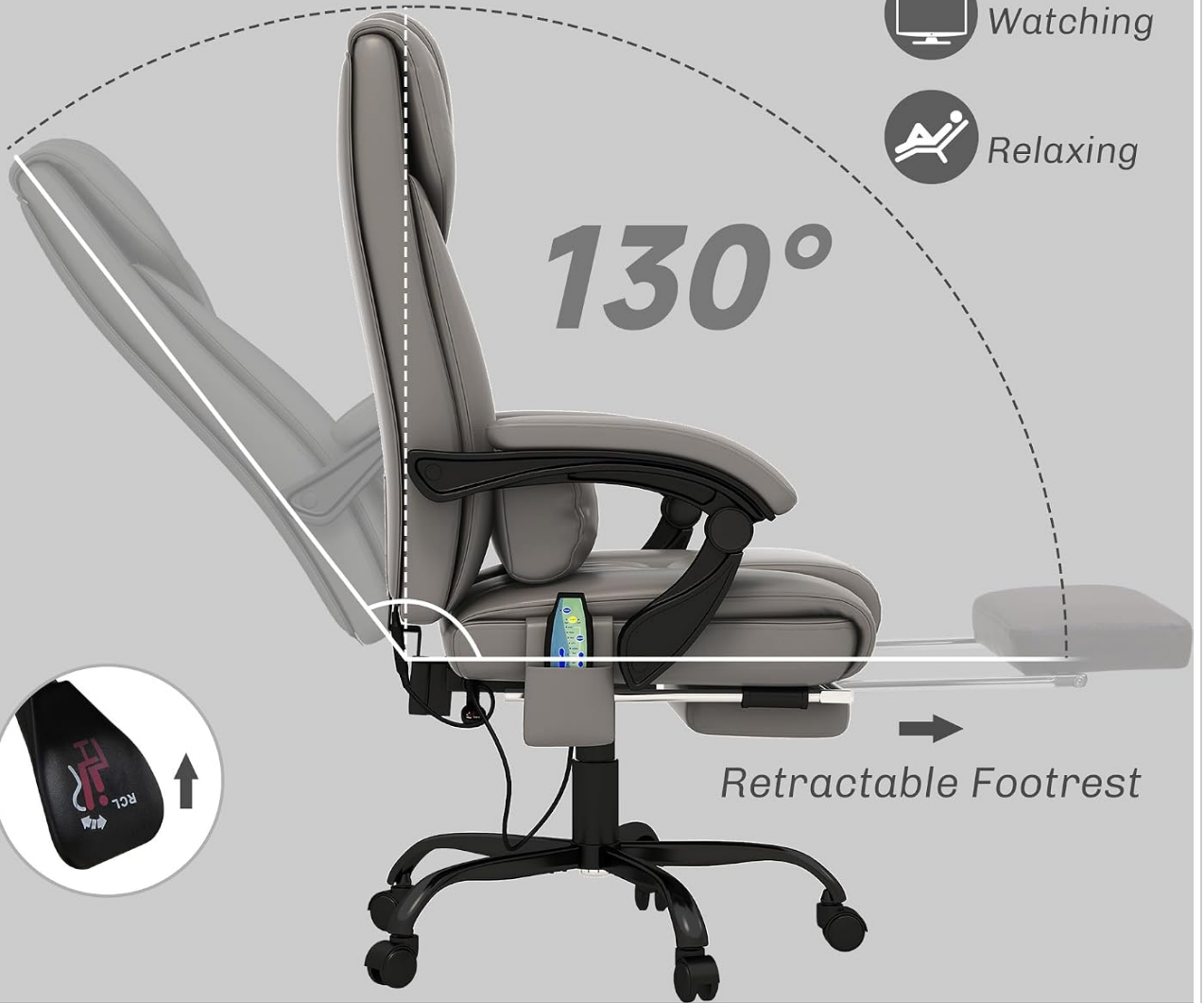
Image: Diagram showing the height adjustment lever and its function.