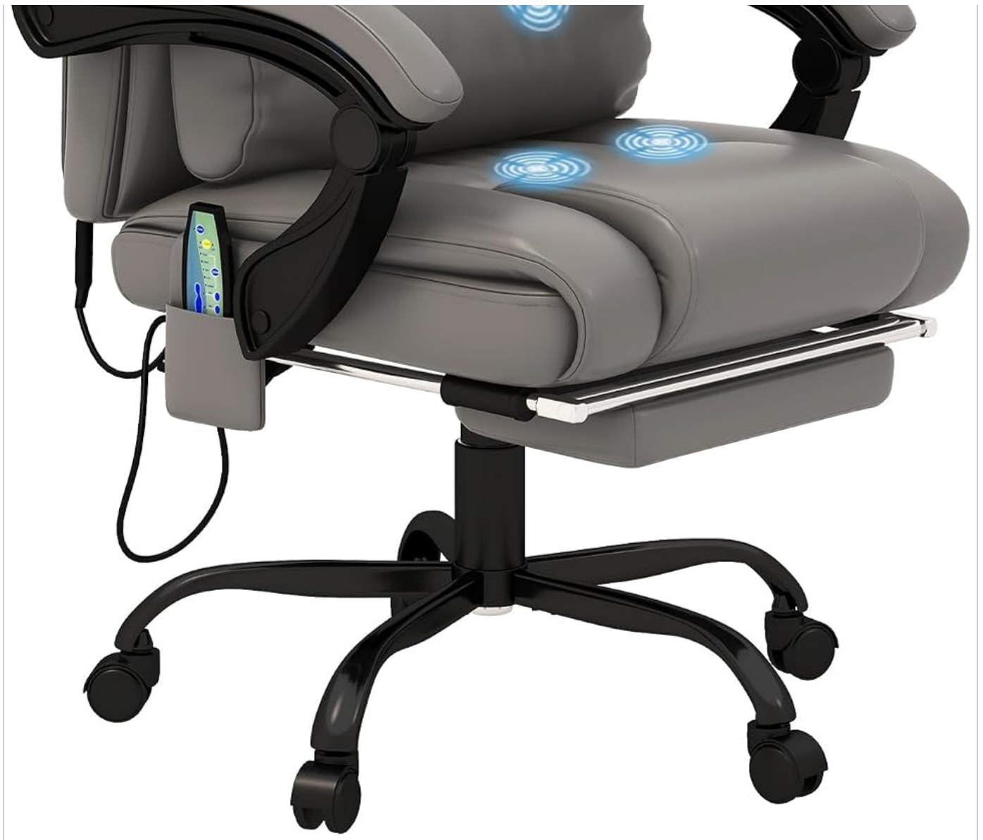
Image: The Vinsetto High Back Massage Office Chair in Grey, positioned in a modern office setting.